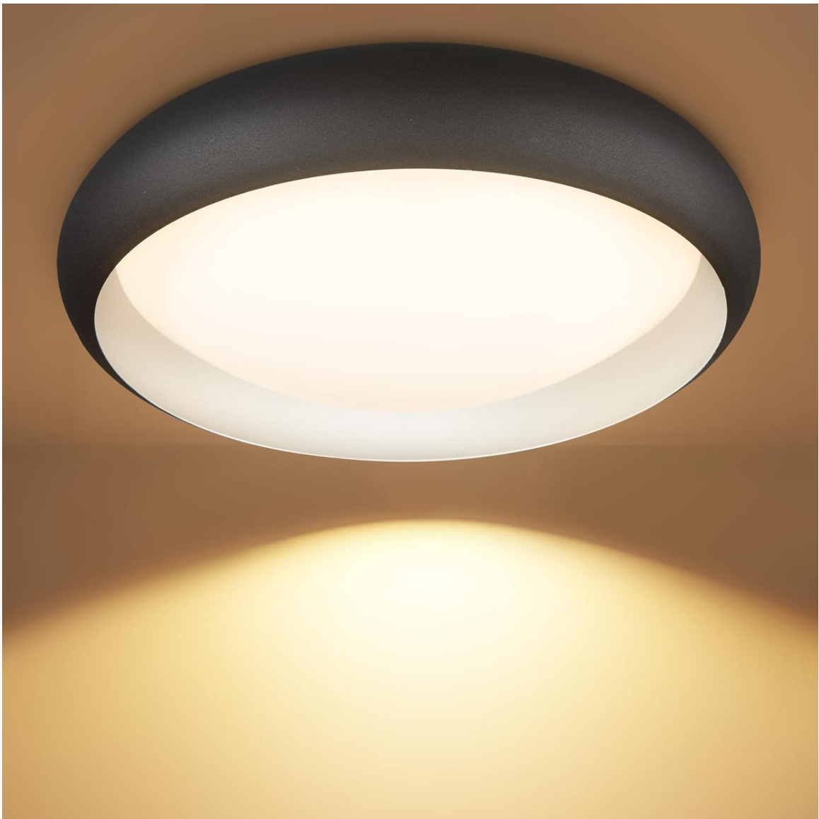
Image 2: The Hamilyeah flush mount LED ceiling light installed and illuminated. This shows the light's appearance when operational.