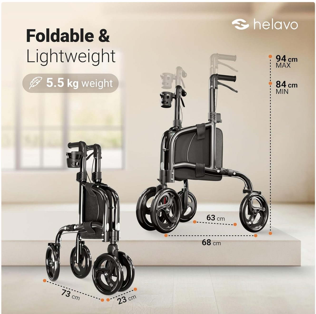
Image 4.2: The walker shown in both folded and unfolded states, highlighting its compact design and dimensions.