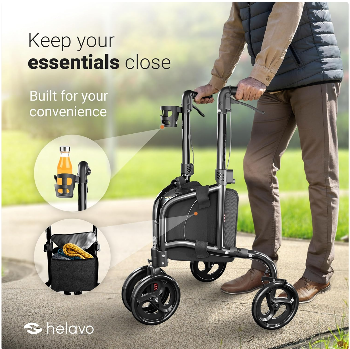
Image 5.5: The walker includes a cup holder and a spacious transport bag for convenience.