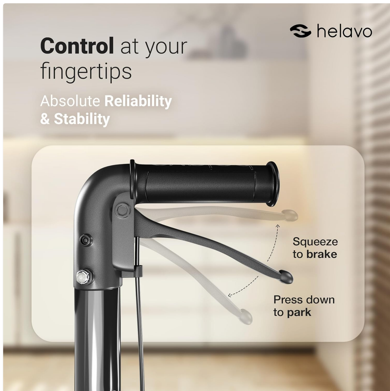
Image 5.2: Brake levers for controlling speed and engaging the parking brake.