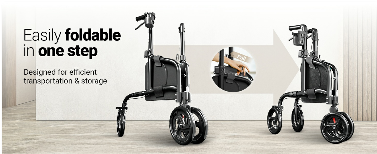
Image 5.4: The walker features an easy one-step folding mechanism for transport and storage.

Designed for efficient transportation & storage