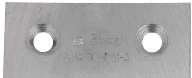
Image: A set of four new, silver-colored reversible blades, each with two circular holes for mounting. The blades are rectangular with rounded corners.