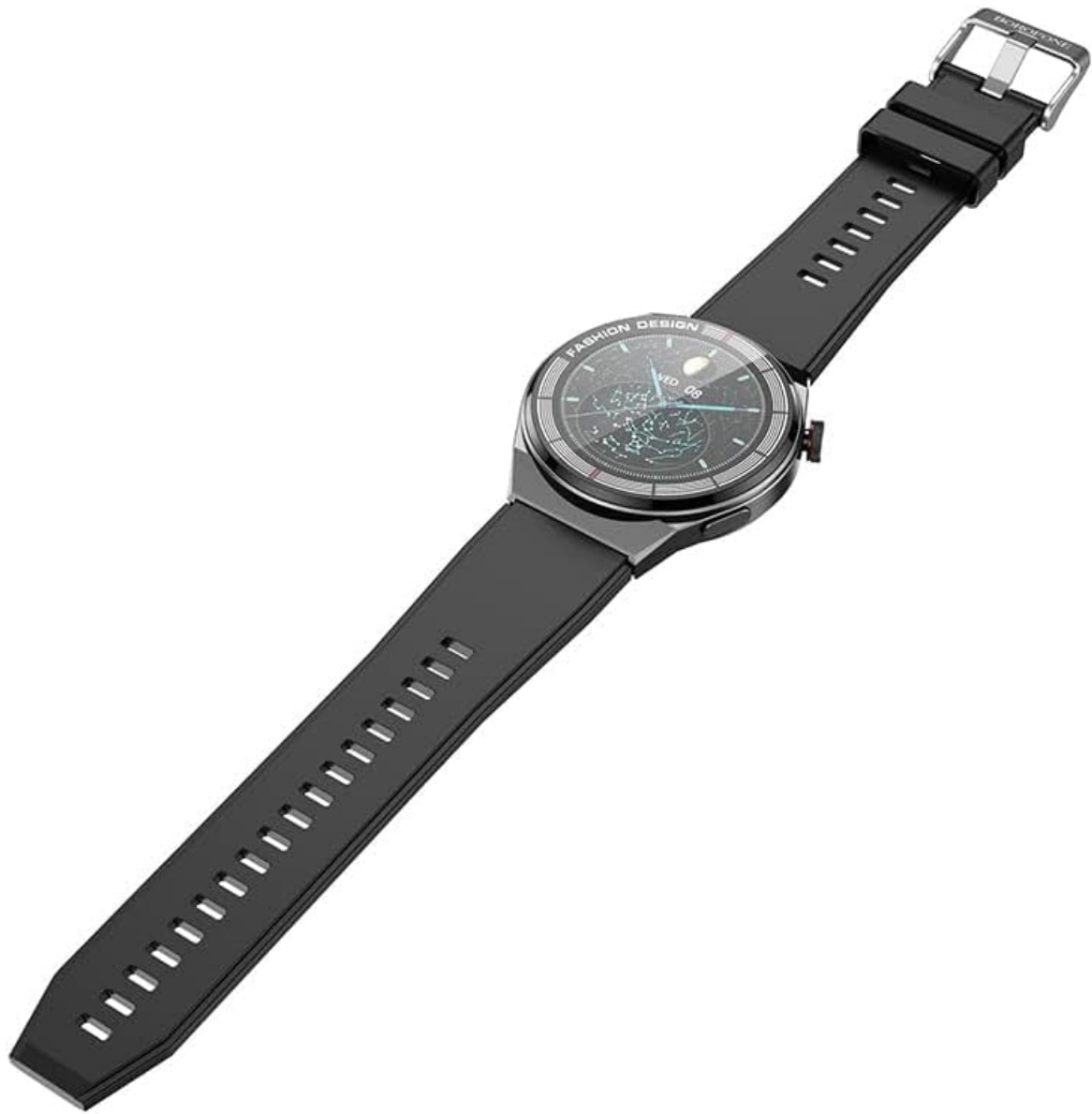
Image 2.1: Side view of the BOROFONE BD2 Smart Sports Watch, showing the strap and profile.