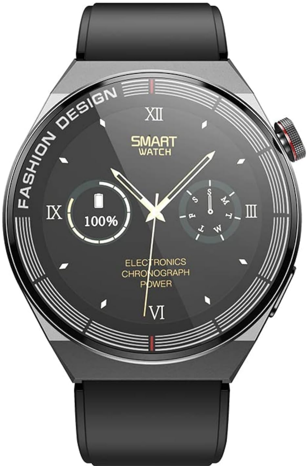
Image 1.1: Front view of the BOROFONE BD2 Smart Sports Watch, showcasing its round display and sleek design.