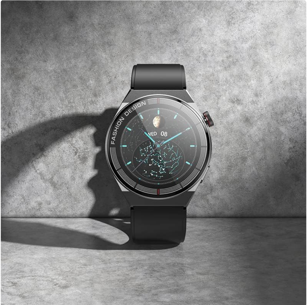
Image 3.1: The BOROFONE BD2 Smart Sports Watch resting on a surface, highlighting its display.