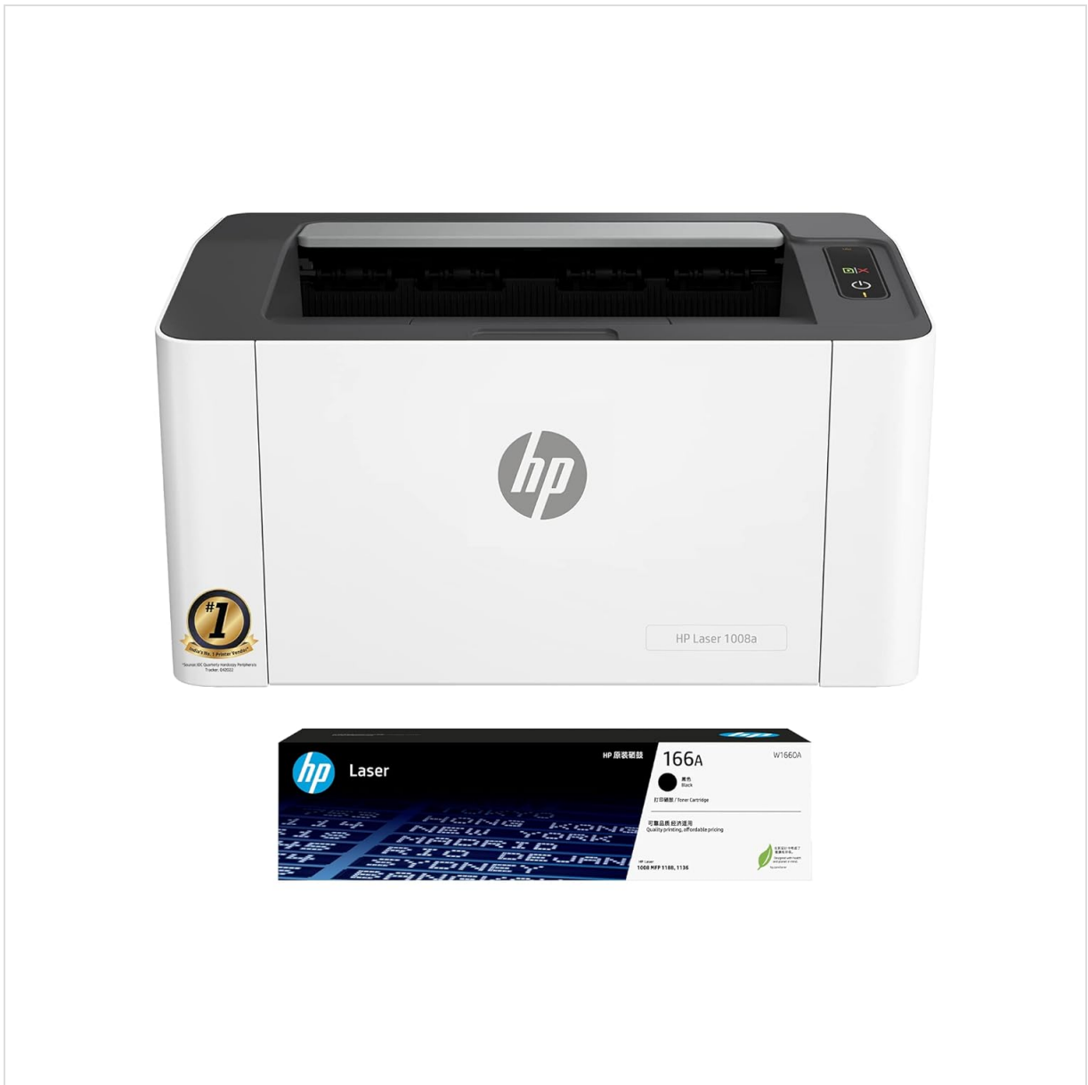
Image: The HP Laser 1008a printer, a compact white and black device, shown with its accompanying toner cartridge box.