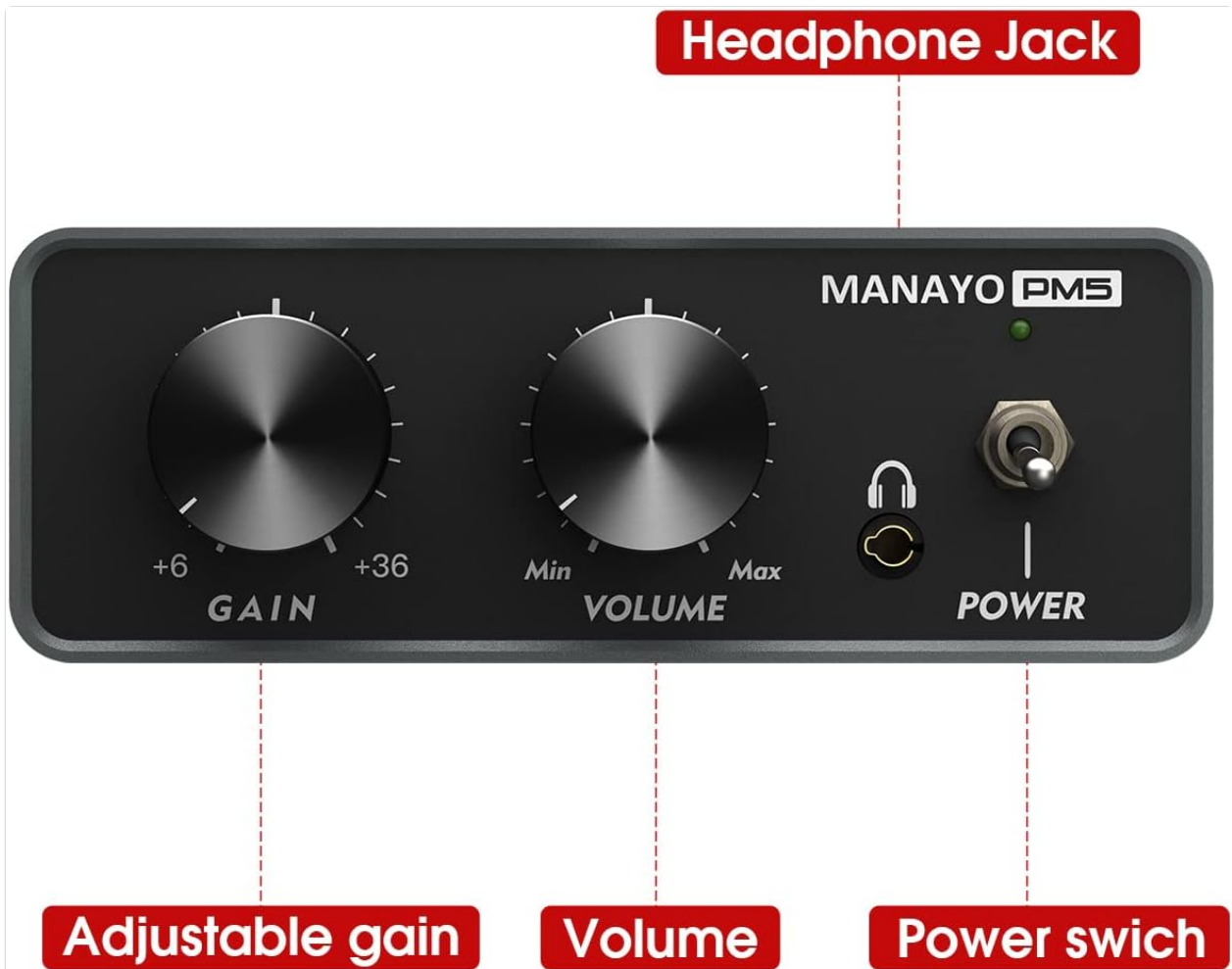
Figure 1: Front view of the MANAYO PM5 Phono Preamp, highlighting the Gain knob, Volume knob, Headphone Jack, and Power switch.