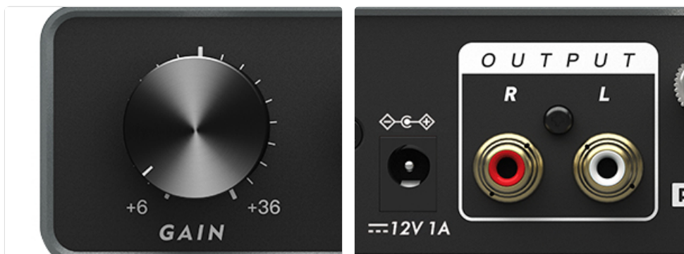
Figure 4: Detailed views of the Gain and Volume control knobs.

Video 2: Official MANAYO video demonstrating the use of the gain and volume controls, and headphone connection. This video illustrates how to fine-tune your audio output.