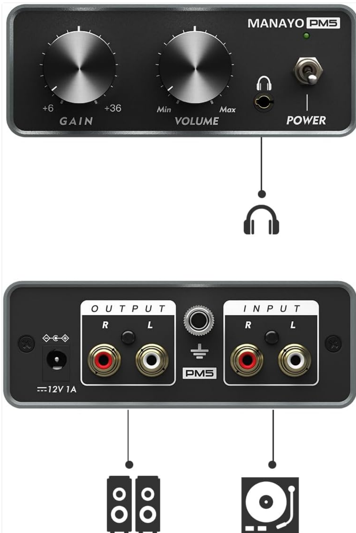
Figure 3: Connection diagram for the MANAYO PM5 Phono Preamp with a turntable and speakers.

Video 1: Official MANAYO video demonstrating the setup and connection of the phono preamp to a turntable and speakers. This video provides a visual guide to the connection process.