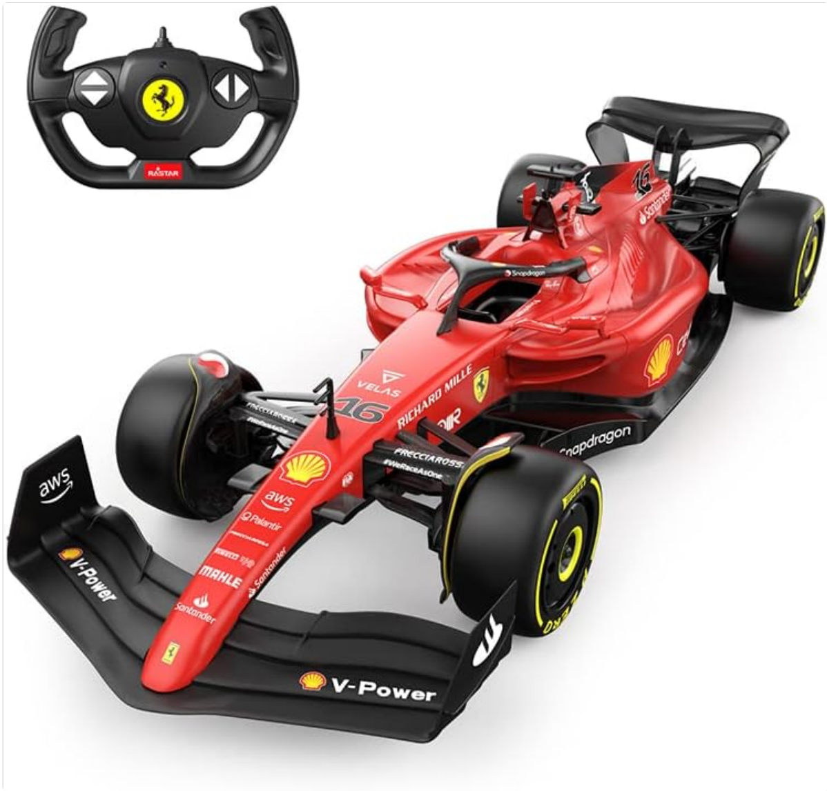
Image: The RASTAR 1:12 Ferrari F1-75 Remote Control Car, showcasing its detailed design and the included steering wheel remote controller.