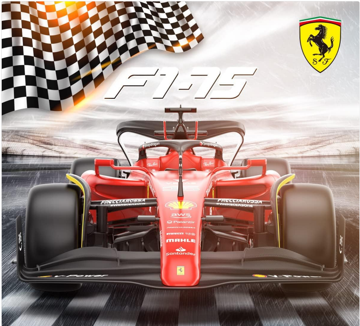
Image: A dynamic front view of the RASTAR Ferrari F1-75 Remote Control Car, highlighting its authentic F1-75 design.

The car can reach speeds of up to 5 mph (8.2 km/h). Its design incorporates a rear power motor with high intensity magnetic force and a differential mechanism for smooth operation and responsive handling.