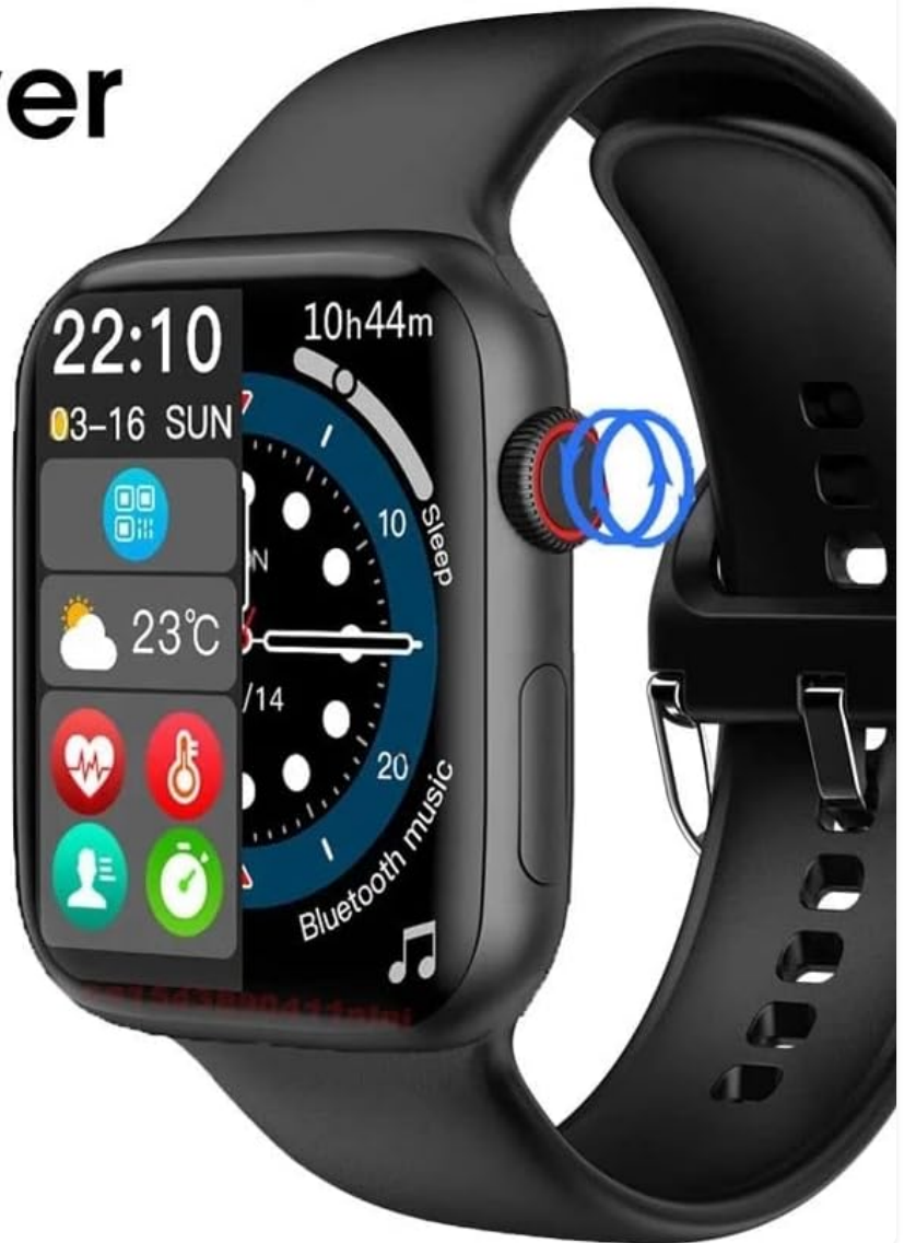
Figure 3.1: Smartwatch with visible scroll crown and menu interface.