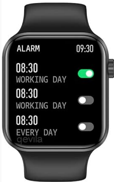
Alarm clock Customizable

Wear a wonderful smart life on your wrist.