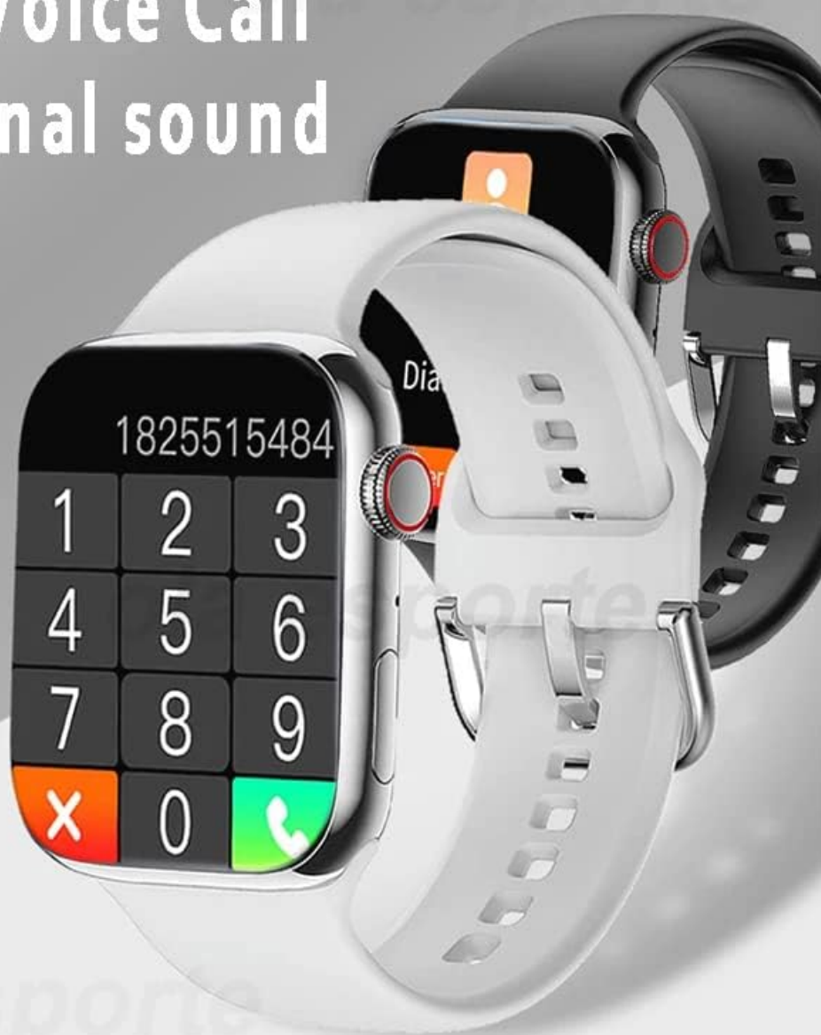
Figure 6.1: Smart Voice Call feature with HD original sound.