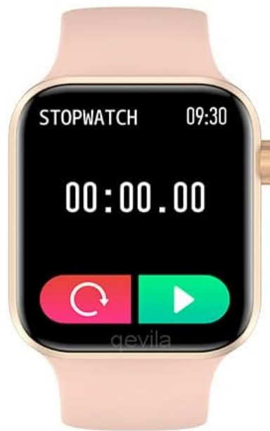
Stopwatch data is accurate