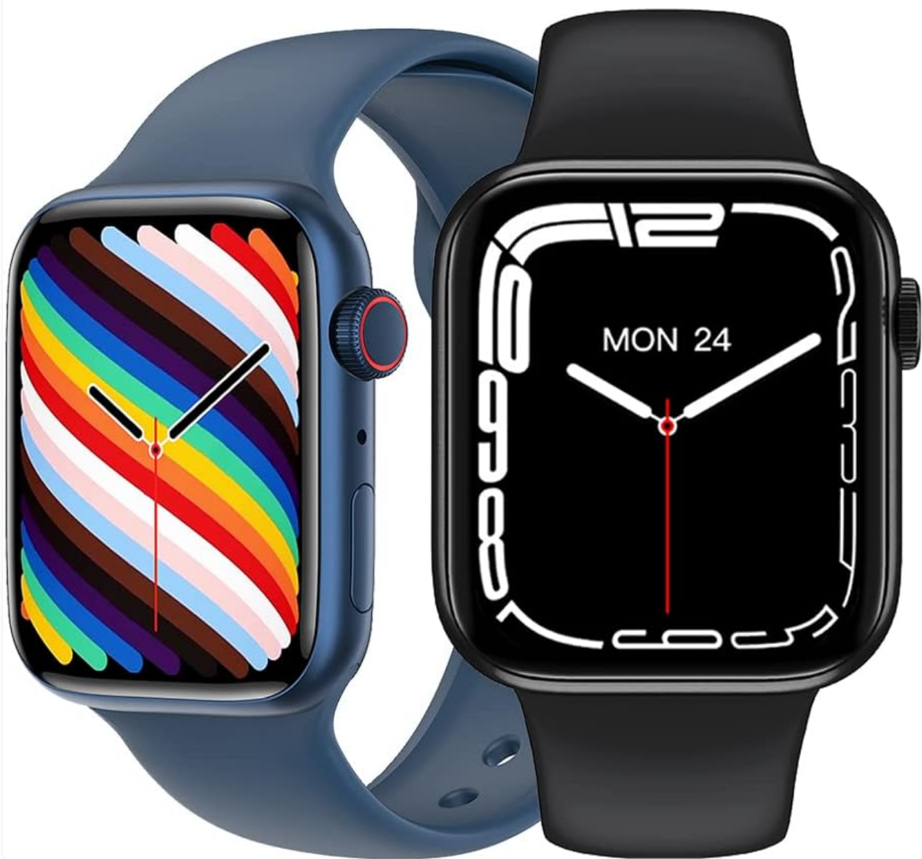
Figure 7.1: The T900 Pro Max L Series 8 Smartwatch in different colors, highlighting strap versatility.