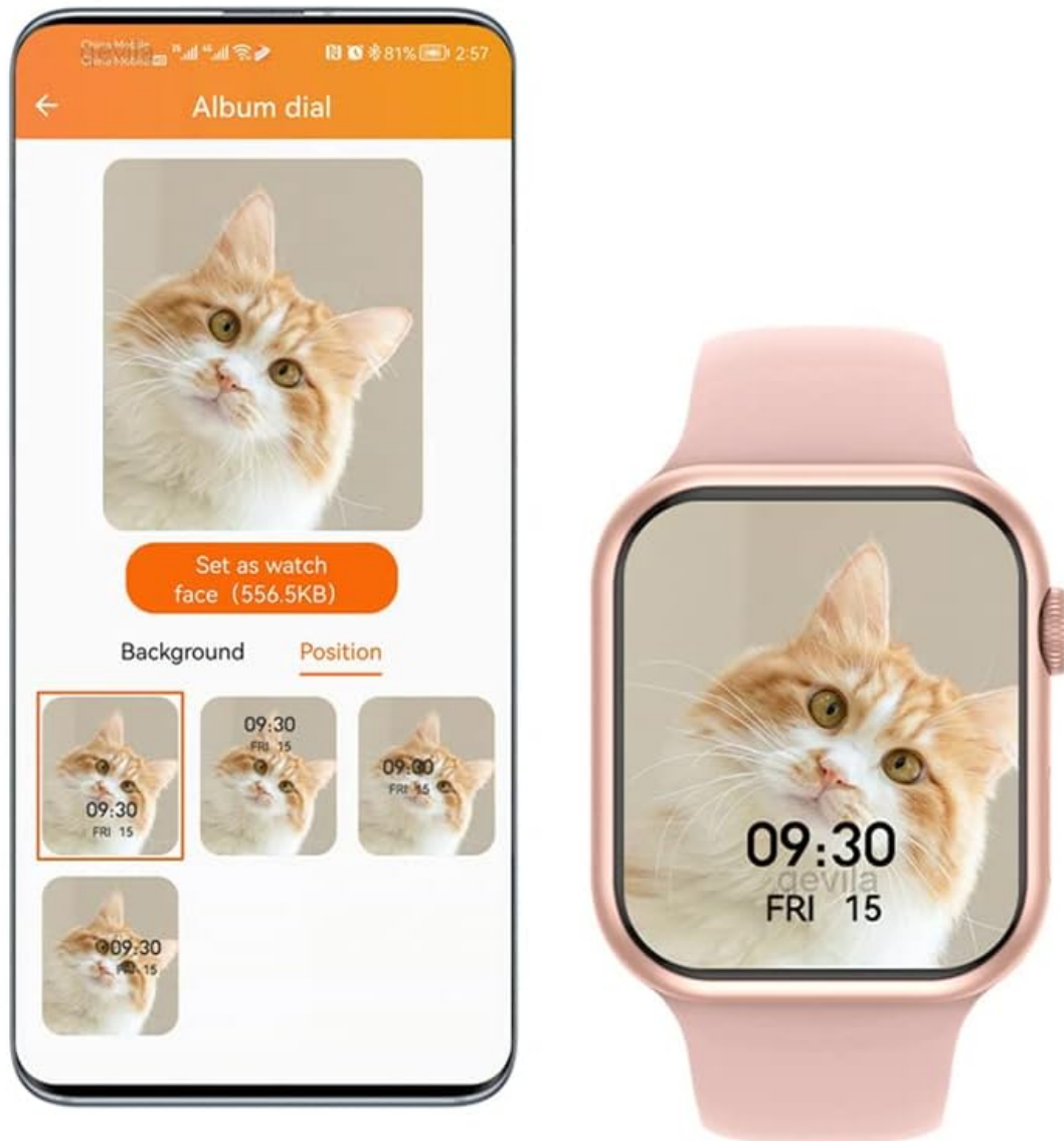
Figure 6.5: Customizing your watch face.

Choose one of your favorite photo, select the component style, and change the component position to form your devila and exclusive watch face.