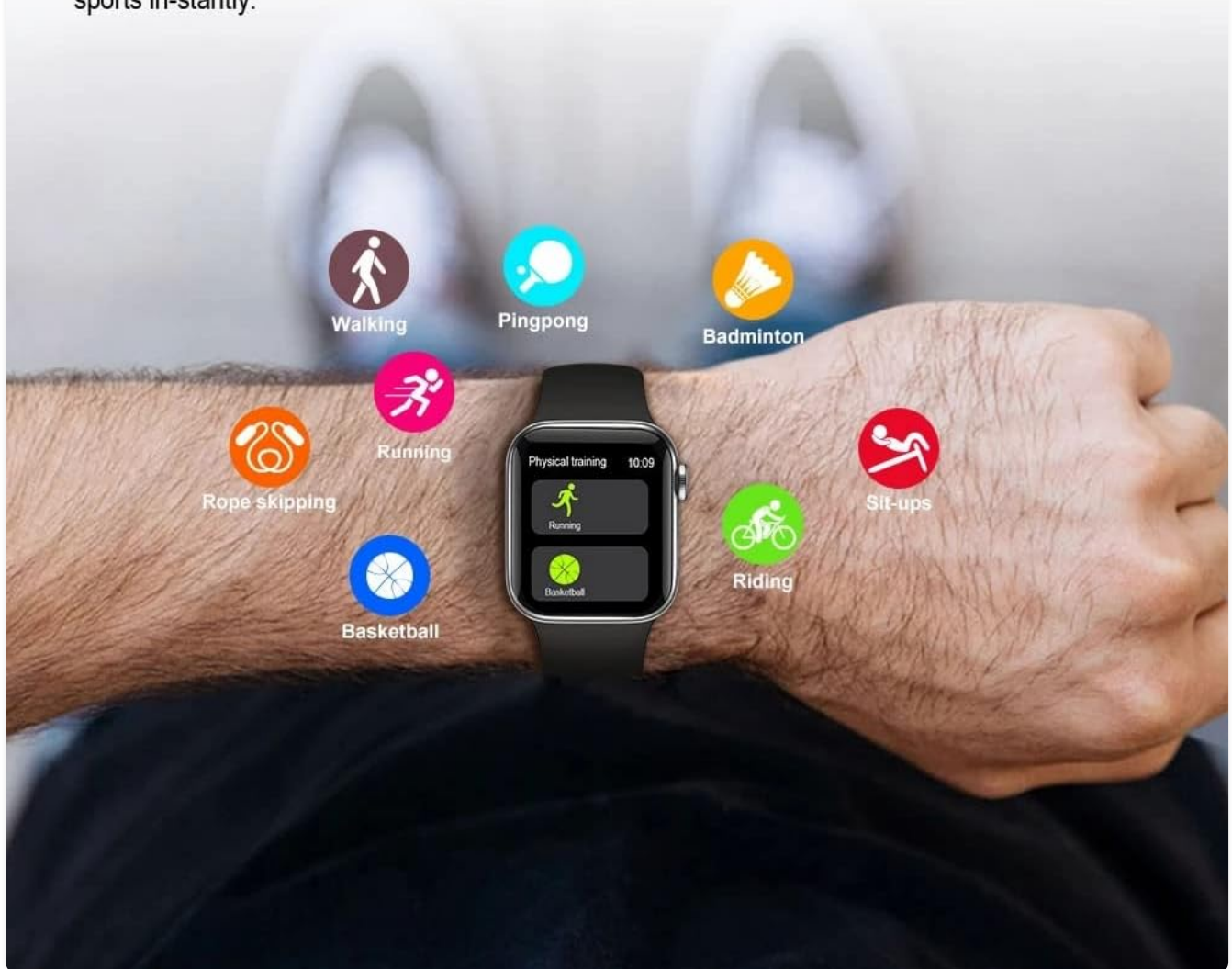
Figure 6.3: Fitness tracking modes for various activities.

Equipped with motion sensors,intelligent calculation of movement,walking distance, efficient and scientific guidance of exercise,to maximize the movement effect; support a variety of motion modes.Meet different sports needs,let you fall in love with sports in-stantly.