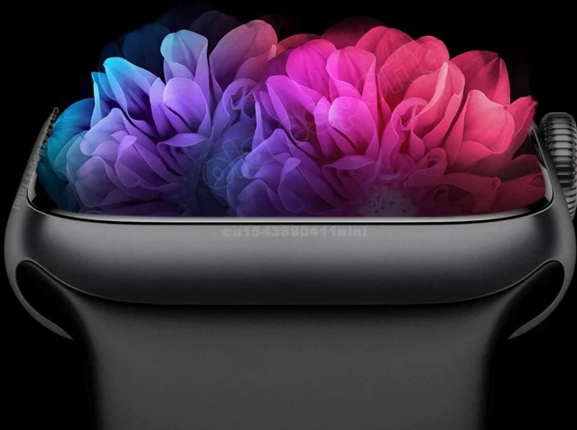
Figure 3.2: The 1.92-inch HD display of the smartwatch.