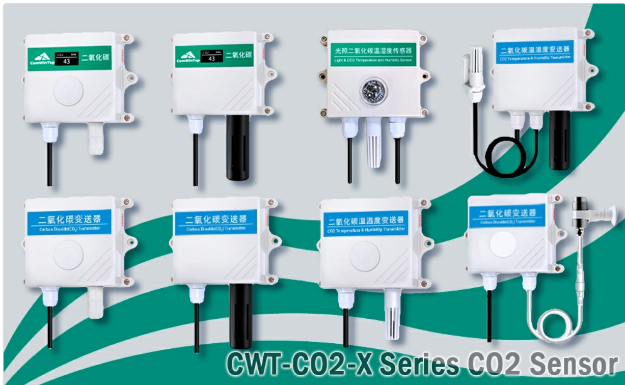
Image: The ArecaloT CO2 Sensor, part of the CWT-602 X Series, featuring an internal CO2 probe with OLED display and RS485 output.

This manual provides detailed instructions for the installation, operation, maintenance, and troubleshooting of the ArecaloT CO2 Sensor, Model CO2-15-10K-INS-D. This high-precision carbon dioxide transmitter is designed for agricultural greenhouses and industrial applications, featuring RS485 output and an integrated display for real-time CO2 monitoring.