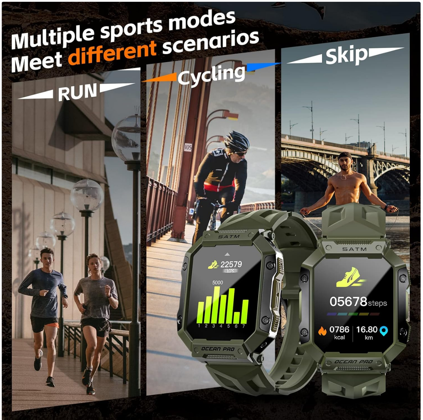
Figure 4.2: The smartwatch tracking different sports activities, displaying real-time metrics.