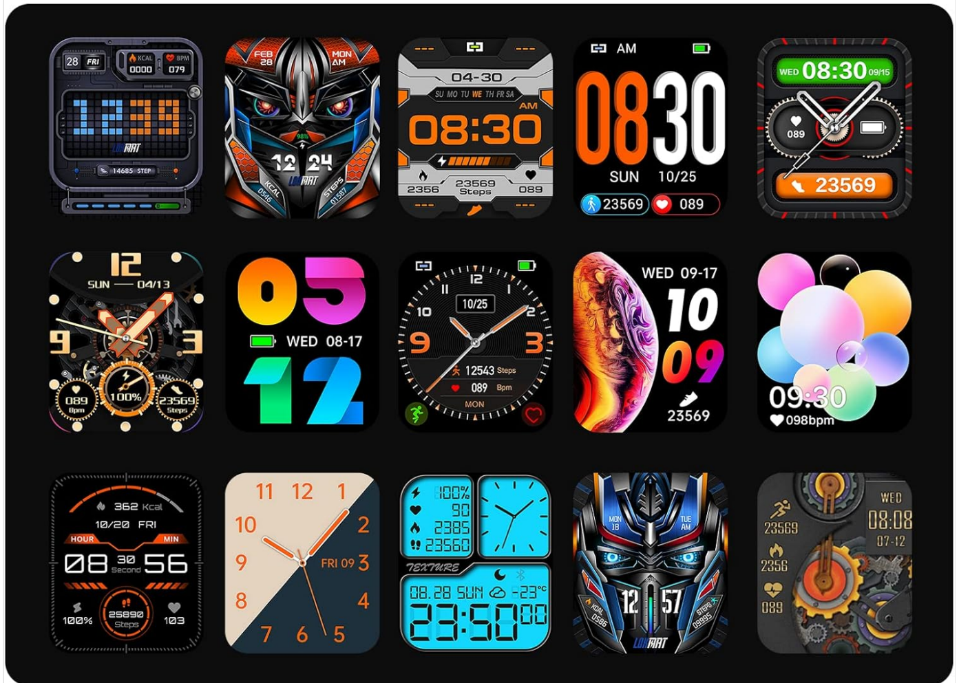
Figure 4.5: A selection of diverse and customizable watch faces to personalize your device.

The fashionable square screen dial carries more information. You can switch between different styles. You can also choose your favorite photos, DIV your exclusive watch face.