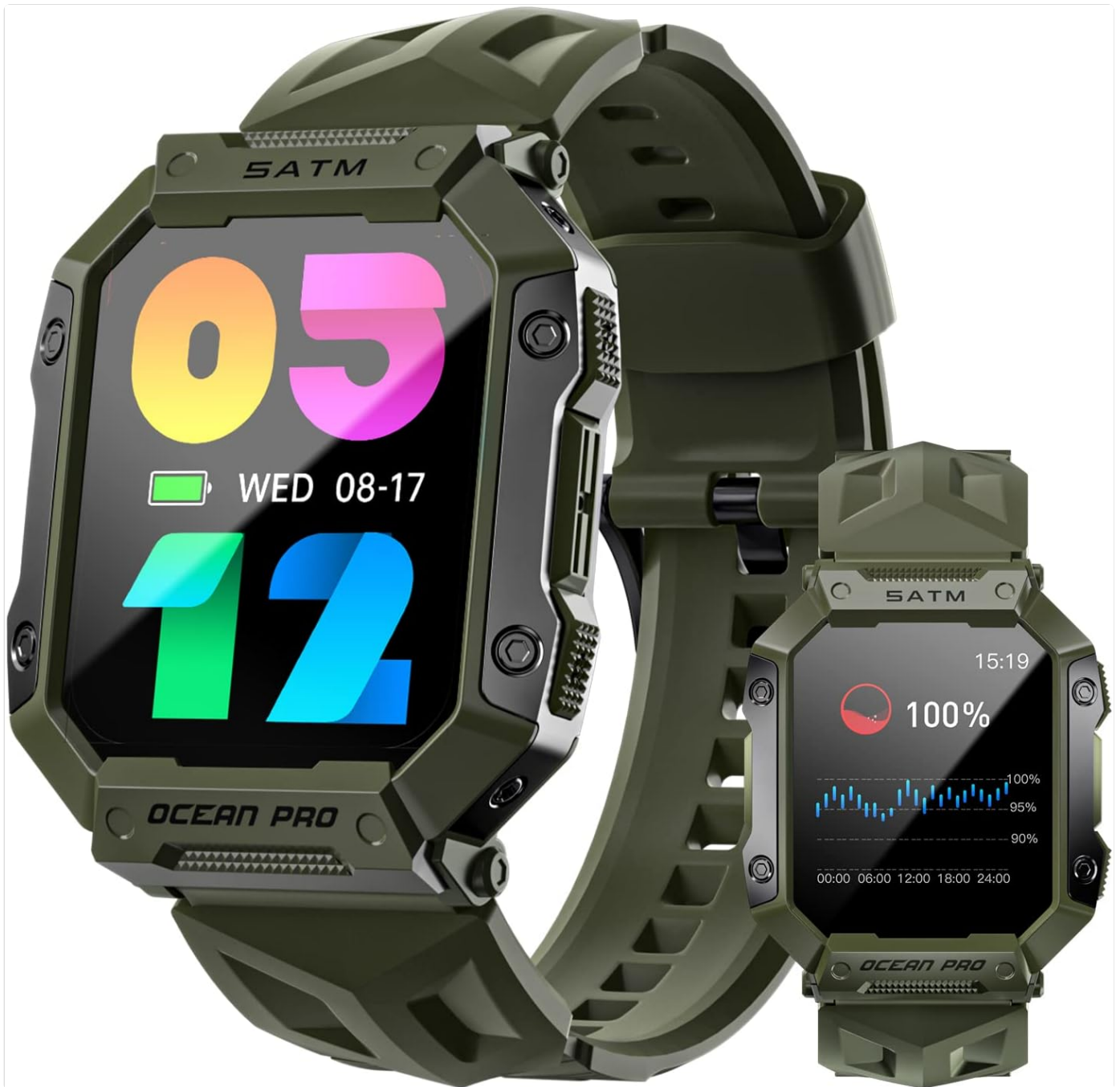
Figure 1.1: The LOKMAT Smart Watch, showcasing its rugged design and digital display.