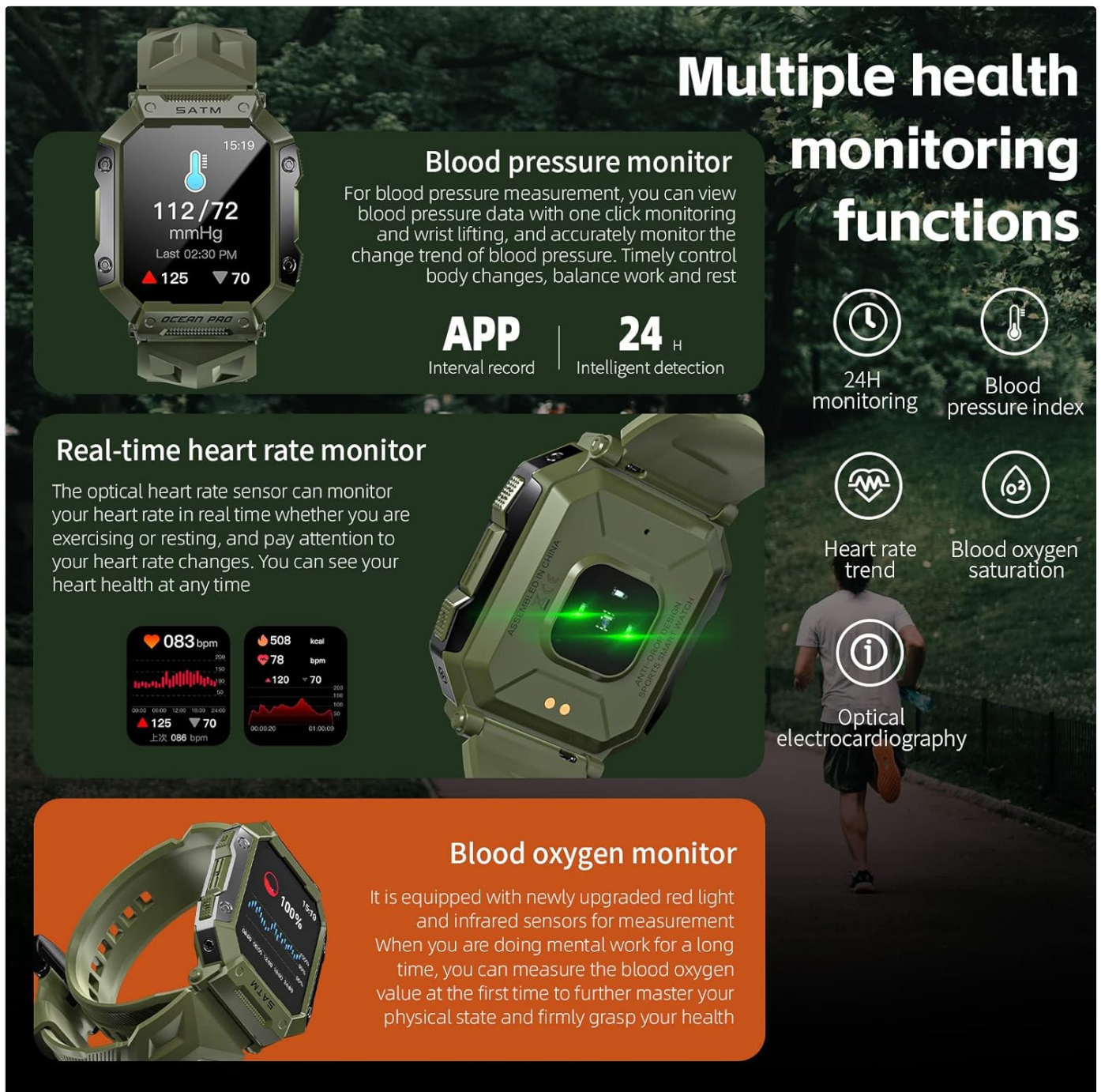
Figure 4.3: Detailed view of the watch's health monitoring capabilities, including heart rate, blood pressure, and blood oxygen.