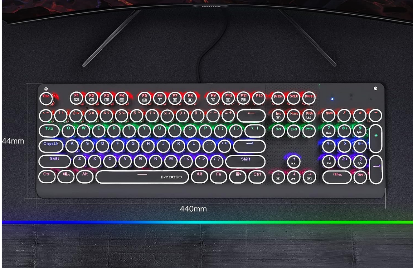
Figure 1: The E-YOOSO K600 keyboard showcasing its compact design and overall layout with dimensions. This design helps save desk space while maintaining full functionality.

on your desk without sacrificing performance and comfort during your gaming sessions