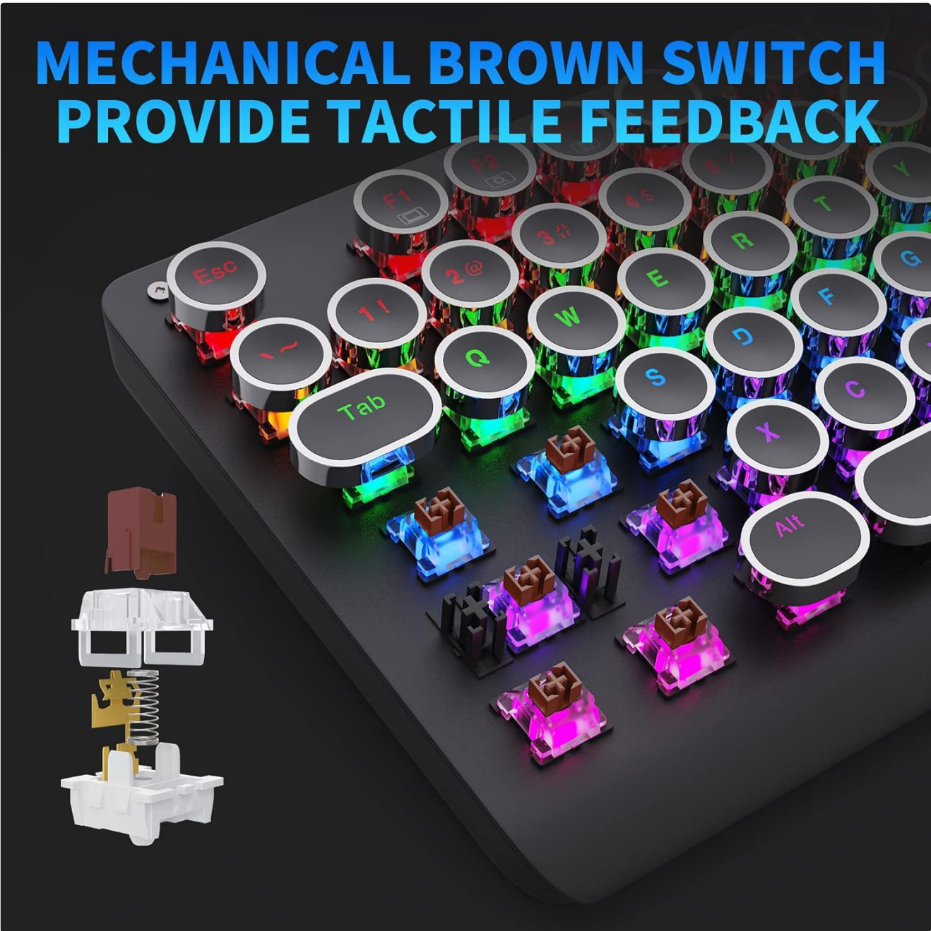
Figure 2: A detailed view of the mechanical brown switches used in the E-YOOSO K600 keyboard, illustrating their internal structure and tactile design.