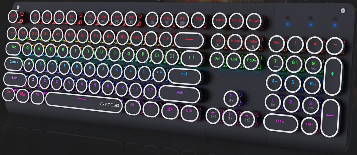
Figure 4: The E-YOOSO K600 keyboard highlighting the FN+INS key combination for cycling through the 9 LED backlight modes.