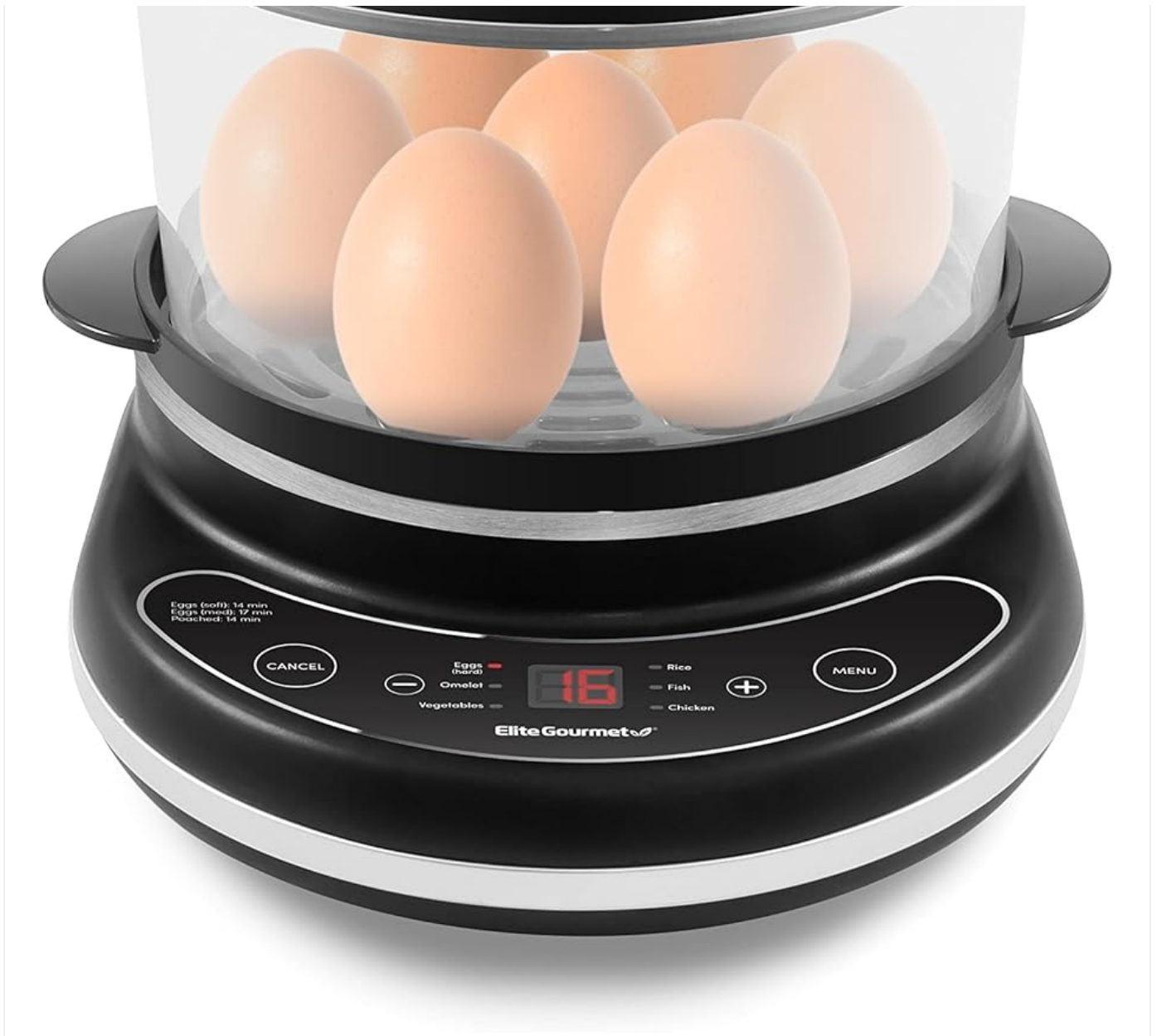
The Elite Gourmet EGC314CB Digital Easy Egg Cooker, showcasing its two-tier design and capacity for multiple eggs.