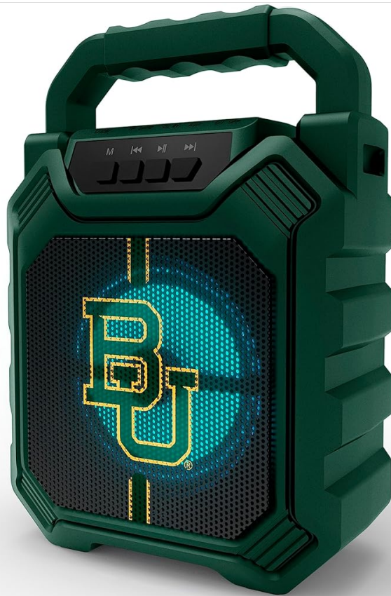
Image: Angled view of the SOAR NCAA XL Shockbox Wireless Bluetooth Speaker, highlighting its robust design, top handle, and illuminated Baylor Bears logo on the speaker grille.