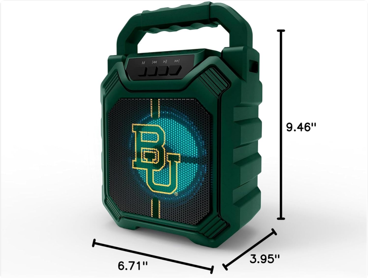
Image: Diagram showing the dimensions of the SOAR NCAA XL Shockbox Wireless Bluetooth Speaker: 9.46 inches (height), 6.71 inches (width), and 3.95 inches (depth).