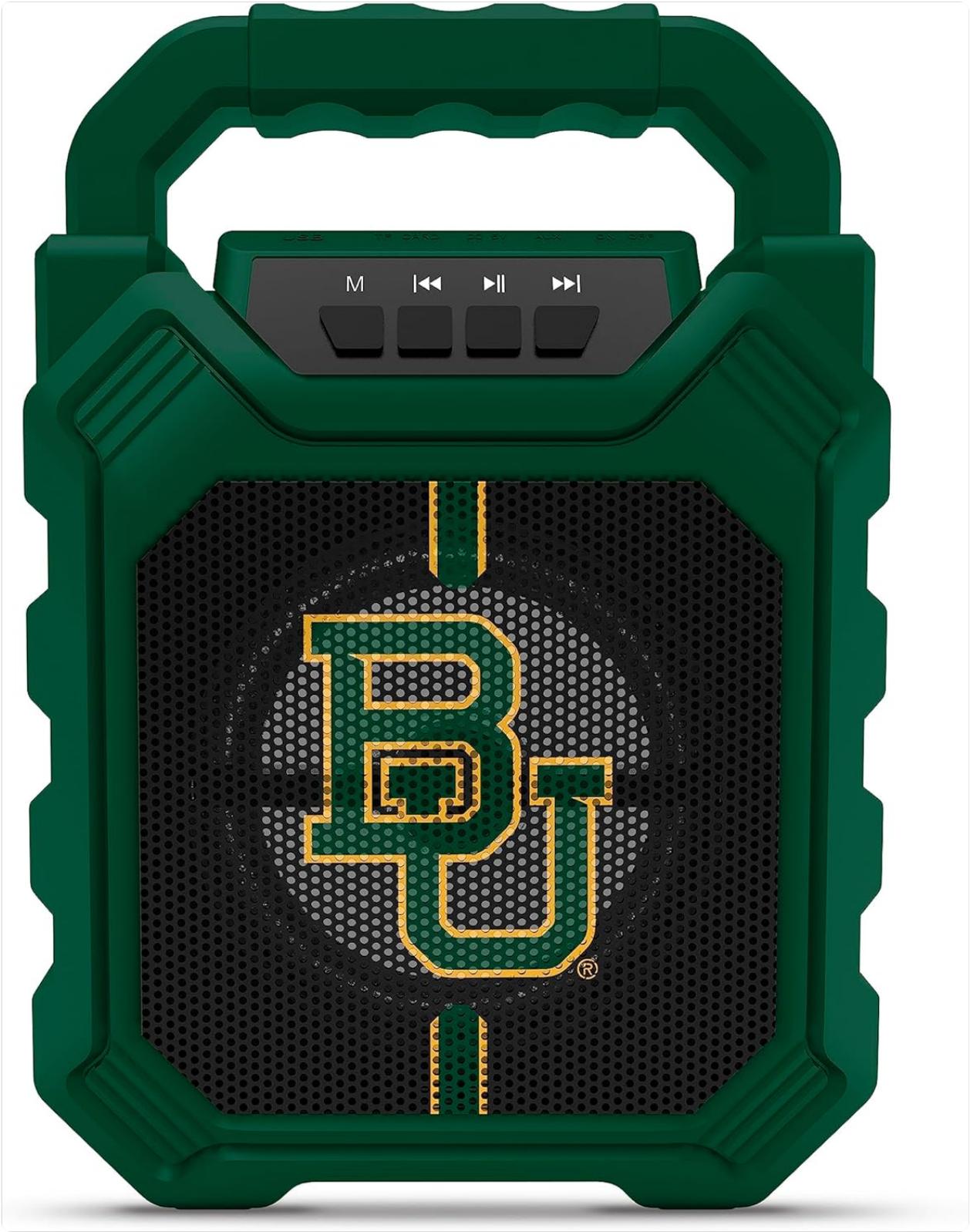
Image: Front view of the SOAR NCAA XL Shockbox Wireless Bluetooth Speaker, showcasing the speaker grille with the Baylor Bears logo and the control panel at the top.

Familiarize yourself with the various parts and controls of your SOAR Shockbox XL speaker.