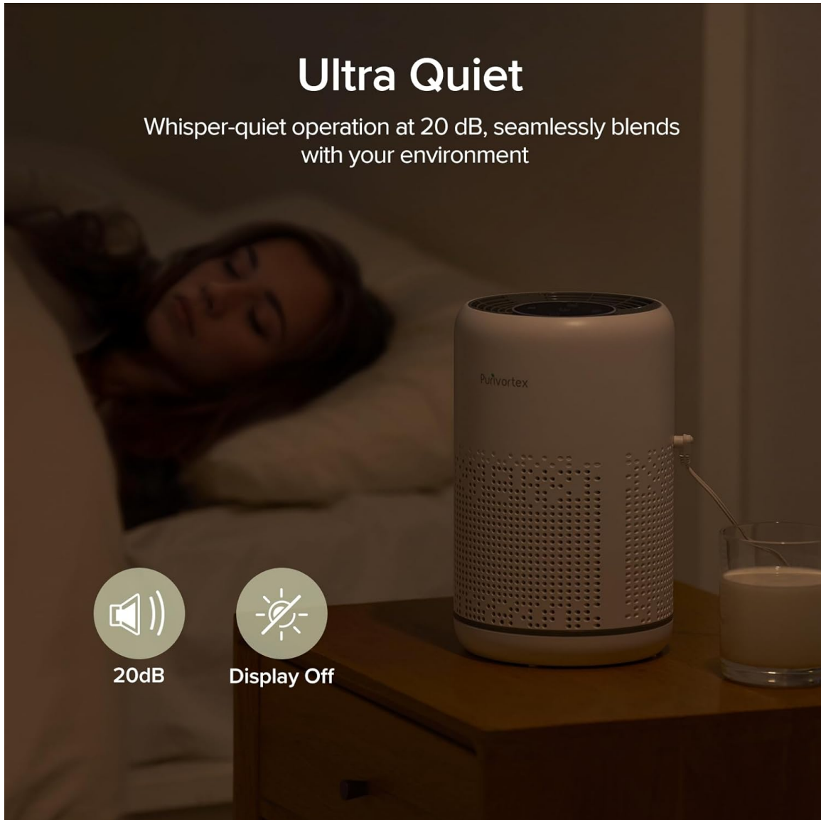
Image: Air purifier in sleep mode with display off.

Press the Fan Speed button (fan icon) to cycle through different fan speeds: Low, Medium, High, and Silent (SL) mode. Silent mode operates at a whisper-quiet 20dB.