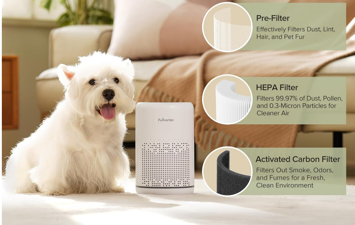
Image: Multi-Layer Filtration System components.

3-Stage Filtration for Fresh and Healthy Space