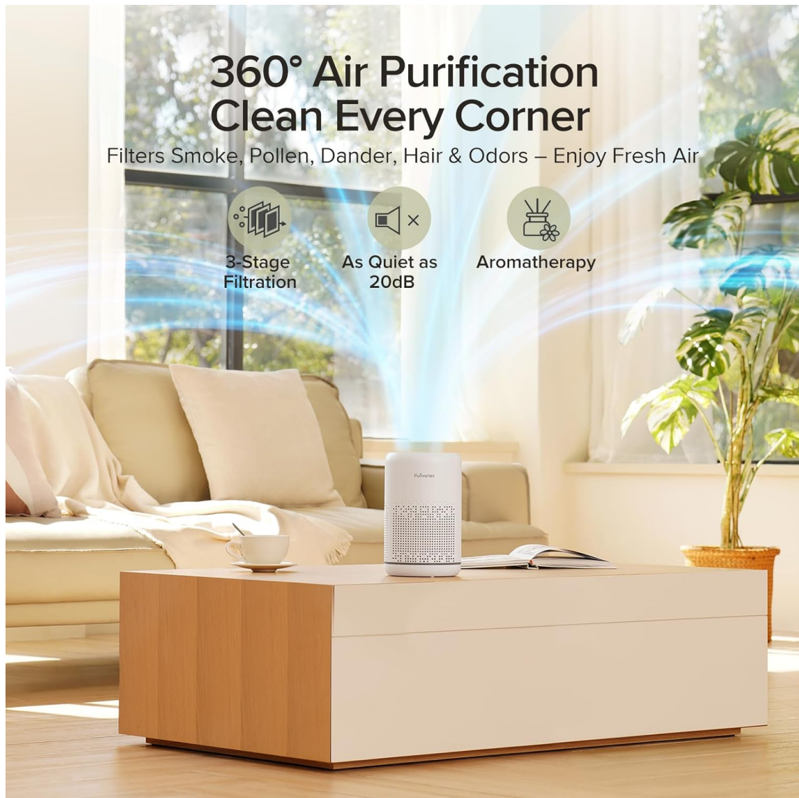
Image: Purivortex AC300 in a living room, showcasing key features.