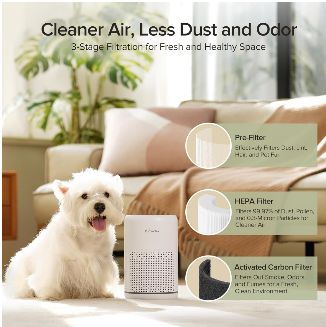
Image: Multi-Layer Filtration System components.