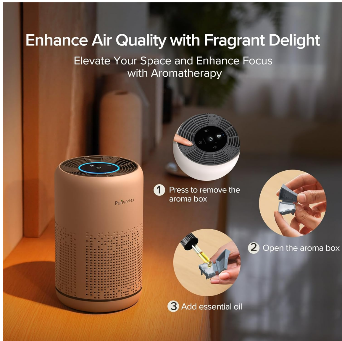
Image: Instructions for using the fragrance sponge.