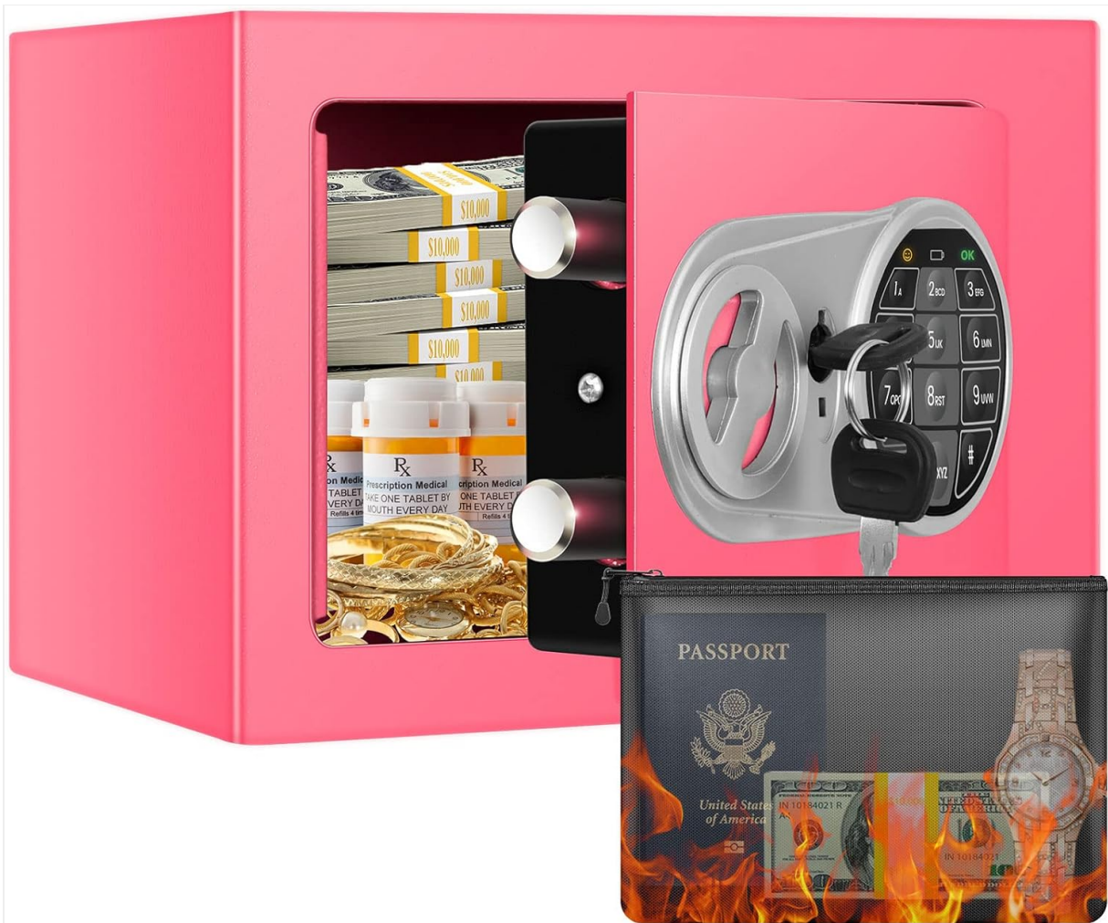
Image: The Thmosz Small Safe Box with its door open, revealing the interior storage space and the digital keypad on the inside of the door. This image illustrates the overall appearance and internal layout of the safe.