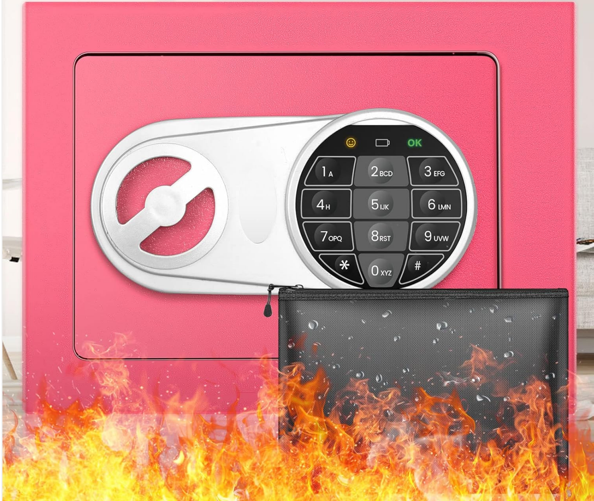
Image: The Thmosz Small Safe Box is shown alongside its fireproof money bag, with visual elements suggesting fire resistance. This highlights the added protection for documents and valuables against fire.