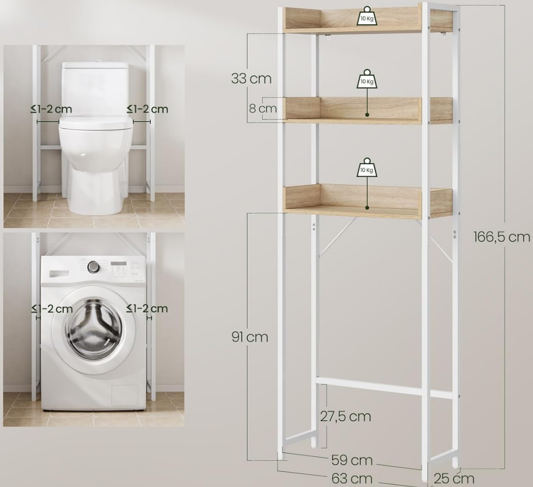
Image 4.1: Detailed dimensions of the storage shelf, including recommended clearance for appliances.

Pour faciliter l'installation et l'entretien, la dimension recommandée de la machine à laver doit être inférieure de 1 à 2 cm à la dimension de l'espace libre.