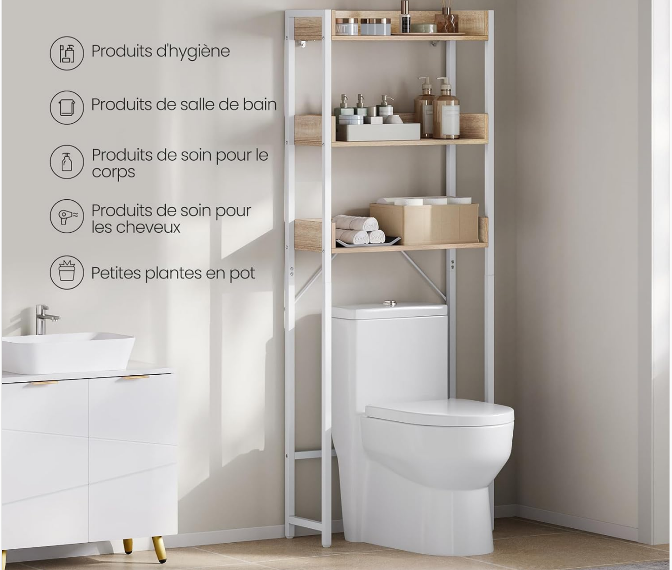
Image 5.1: The storage shelf positioned over a toilet, demonstrating its space-saving capability.