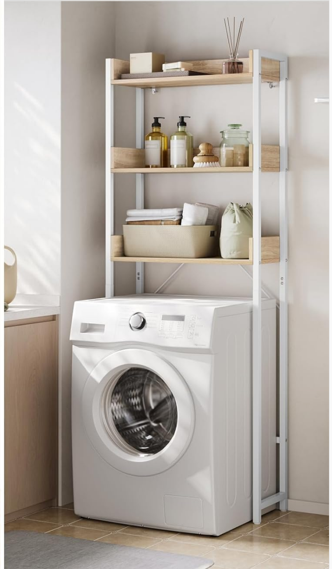
Image 5.2: Comparison showing the shelf's versatility for both over-toilet and over-washing machine placement.