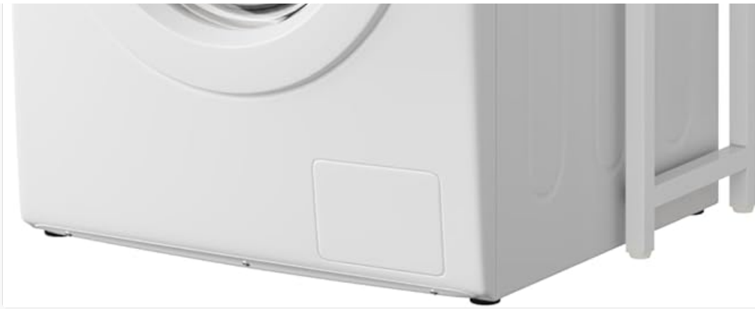
Image 2.1: The EUGAD 3-tier storage shelf, showcasing its design and functionality over a washing machine.