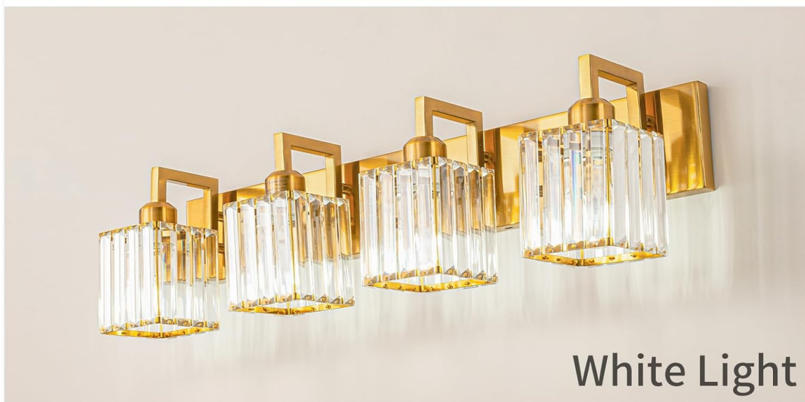
Figure 5: This image illustrates the difference between warm light and white light when different bulb types are used in the fixture.