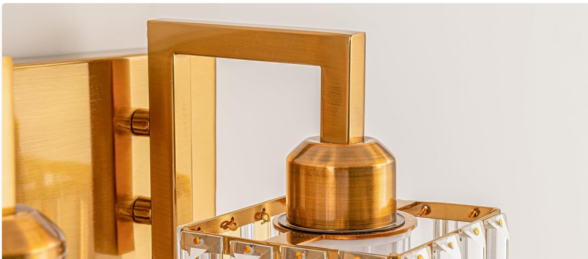
Electroplating hardware accessories