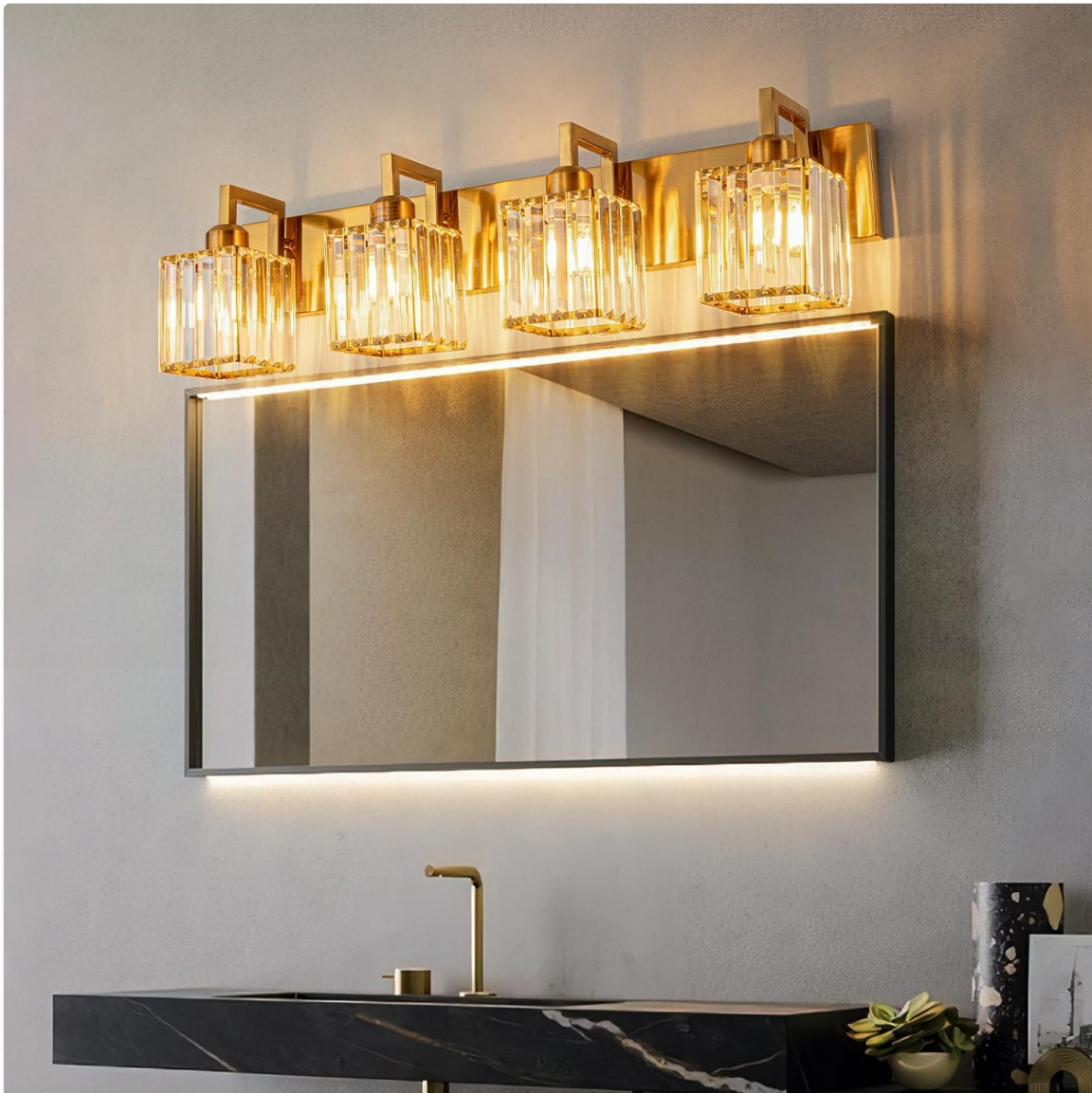
Figure 1: The FDPBY Modern Crystal Bathroom Vanity Light installed above a mirror, showcasing its elegant design and illumination.