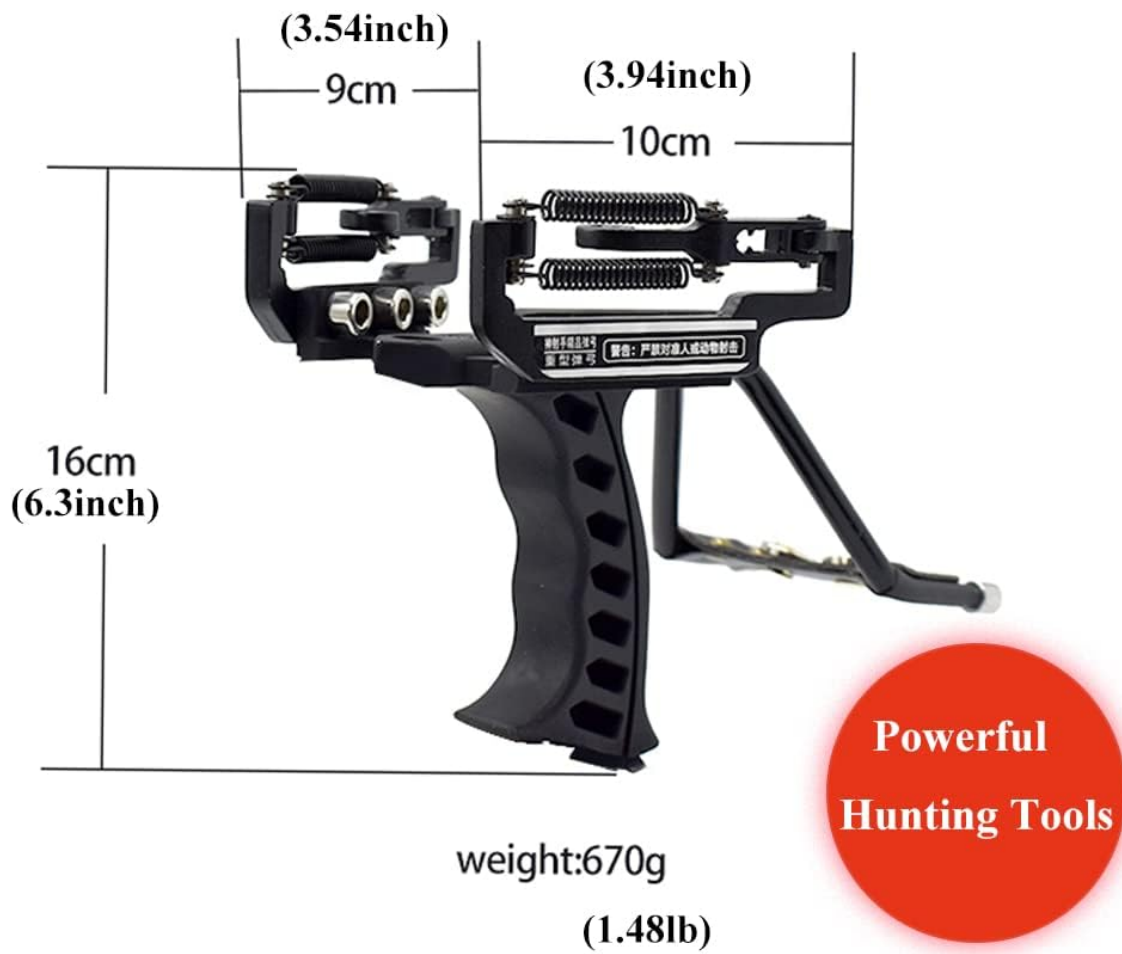
Figure 7: Detailed dimensions and weight of the Piaoyu Professional Hunting Slingshot.