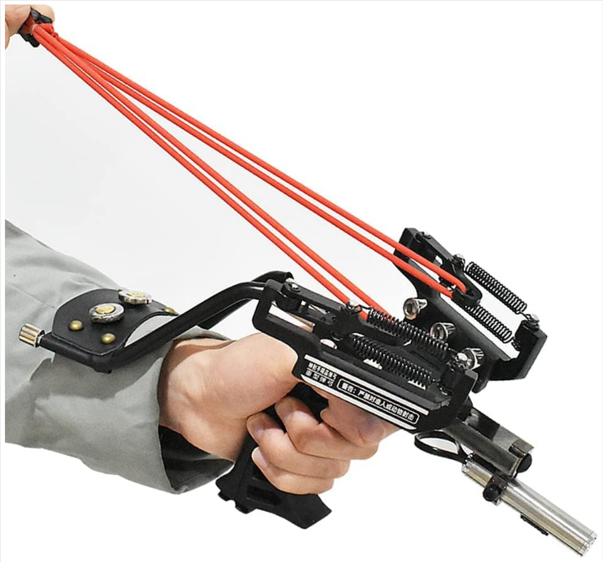
Figure 4: Proper grip and use of the wrist brace, highlighting the magnetic cups for ammunition storage.