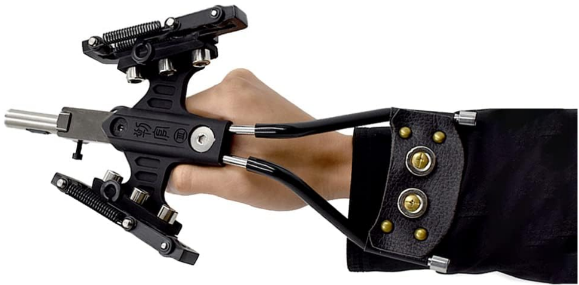
Figure 2: The laser sight and flashlight module can be attached to the slingshot for enhanced targeting.