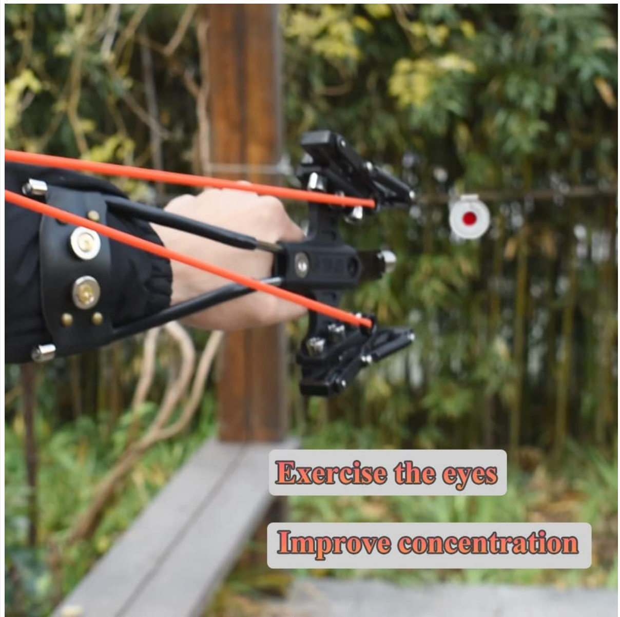
Figure 5: Demonstrates the aiming process, emphasizing the importance of a steady hold and consistent draw.

The Piaoyu slingshot can also be adapted for fishing and archery with additional accessories (sold separately).