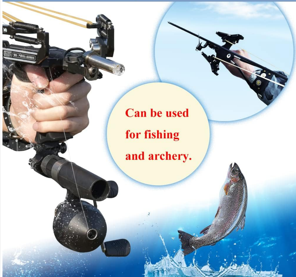
Figure 6: The slingshot's versatility, showing configurations for fishing and archery.