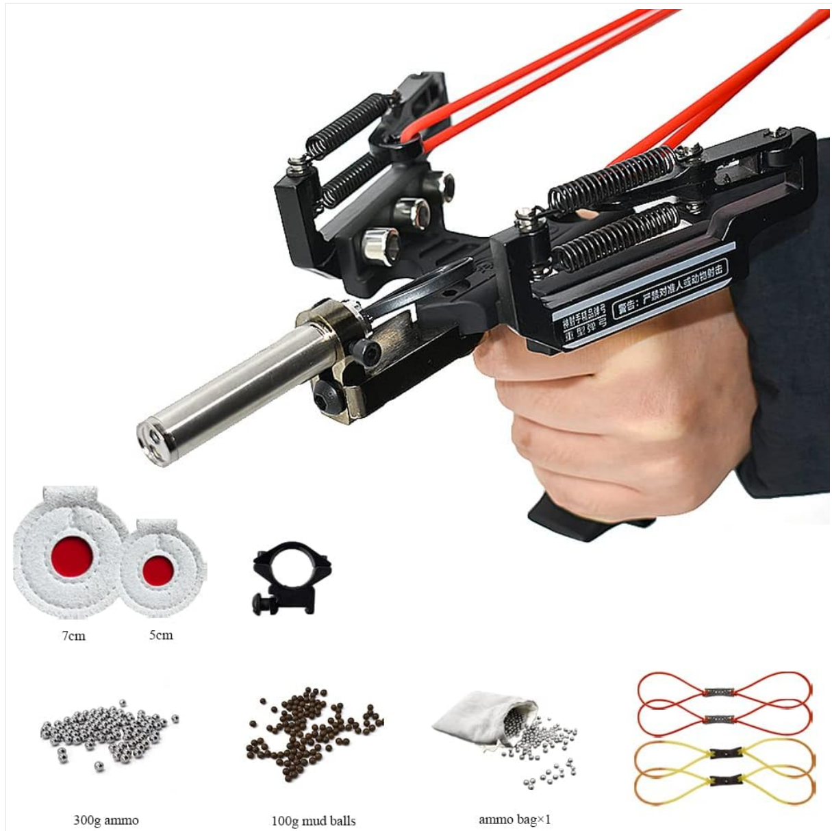
Figure 1: Main product image showing the slingshot and its accessories, including rubber bands, ammunition, and targets.