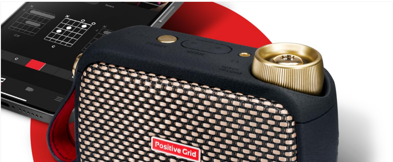
Image: A screenshot of the Spark GO app interface demonstrating the auto-accompaniment feature, where the app generates drum and bass parts to match the user's guitar playing. This highlights a key smart feature for practice.