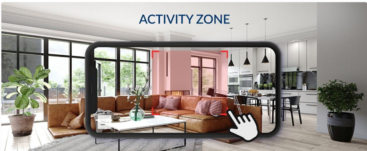
Image: Visual representation of activity detection and alerts.