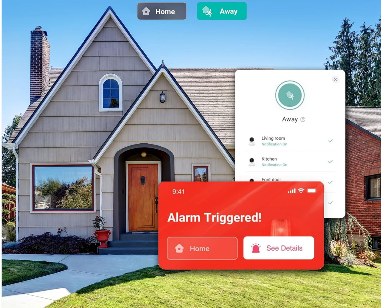
Image: Customizing Home and Away modes.

Customize the selection of devices, only receive what you concern.