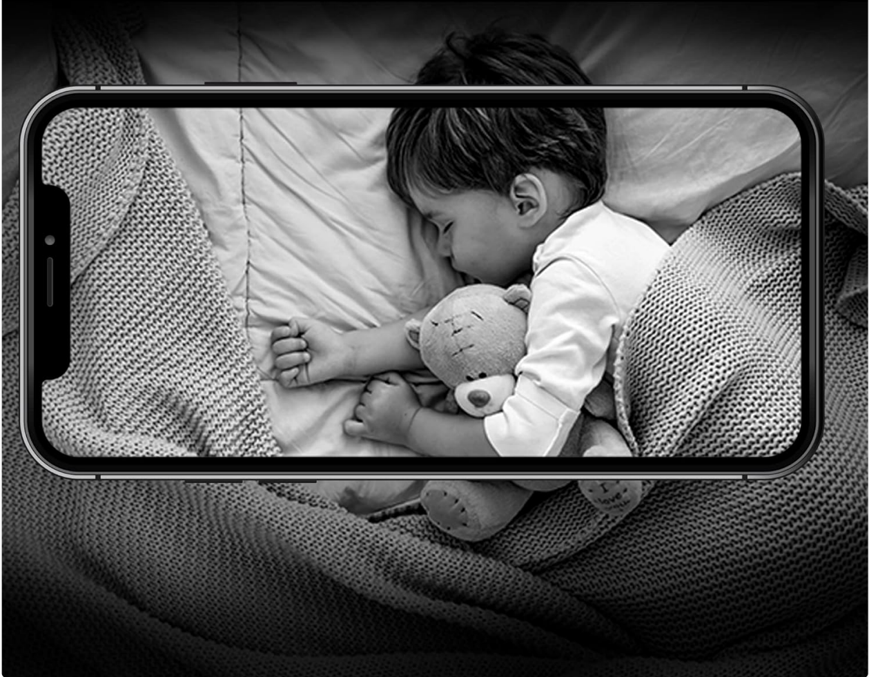
Image: Enhanced night vision capturing a clear image in darkness.

See clearly up to 15m, no matter how dark it gets.