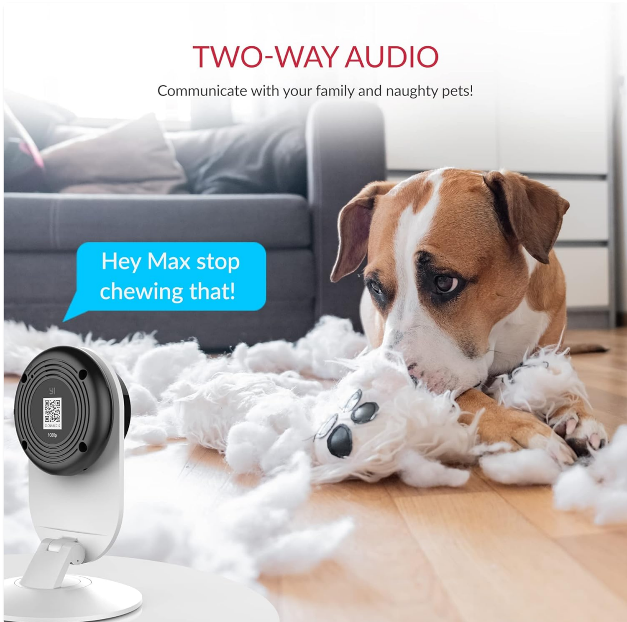
Image: Demonstrating two-way audio communication.