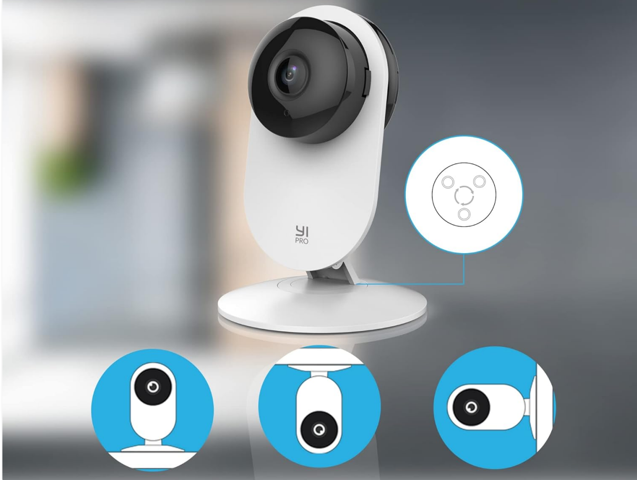
Image: Various mounting possibilities for the camera.

The solid 3-hole base makes it easy to place it wherever you want.