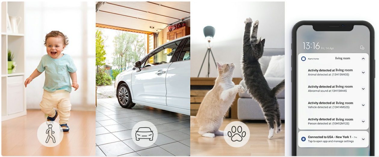
Image: Quick setup guide for the YI Home Camera.