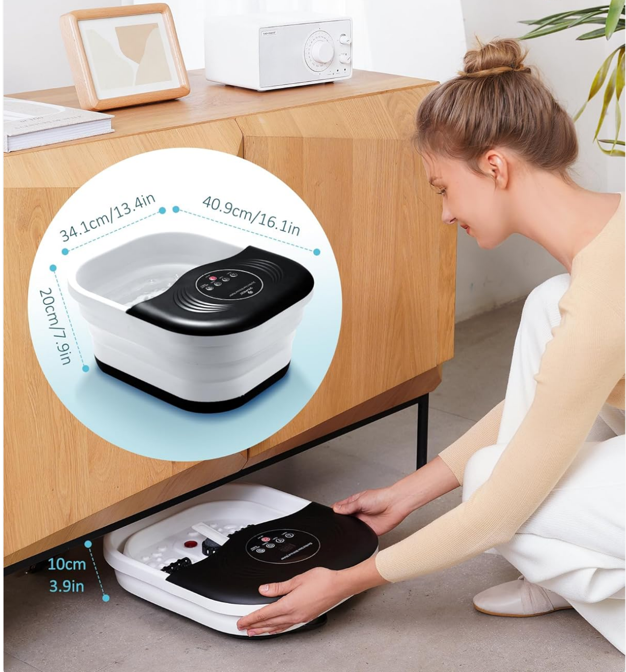
Image 7: The foot spa collapses to a compact size for easy storage.

3.9 inches tall can easily be stowed under a table or sofa