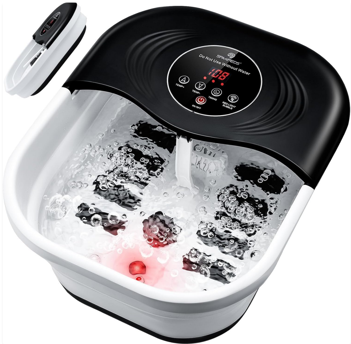
Image 1: The SPA4PIEDS Collapsible Foot Spa in operation, showing bubbles, red light, and the control panel.