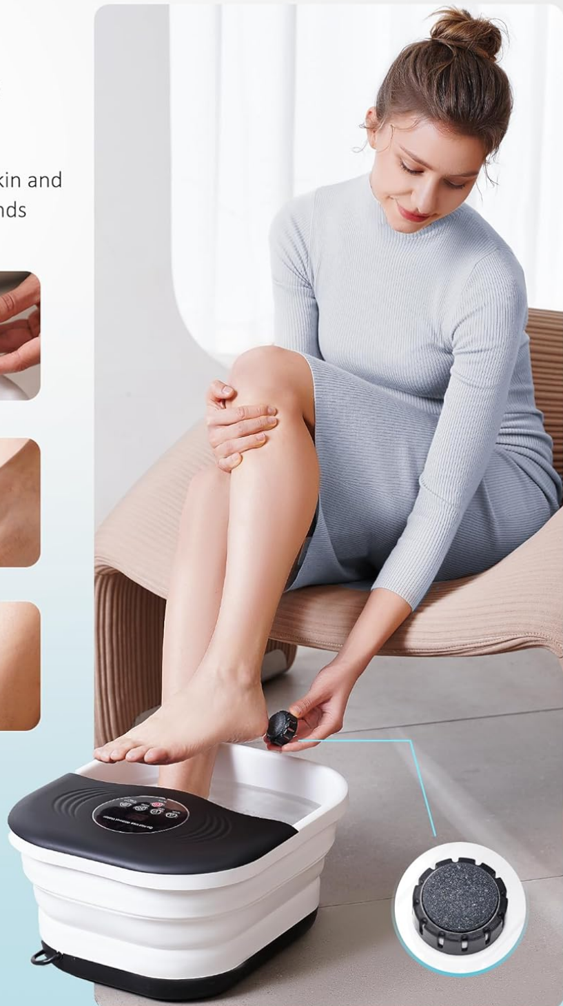
Image 6: The included pumice stone can be used for exfoliation on various parts of the foot.

Your browser does not support the video tag.