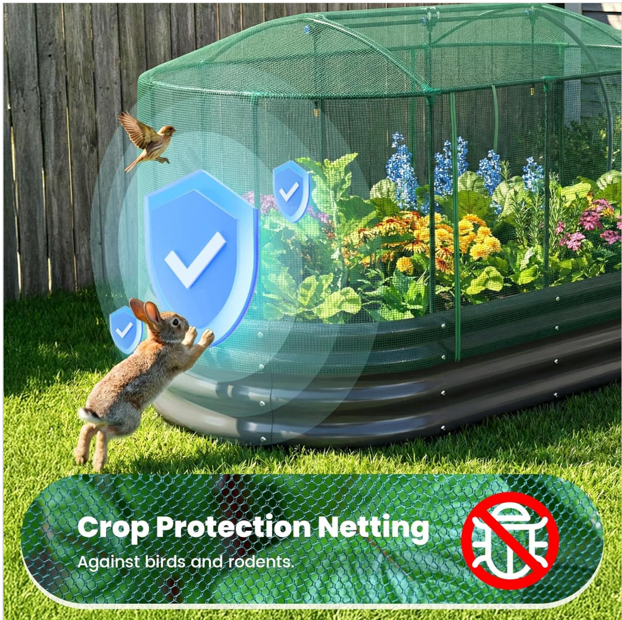
Image: The mesh cover effectively protects plants from birds and small animals.