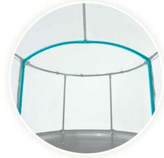
Image: Illustration of multi-connectors used to build the strong frame for the mesh cover.