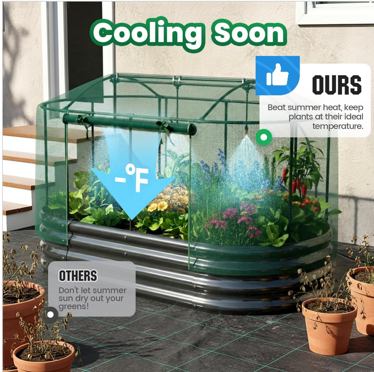
Image: The misting system provides a cooling effect, helping to maintain optimal plant temperatures.

pattern and coverage for your plants. The misting function helps cool plants during hot weather and increases humidity.