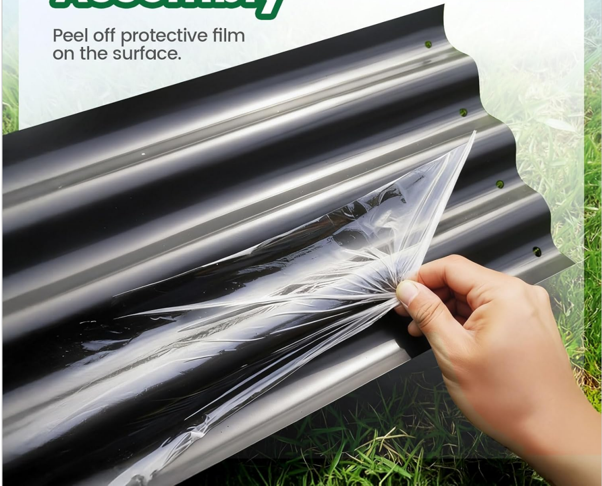
Image: Protective film being removed from a metal panel before assembly.