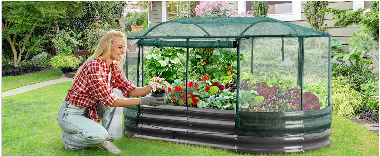
Image: The arched frame design, maximizing interior space for plants.

Image: Illustration of multi-connectors used to build the strong frame for the mesh cover.