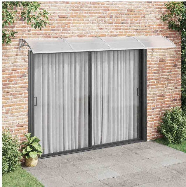
Image: Example of a vidaXL door canopy installed above a sliding glass door.

Choose a suitable location above your door or window. Ensure the wall surface is clean, flat, and capable of supporting the canopy. Mark the desired height and width for installation.