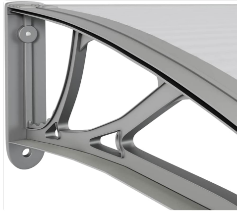
Image: Detail of an ABS bracket showing the pre-drilled mounting holes.

Hold the assembled canopy against the wall at the desired installation height. Use a level to ensure it is straight. Mark the drilling points through the holes in the ABS brackets onto the wall.