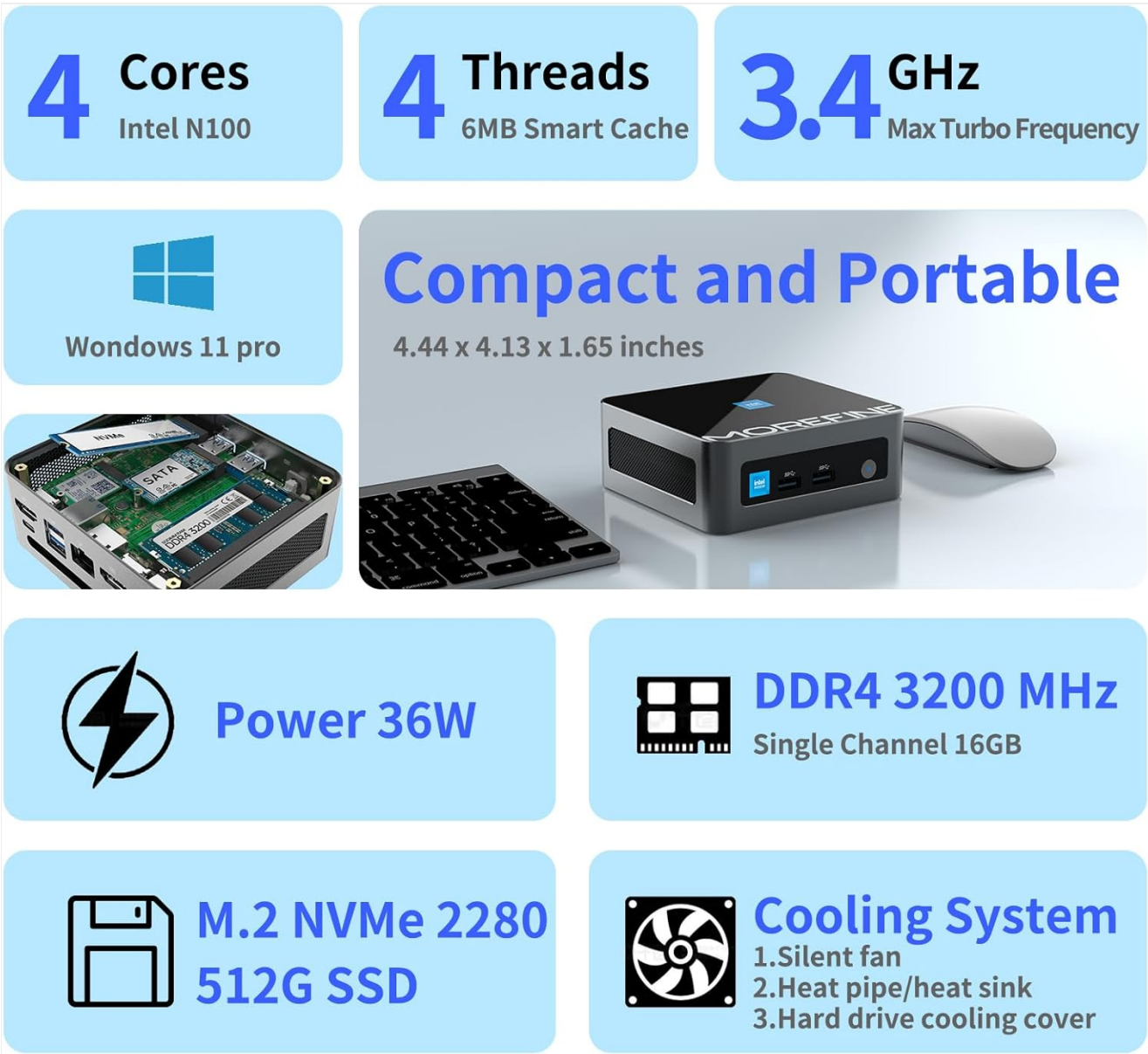
Image: Infographic detailing key features such as processor, RAM, storage, power, and cooling system.

Below are the key technical specifications of the MOREFINE M9 Mini PC: