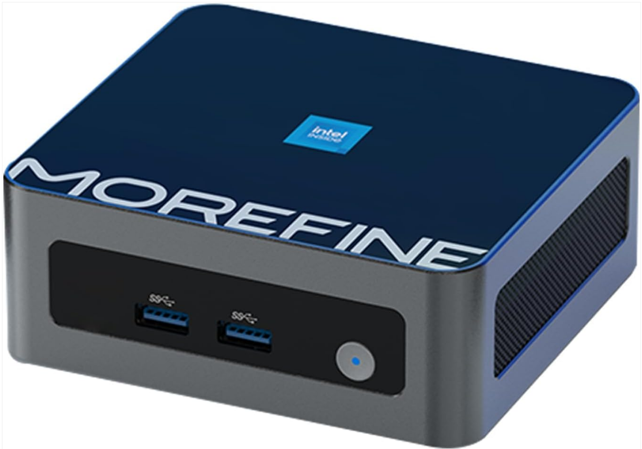
Image: Front view of the MOREFINE M9 Mini PC, showcasing its compact design and front USB ports.

The MOREFINE M9 Mini PC is a compact and powerful desktop computer designed for various applications, from home entertainment to office work. It features a 12th Gen Intel AlderLake N100 processor, 16GB DDR4 RAM, and a 512GB M.2 NVME SSD, offering efficient performance in a small form factor. This manual provides detailed instructions to help you get the most out of your device.