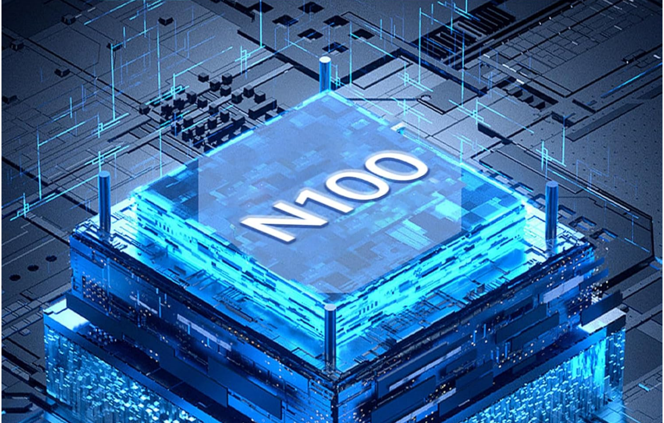
Image: Detailed view of the 12th Gen Intel Alder Lake-N100 Processor, highlighting its specifications.