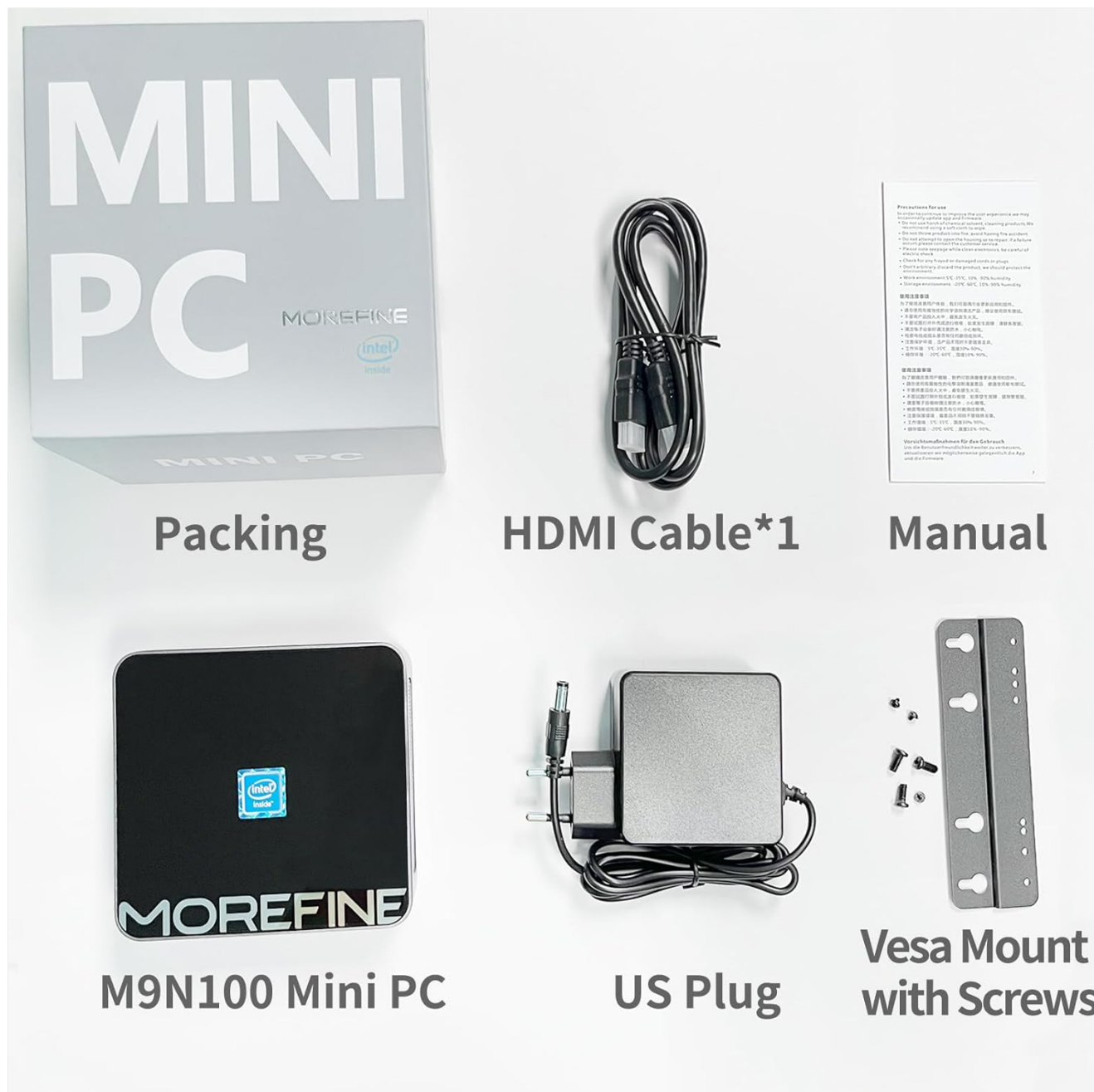
Image: A visual representation of the package contents, including the Mini PC, HDMI cable, power adapter, VESA mount, and manual.