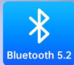
Image: Visual representation highlighting the high-speed network capabilities of the Mini PC, including WiFi 6, Bluetooth 5.2, and 2500 Mb/s Ethernet.