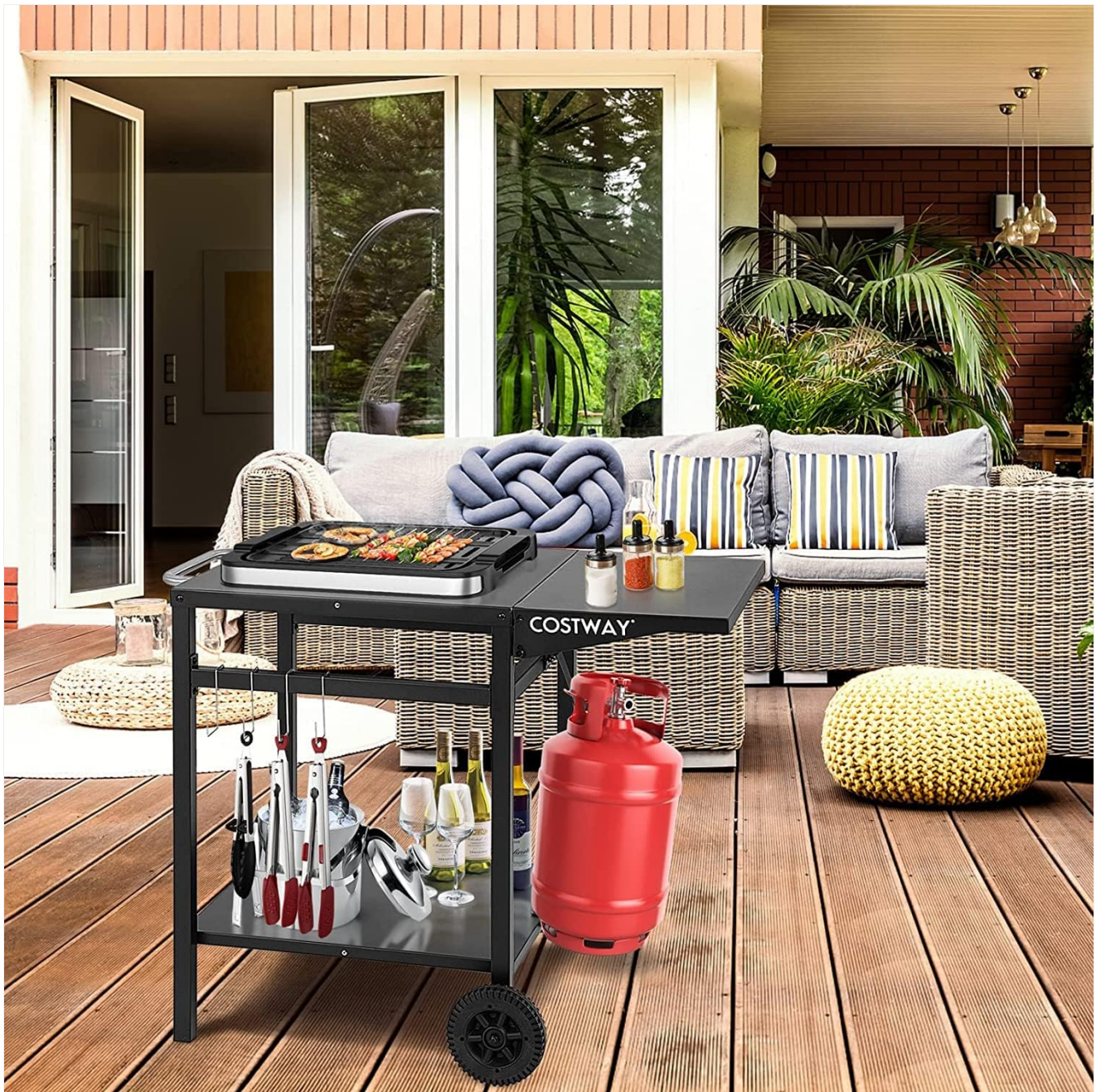
Figure 2.2: Examples of the grill cart's versatile applications, such as a food preparation table, grill table, storage unit, and plant stand.