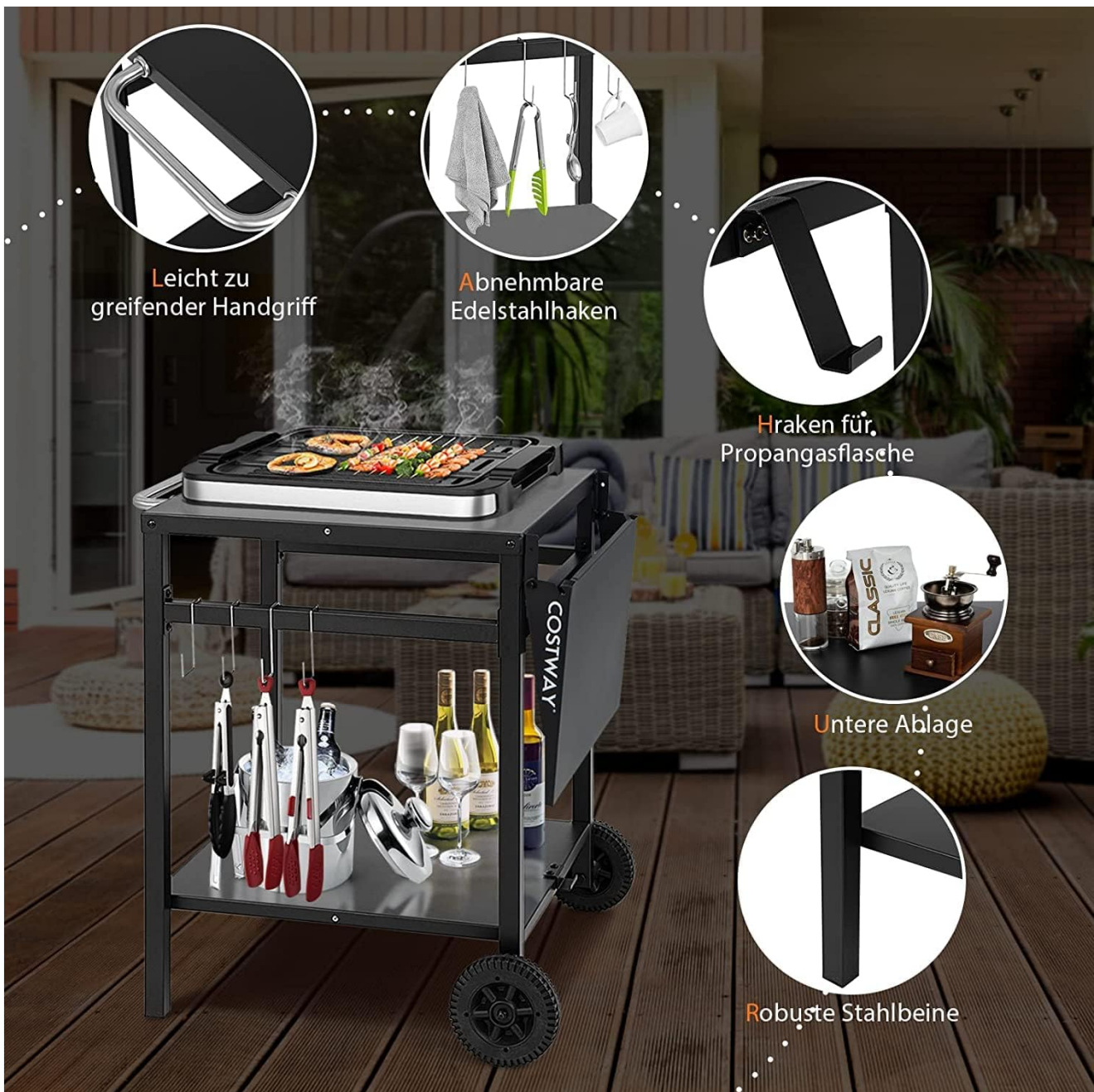
Figure 5.3: The grill cart configured for various outdoor cooking needs, showing space for a pizza oven, firewood, and hanging utensils.