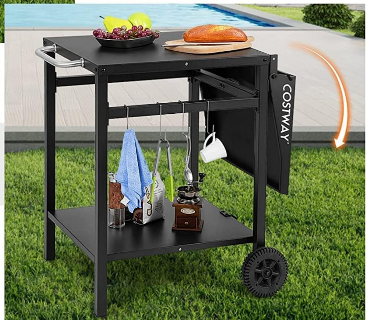
Figure 2.1: The COSTWAY Grill Cart in an outdoor setting, showcasing its two shelves and hanging hooks.

Faltbarer Beistelltisch für Platzersparnis