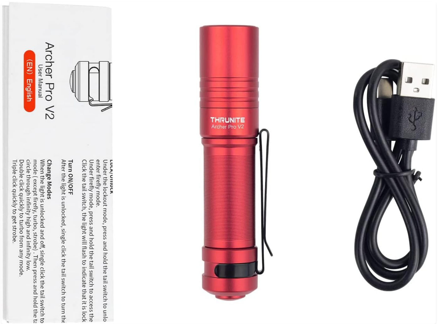
Figure 7: Product Specifications Comparison - Key features and dimensions of the Archer Pro V2.