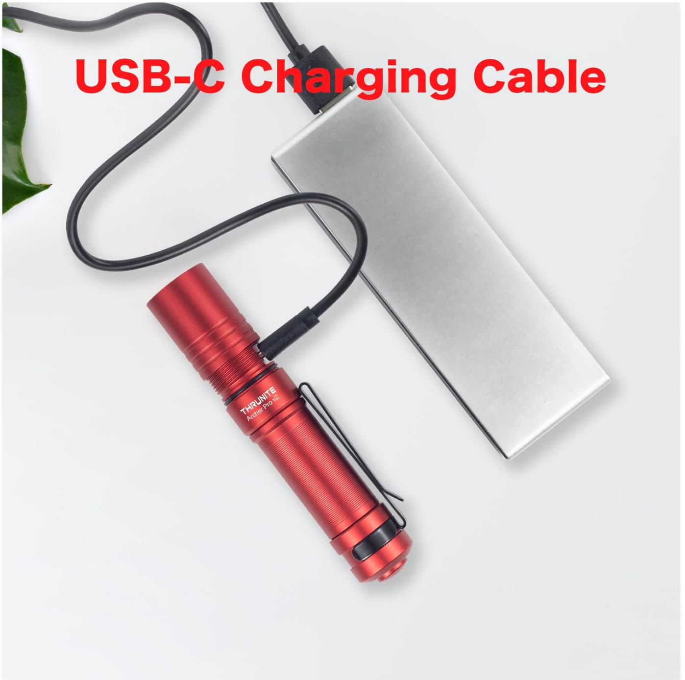
Figure 2: USB-C Charging - Connect the cable to the flashlight's hidden port for convenient recharging.