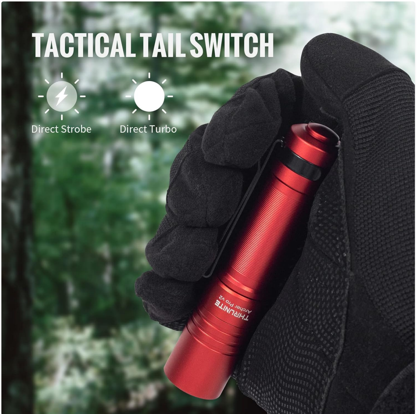
Figure 4: Tactical Tail Switch - Easy access to Turbo and Strobe modes with simple clicks.