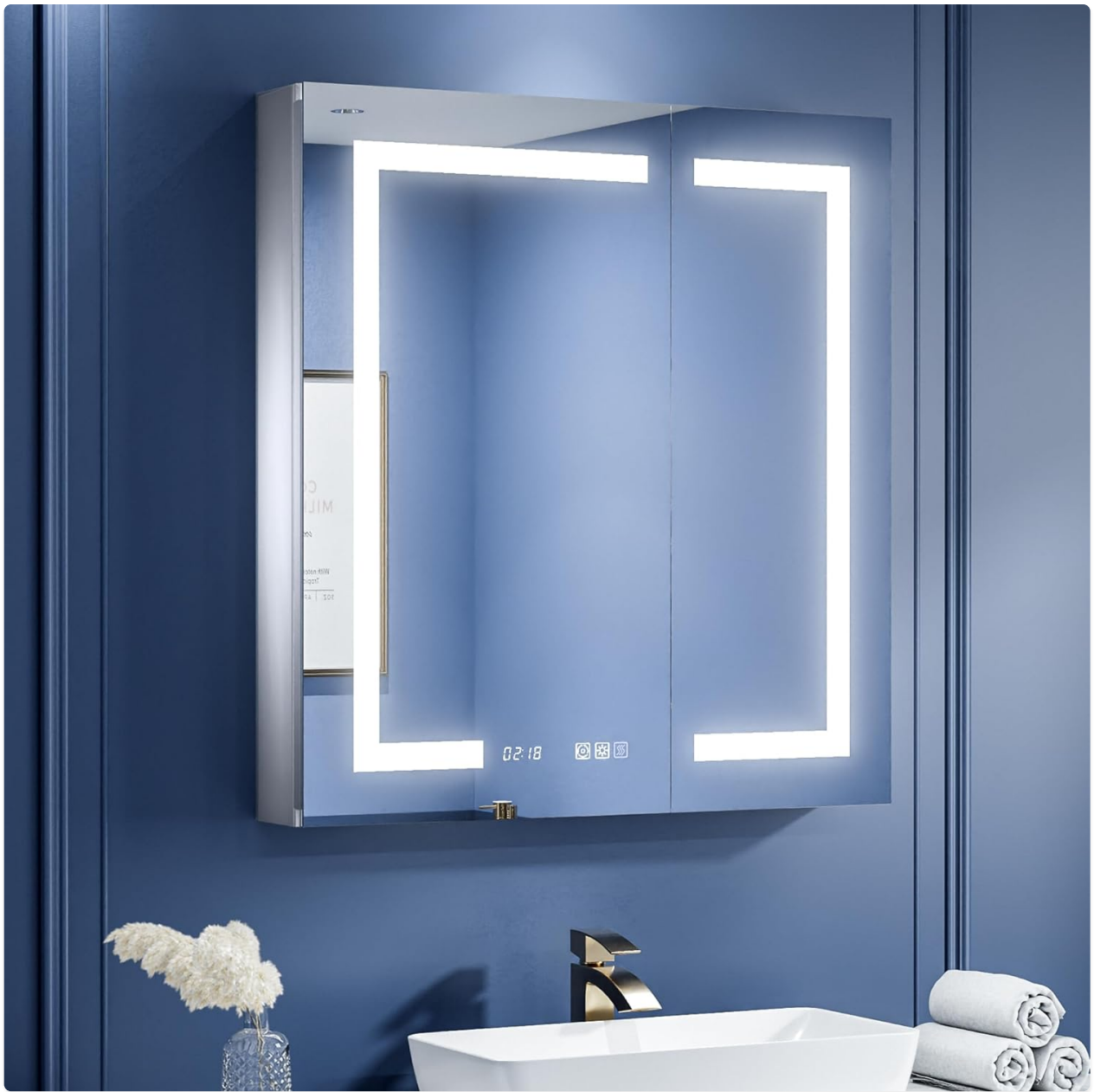
Image: Front view of the ExBrite 30"x32" Lighted Medicine Cabinet, showcasing its illuminated mirror and sleek design.