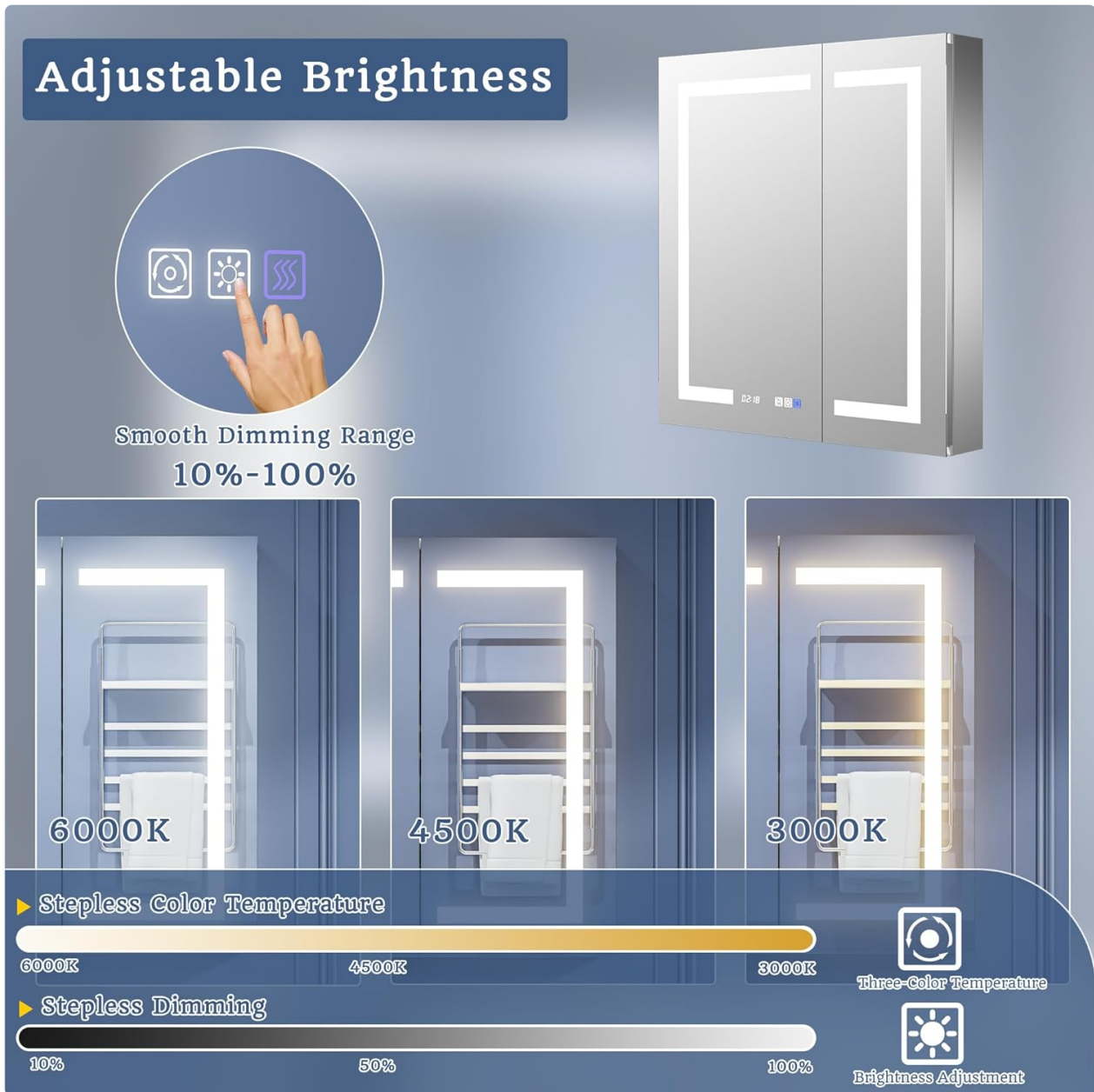
Image: Visual representation of the adjustable brightness range (10%-100%) and color temperature options (3000K, 4500K, 6000K).

The cabinet features stepless brightness adjustment from 10% to 100% and stepless color temperature adjustment from 3000K (warm) to 6000K (cool). Use the touch controls on the mirror surface to adjust to your preference. The mirror also has a memory function that retains the last lighting setting.