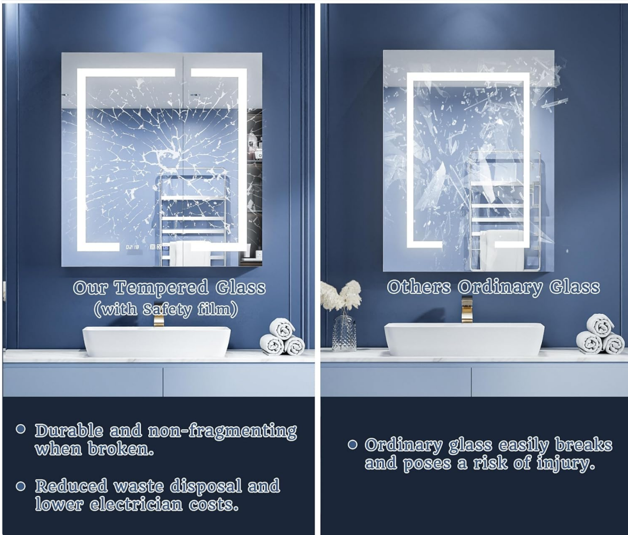
Image: Comparison highlighting the durability and non-fragmenting nature of the tempered glass mirror with safety film.