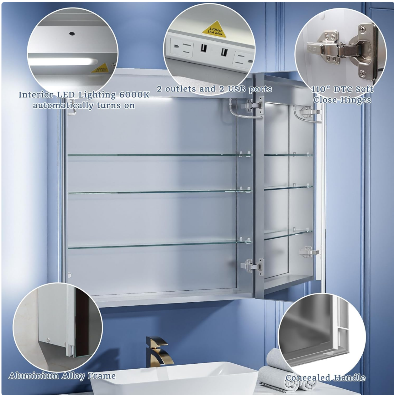
Image: Detailed view of the interior, showing the 6000K LED sensor light, dual outlets, USB ports, and 110° soft-close hinges.