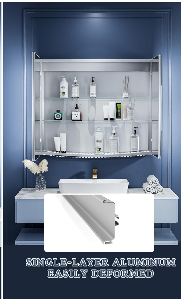
Image: Illustration comparing the stability of a double-layer aluminum frame (used in this product) against a single-layer frame.