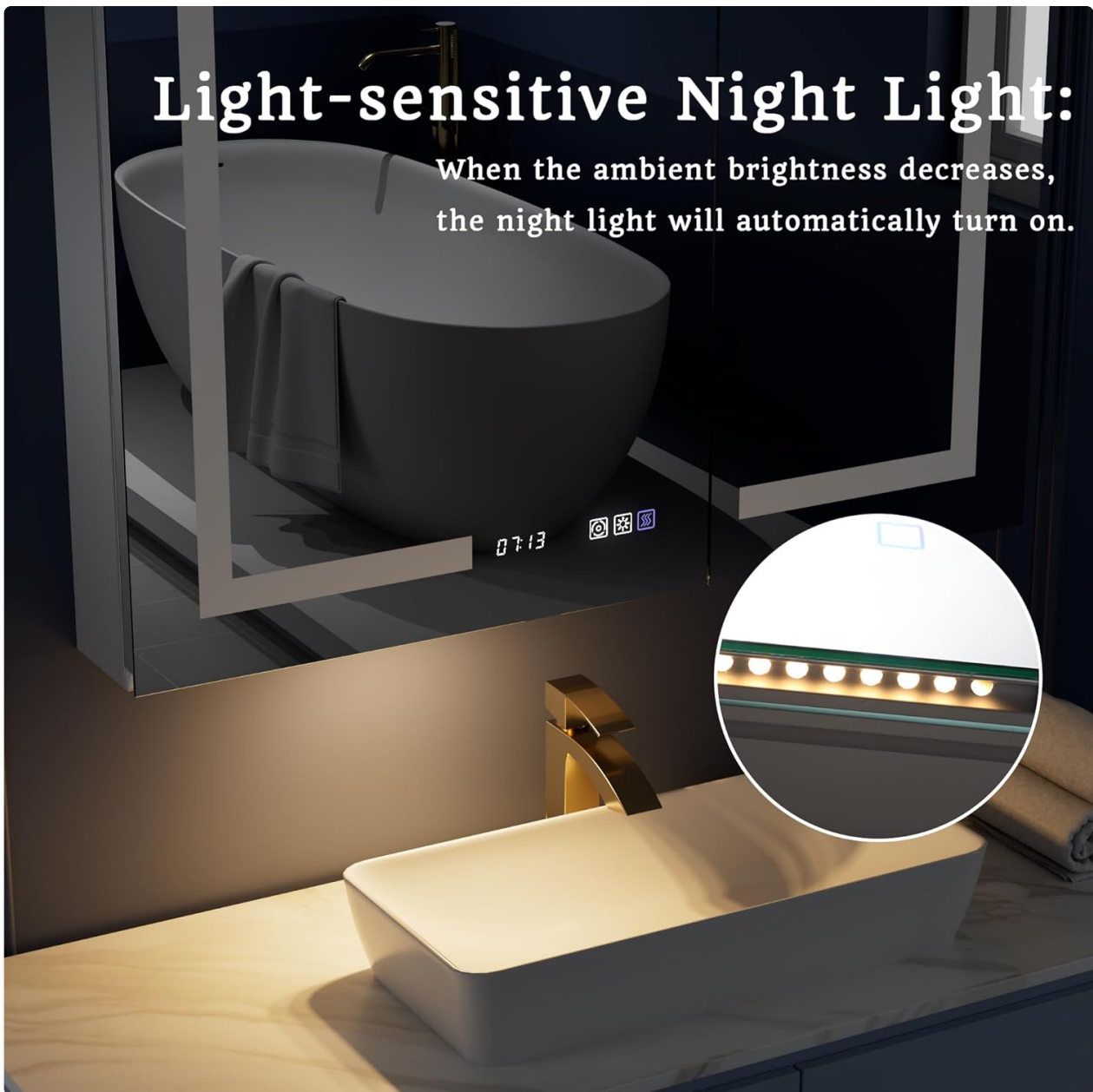
Image: The light-sensitive night light feature, which automatically turns on when ambient brightness decreases.