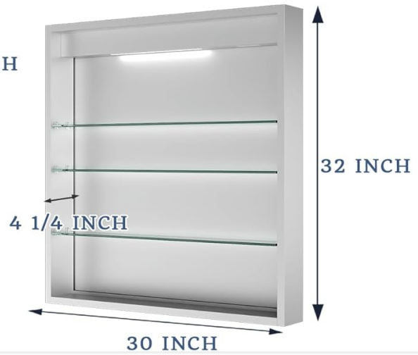
Image: Technical drawing showing the cabinet's overall dimensions (30"W x 32"H x 5.25"D) and recommended cutout dimensions for recessed installation (30"W x 32"H x 4.25"D).