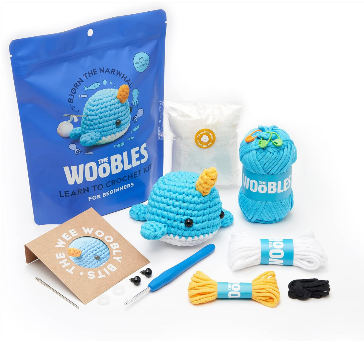
Image 5: A finished Björn The Narwhal, showcasing the final appearance of the crocheted animal.