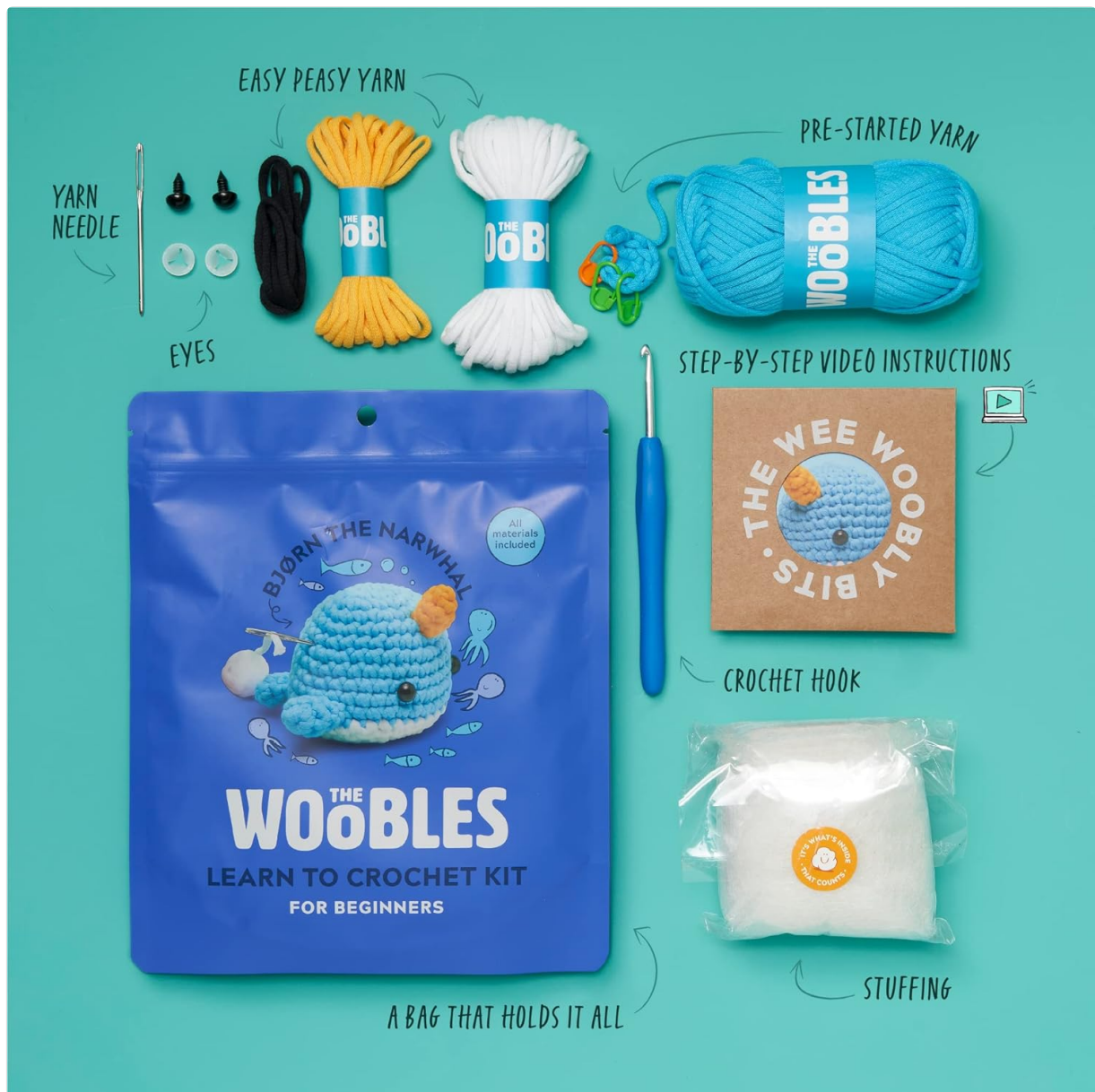
Image 1: All materials included in The Woobles Björn The Narwhal Crochet Kit. This includes yarn in blue, yellow, and white, a crochet hook, yarn needle, plastic safety eyes, stuffing, and instructions.