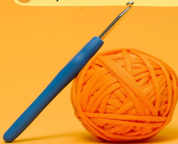
Image 4: A close-up view of The Woobles Easy Peasy Yarn, emphasizing its suitability for beginners due to its texture and visibility of stitches.