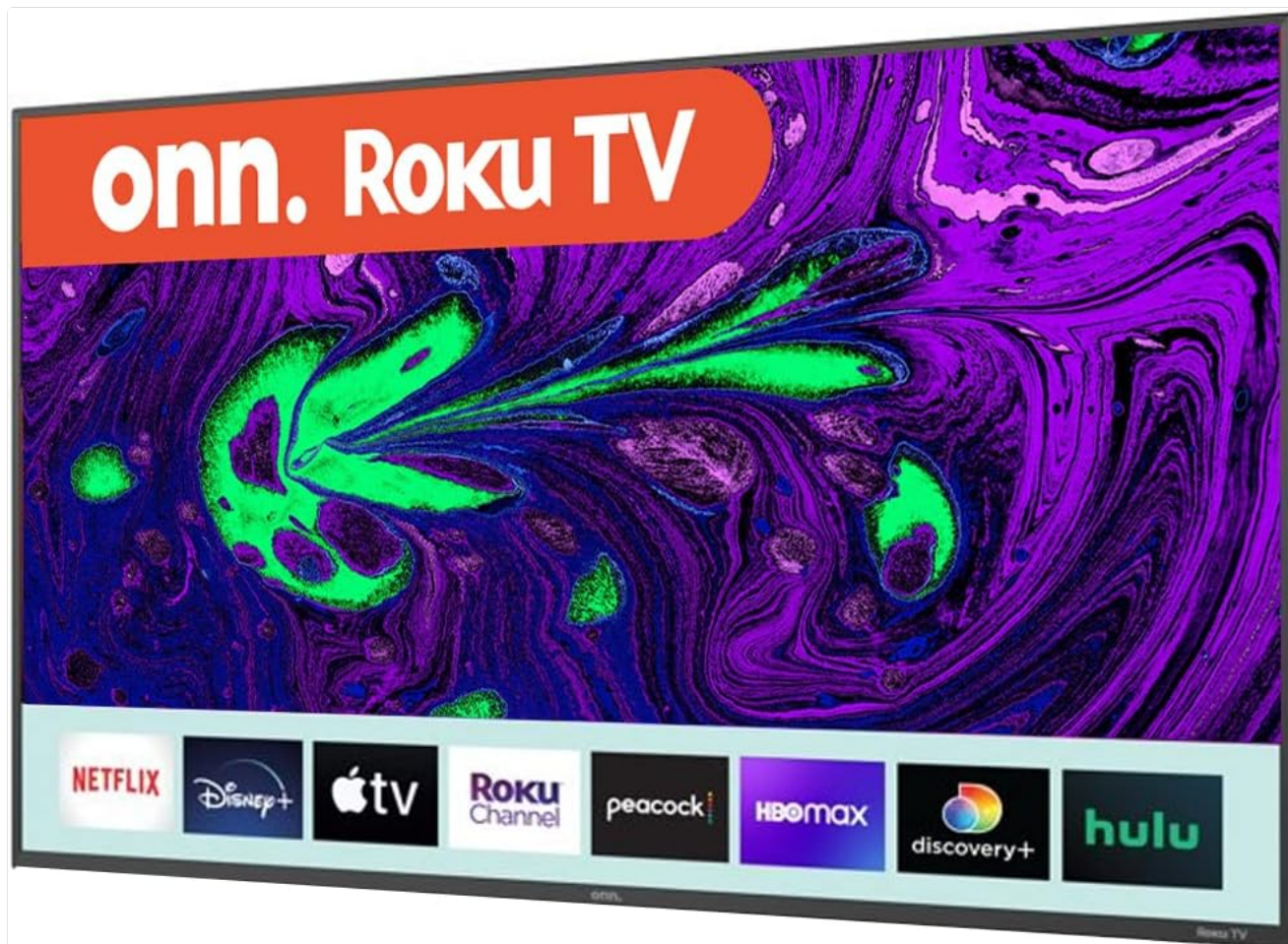
Figure 3: Angled view of the ONN 55-Inch Series 1 4K Smart LED TV, with the remote control visible in the foreground, illustrating its user-friendly design.