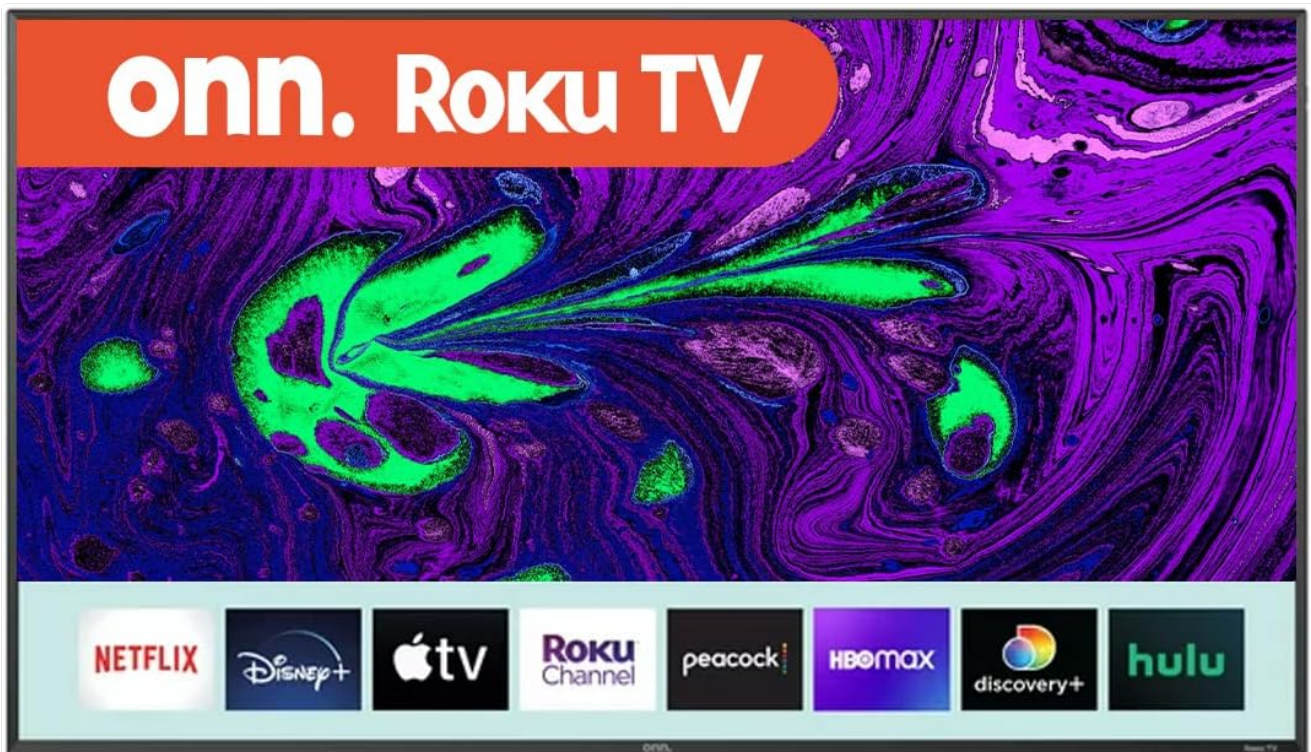
Figure 1: Front view of the ONN 55-Inch Series 1 4K Smart LED TV, showcasing its sleek design and on-screen smart TV interface.

This manual provides essential information for the safe and efficient operation of your ONN 55-Inch Series 1 4K 2160p Smart LED TV. Please read these instructions thoroughly before using your television and retain them for future reference. This high-definition smart TV offers an exceptional viewing experience with its 55-inch LED screen and 4K 2160p resolution, displaying sharp, vibrant images in stunning detail. It features a 60Hz refresh rate for smooth content playback and comes equipped with smart features like WiFi connectivity and a wide selection of streaming applications.