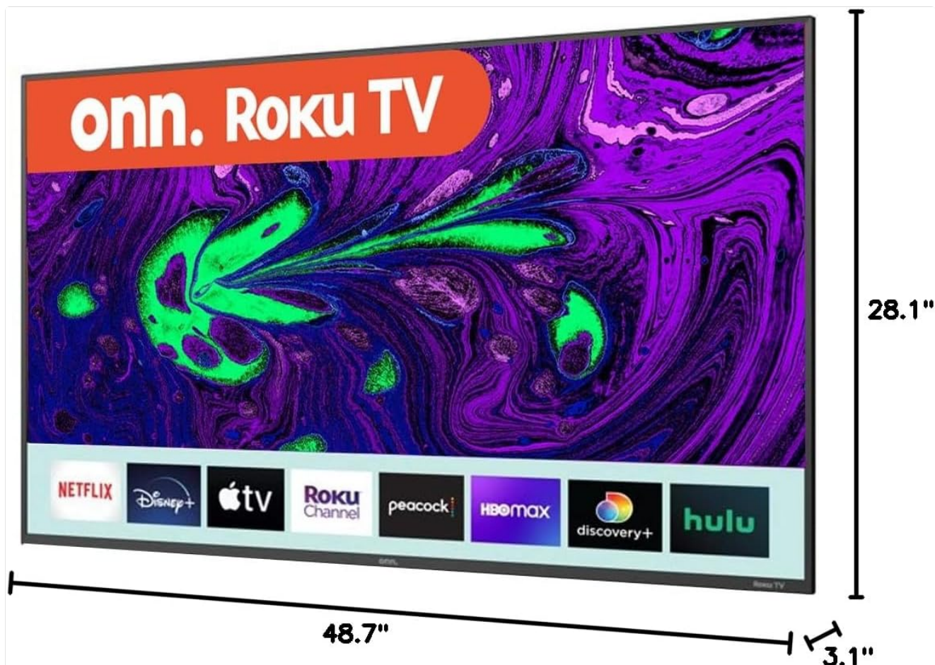
Figure 4: Diagram illustrating the dimensions of the ONN 55-Inch Series 1 4K Smart LED TV.