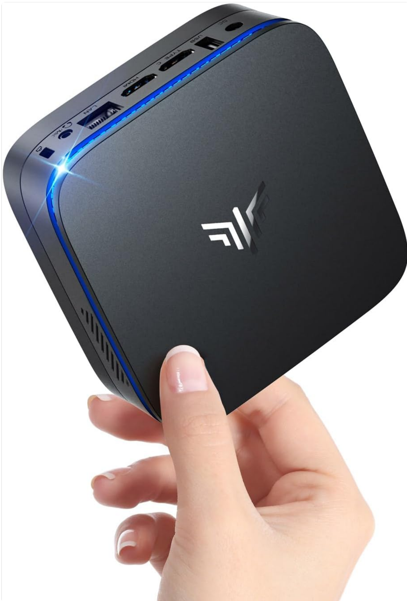
The NiPoGi AK1Plus Mini PC, a compact and powerful desktop solution, is designed for various computing needs from office work to home