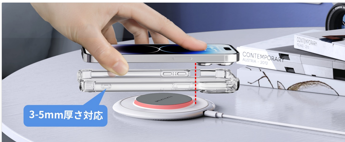
Figure 5: The charger's design ensures no obstruction to the device's camera lens during charging.