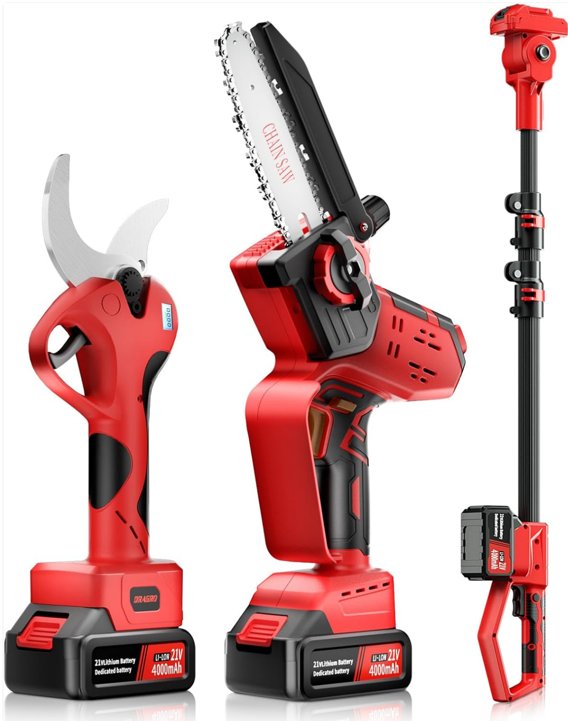
Image: The Dragro 2-in-1 Electric Pruning Shears and 6-inch Cordless Mini Chainsaw with its extension pole and battery.