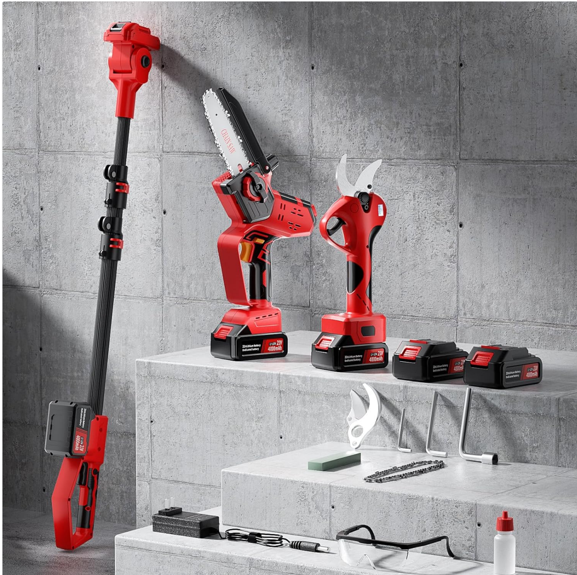
Image: All components of the Dragro 2-in-1 Electric Pruning Shears and Mini Chainsaw kit, including tools, batteries, charger, and accessories.