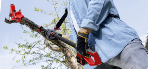
Image: Dimensional overview of the Dragro electric pruning shears, mini chainsaw, and extension pole.