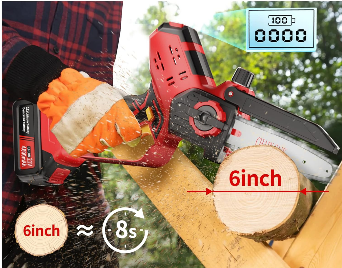
Image: The cordless mini chainsaw cutting a log.