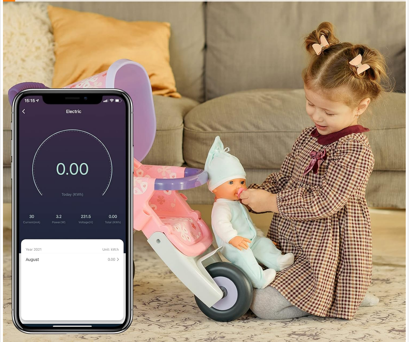
Image: A smartphone screen displaying the "Electric" interface in the Smart Life app, showing energy consumption data (0.00 kWh) with current, power, and voltage readings. A child is playing in the background, implying safe usage.