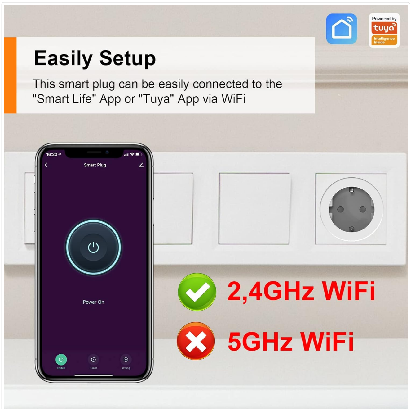
Image: A hand holding the smart plug and inserting it into a power strip, with text indicating to hold the button for 5-10 seconds to enter pairing mode. A phone screen shows the "Smart Life" app interface with a power button and 2.4GHz WiFi compatibility.