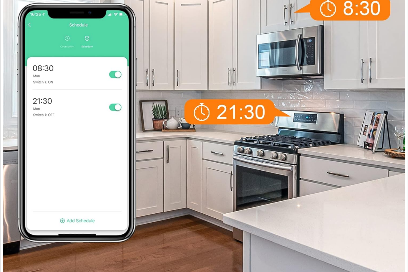
Image: A smartphone screen displaying the "Schedule" interface within the Smart Life app, showing set times for devices to turn on (8:30) and off (21:30) in a kitchen setting.

You can set a schedule or timer to automatically turn on or off the device at the time point