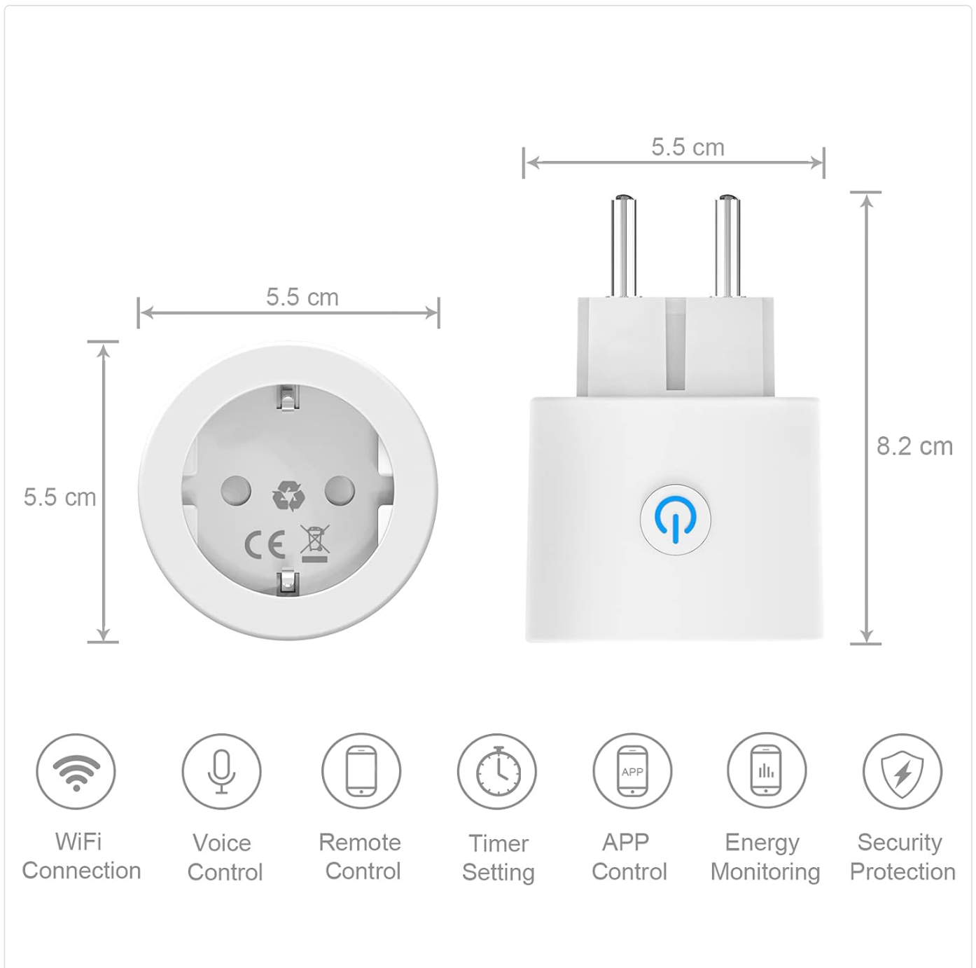
Image: Diagram showing the dimensions of the ANTELA Smart Plug (5.5 x 5.5 x 8.2 cm) and icons representing its features: WiFi Connection, Voice Control, Remote Control, Timer Setting, APP Control, Energy Monitoring, and Security Protection.