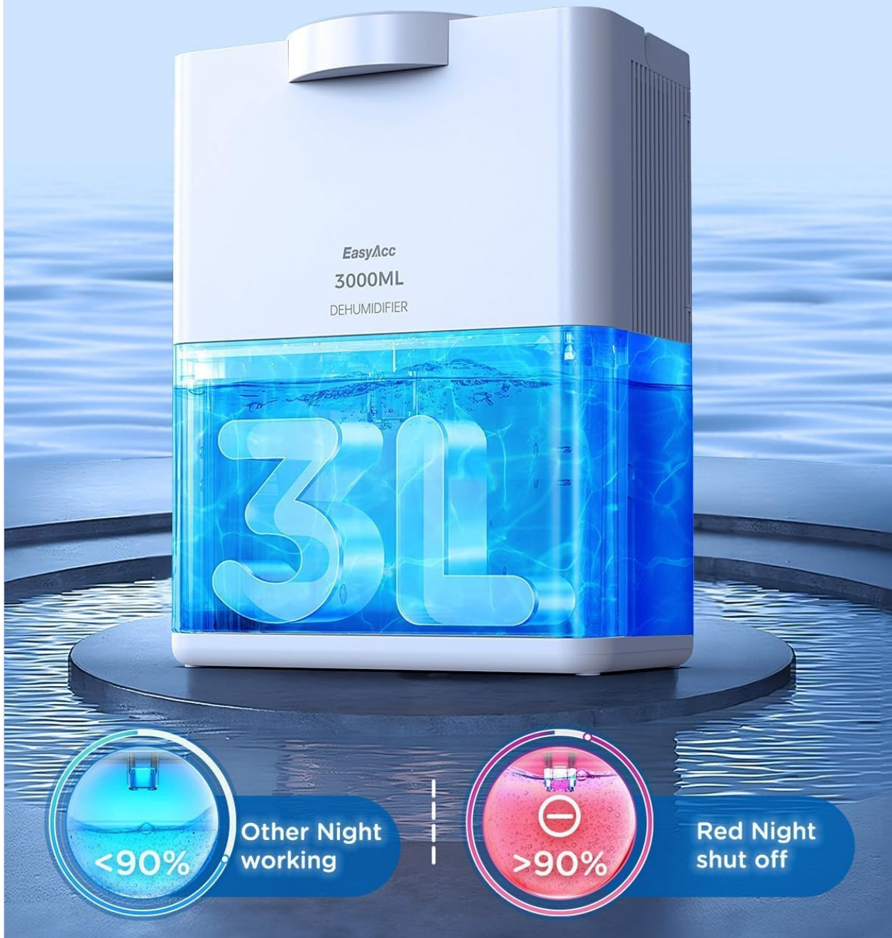
Figure 5.4: 3000ml water tank capacity and automatic shutdown feature.

Automatic Shutdown, No More Frequent Pouring