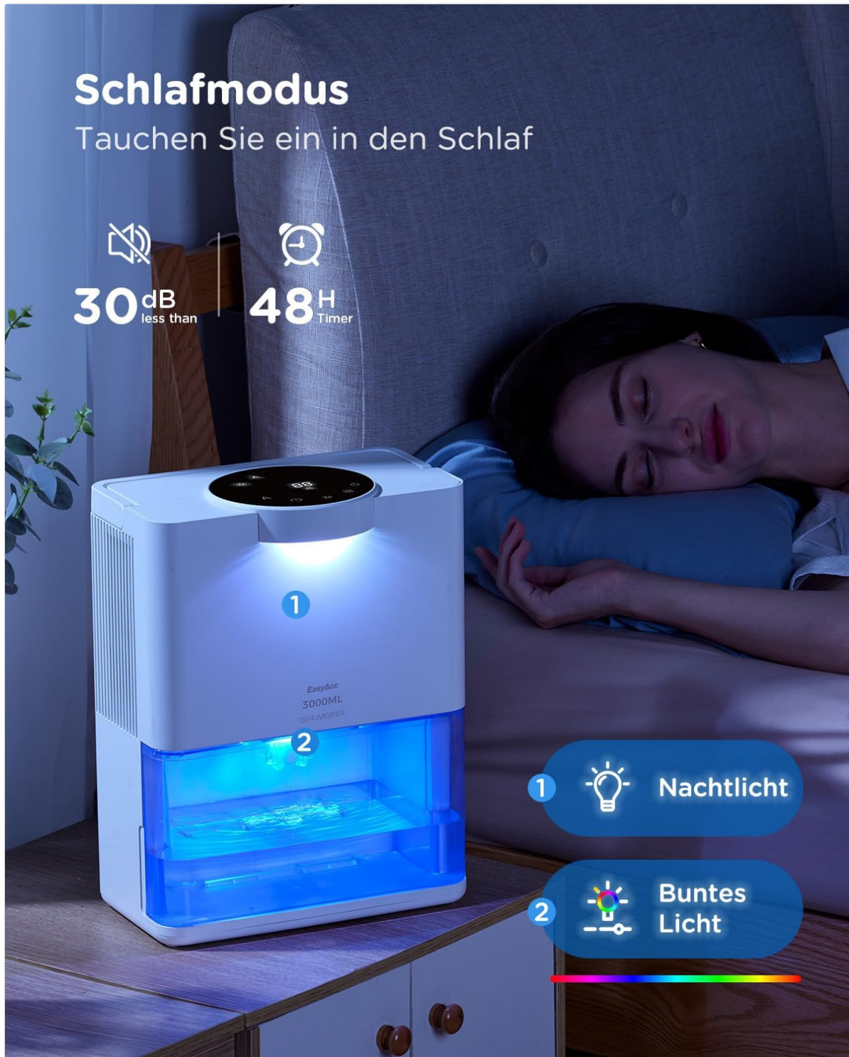
Figure 5.2: Sleep Mode with night light and colorful light options.