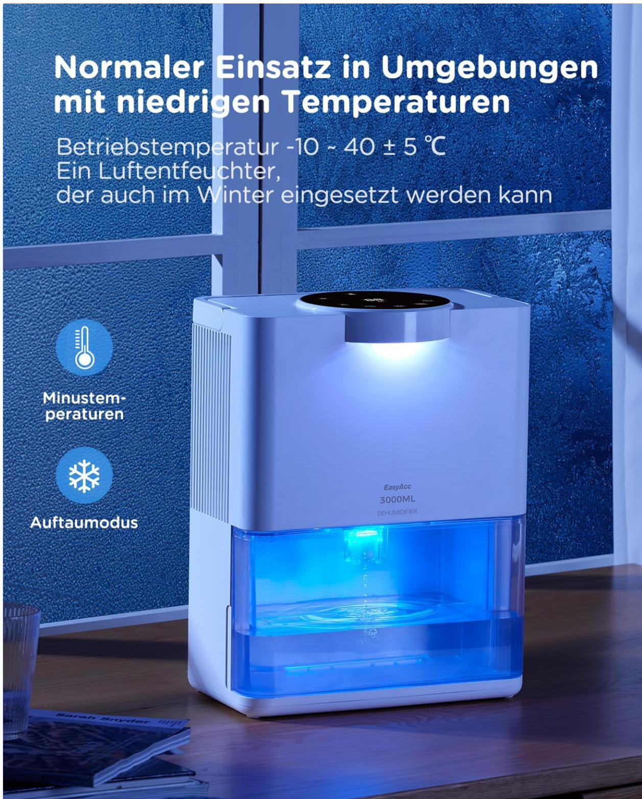
Figure 5.3: Dehumidifier operating in low temperatures with automatic defrost.

When the ambient temperature drops below 15°C, the dehumidifier's automatic defrost function activates to prevent ice buildup on the condensation sheets, ensuring continuous and efficient operation even in cooler conditions.