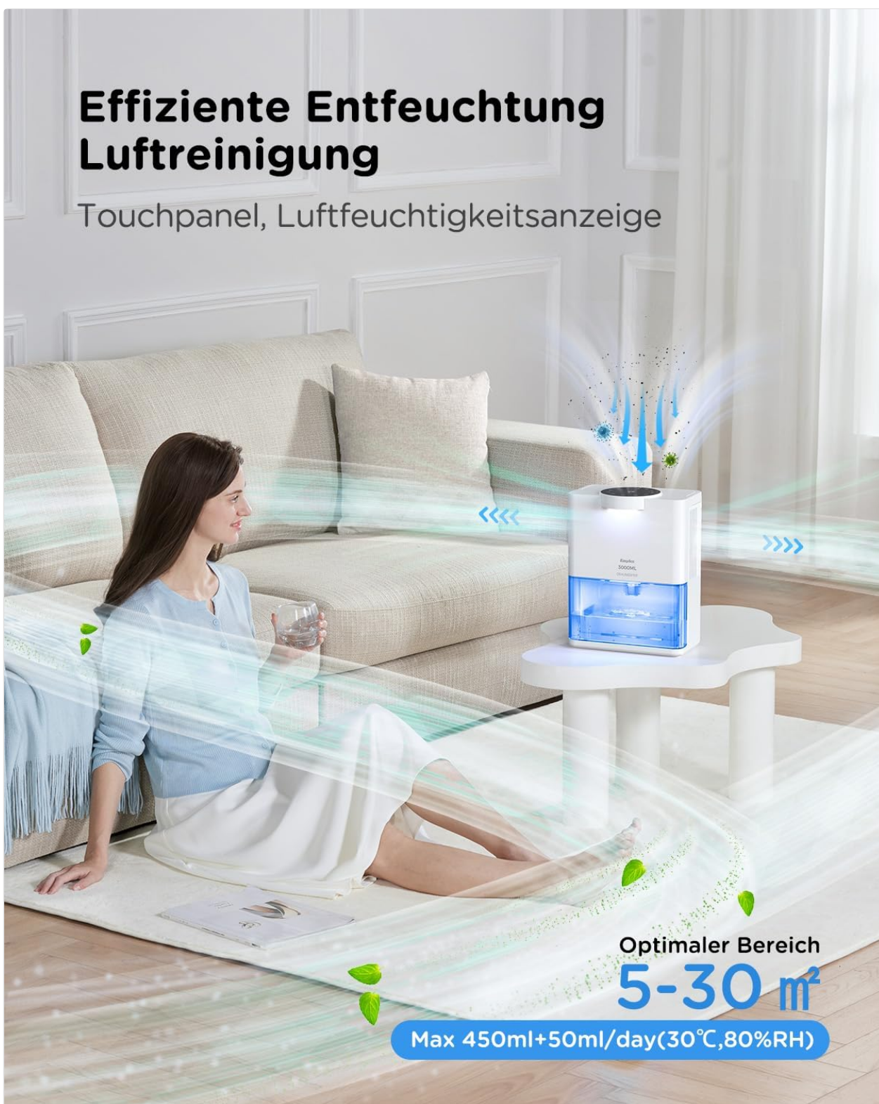
Figure 8.1: Efficient dehumidification and air purification for optimal room sizes.