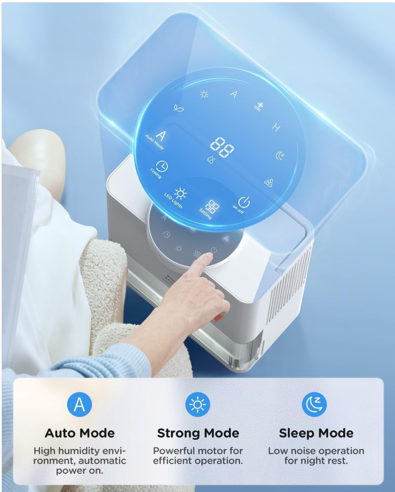
Figure 5.1: Touch screen control panel and operating modes.