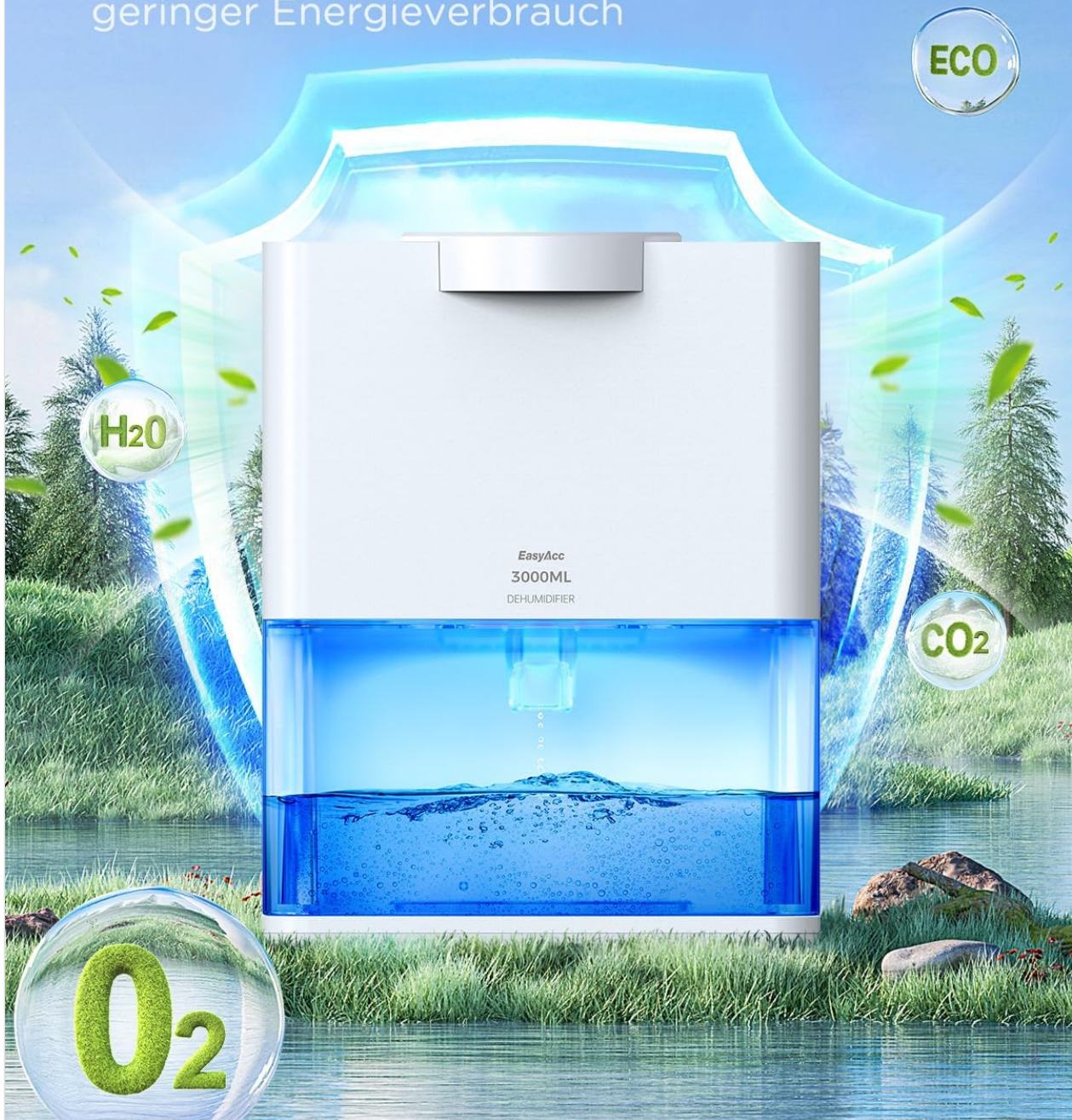
Figure 6.1: The dehumidifier filters dust for cleaner air.

Umweltfreundlich, geringer Energieverbrauch