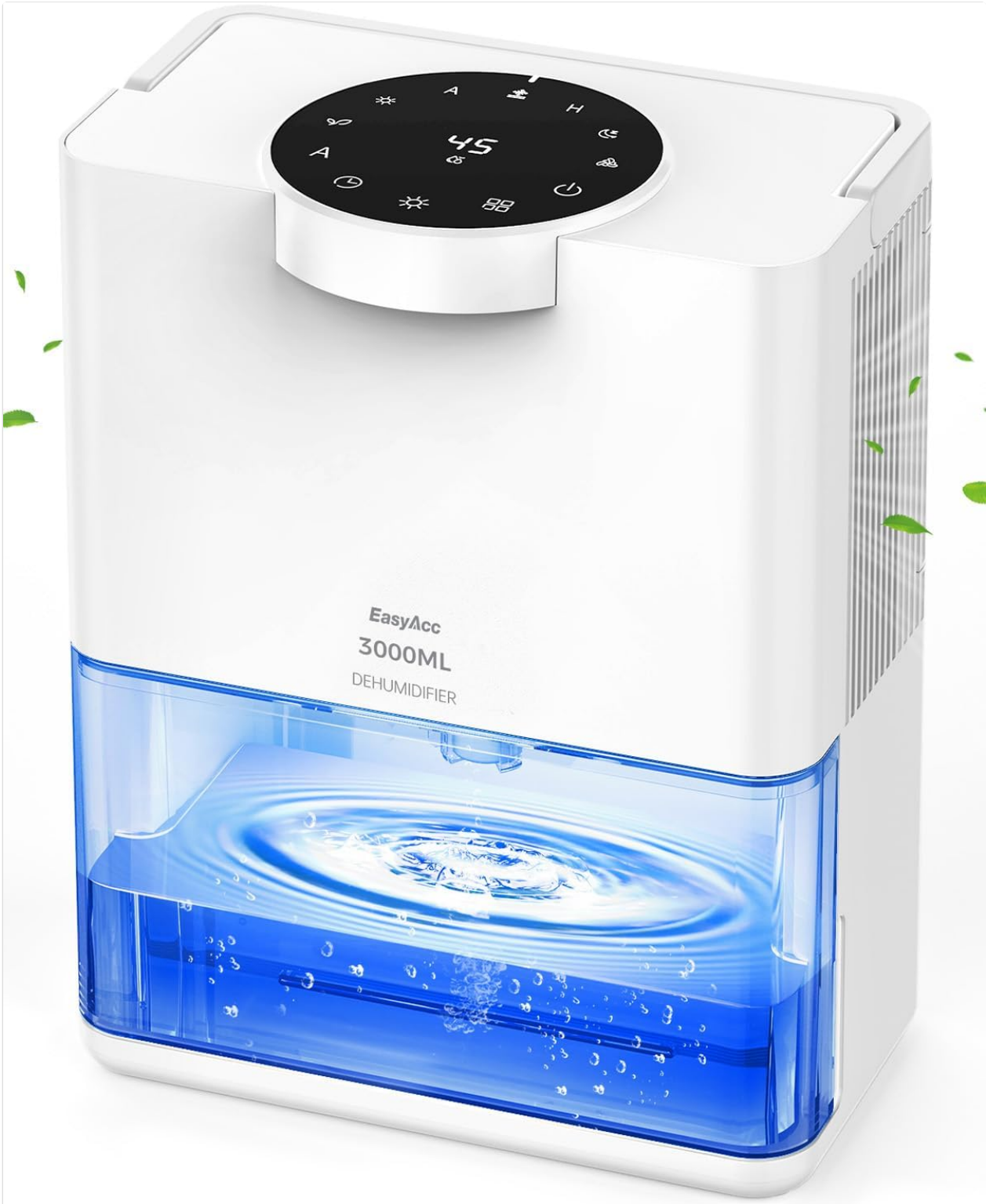
Figure 3.1: EasyAcc 3000ml Electric Dehumidifier with water tank.

The EasyAcc 3000ml Electric Dehumidifier is a compact and efficient device designed to improve your indoor air quality by reducing excess moisture and filtering airborne particles.