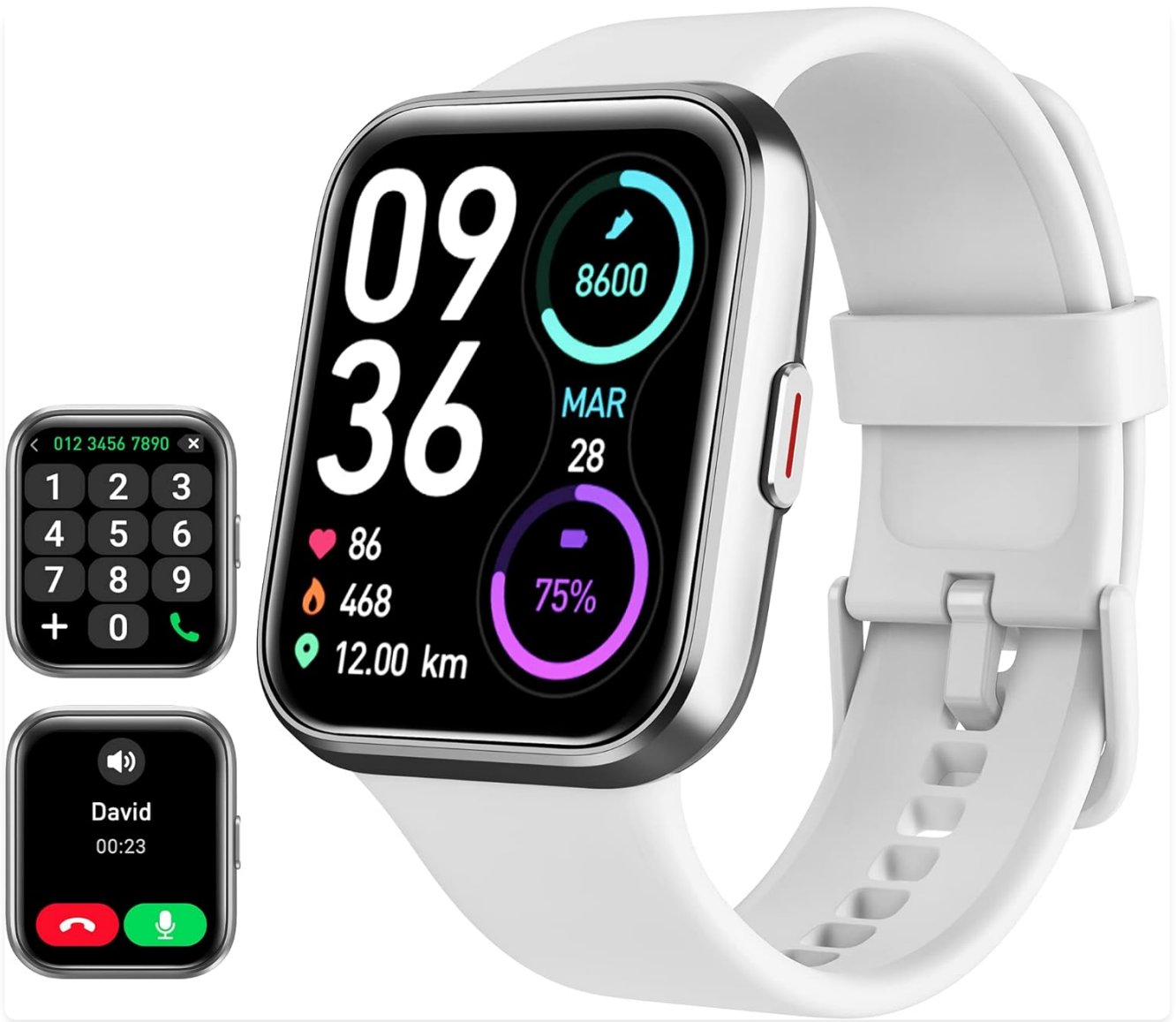
Figure 1: Tensky Bluetooth Smart Watch (ID208Plus) with its main display showing various metrics.