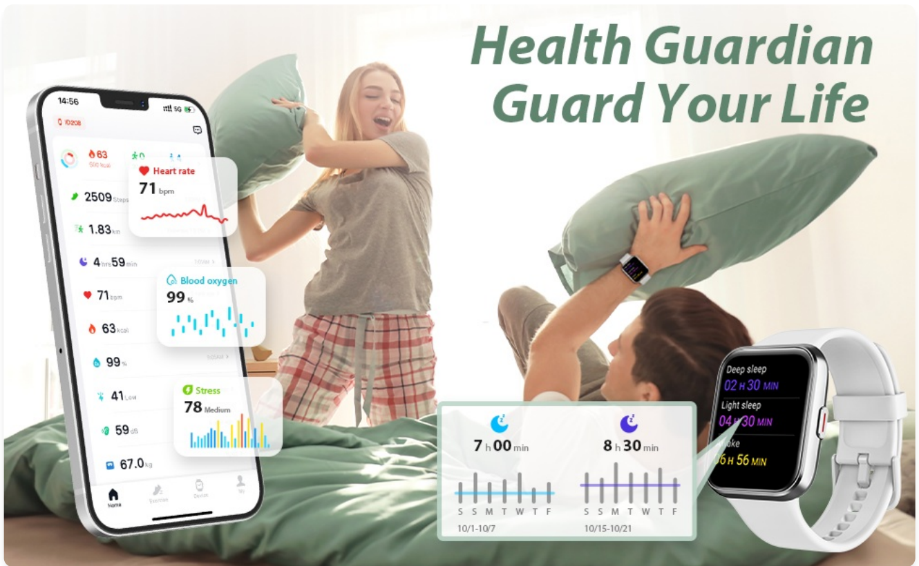
Figure 6: Explore more special features for a smarter life.