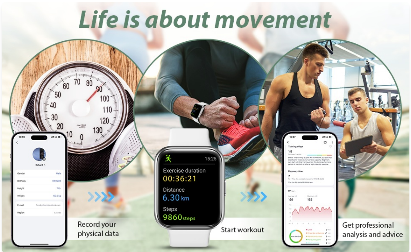
Figure 4: Comprehensive health monitoring features.