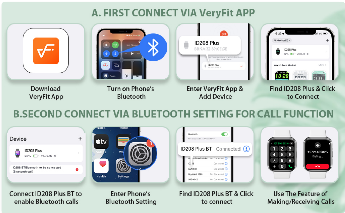
Figure 2: Step-by-step guide for connecting your smartwatch for full functionality.