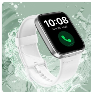
Figure 7: The smartwatch is 5ATM waterproof for daily use.