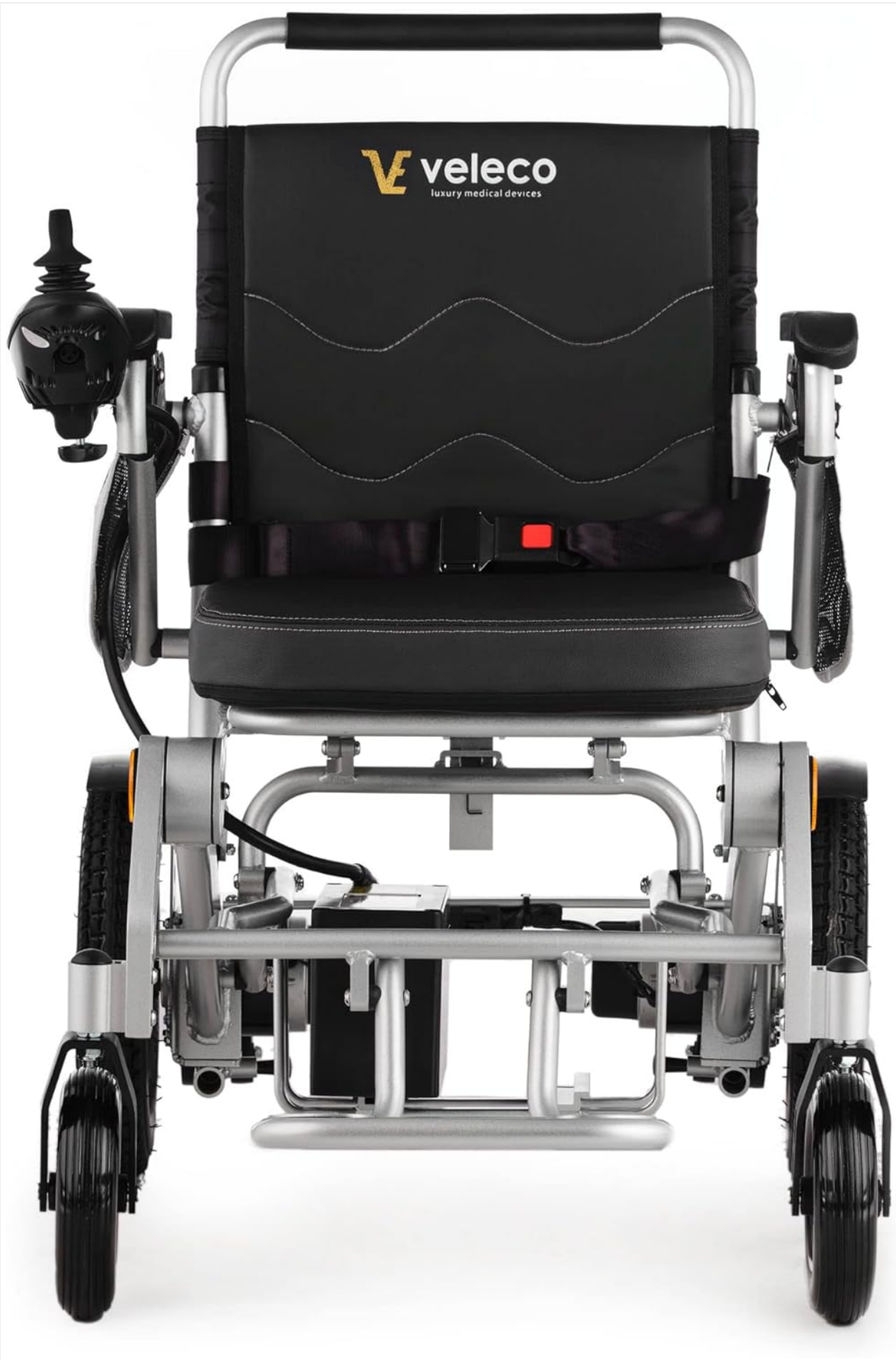
Figure 3.1: Front view, highlighting the footrest and front wheels.