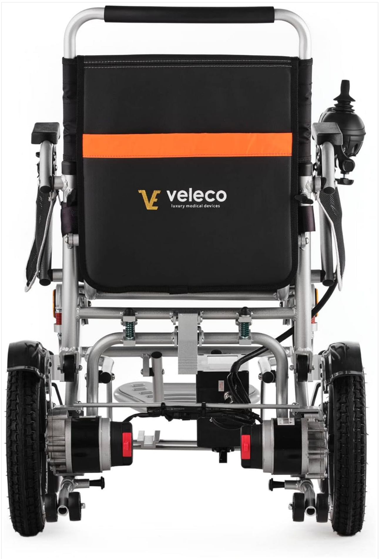
Figure 3.2: Rear view, showing the push handles and rear wheels.