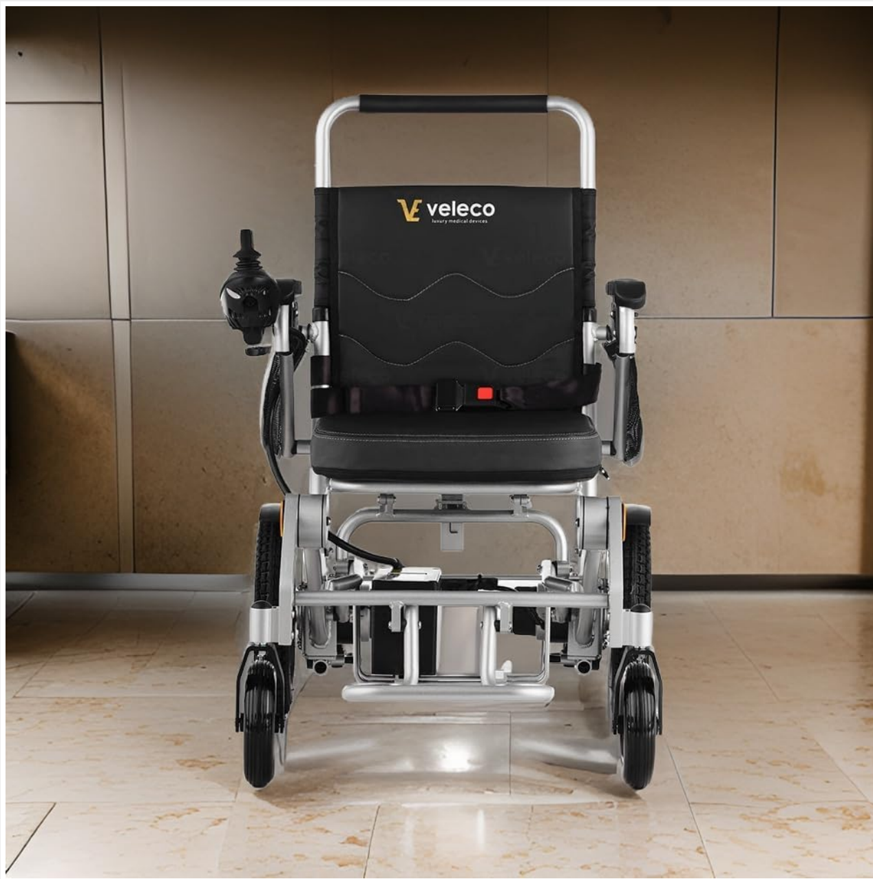
Figure 3.4: View of the powerful 250-watt electric motors on each rear wheel.