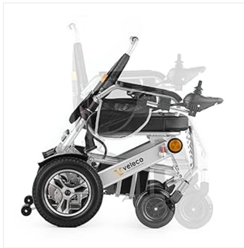
Figure 4.1: Visual guide to the folding and unfolding process of the wheelchair.