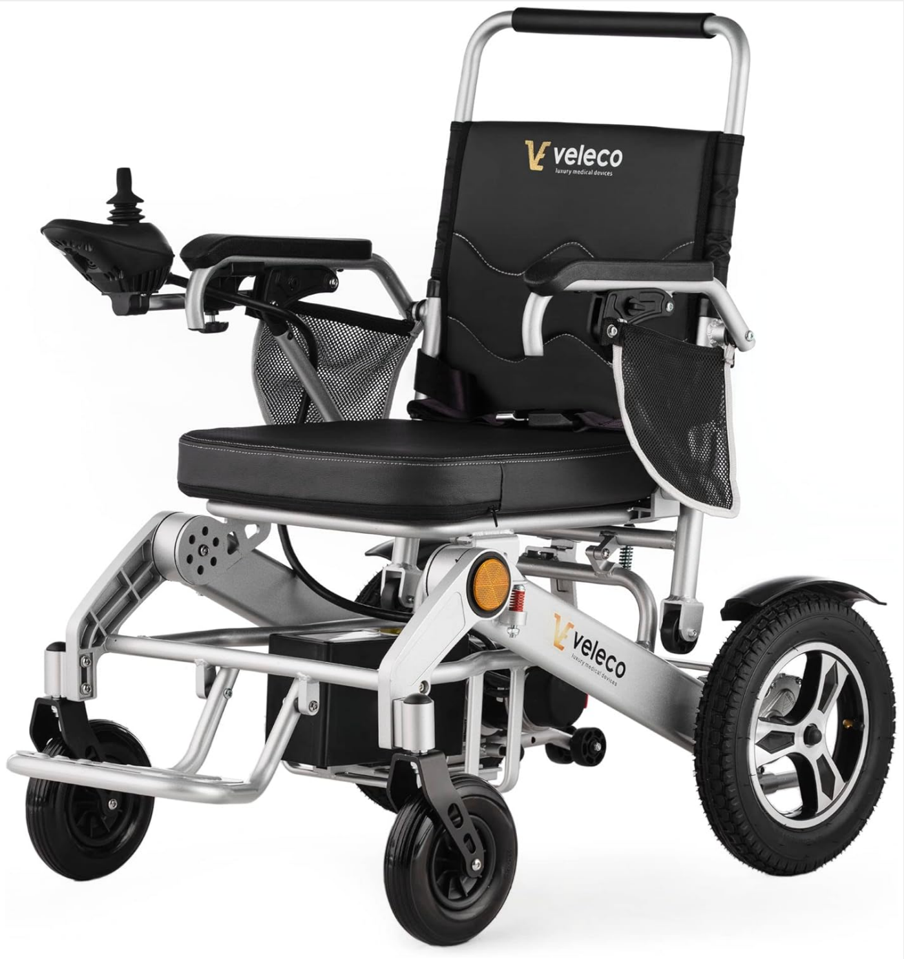
Figure 1.1: The Veleco COSMO Electric Wheelchair, showcasing its compact and modern design.