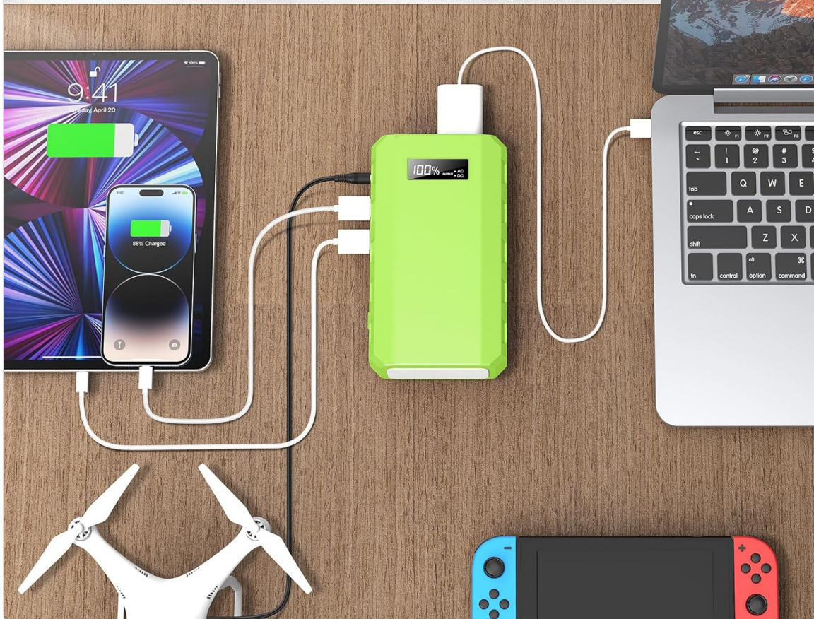
Image: The power station simultaneously charging a tablet, smartphone, laptop, drone, and camera.