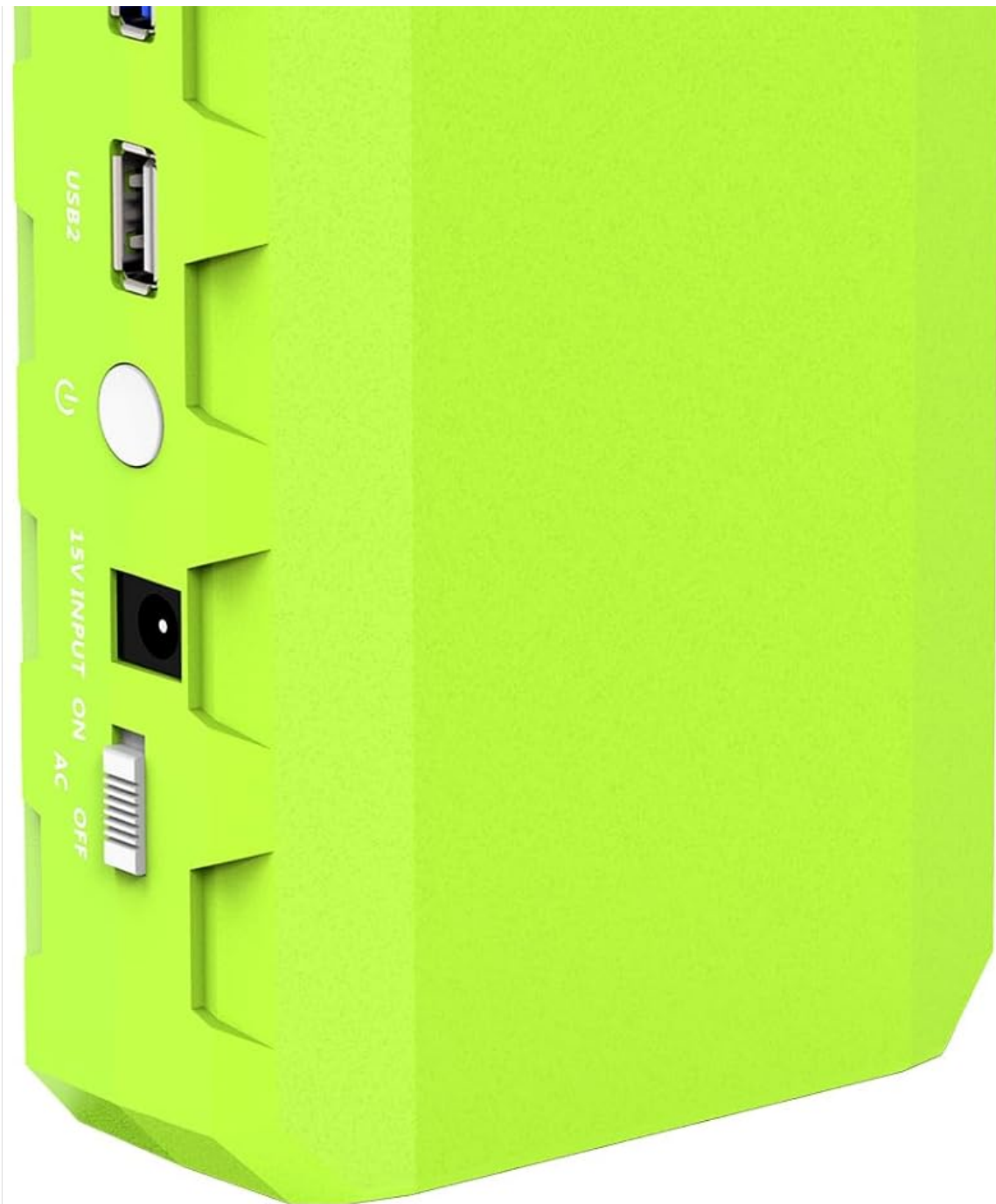
Image: Side view of the power station, highlighting the AC outlet and LED light panel.