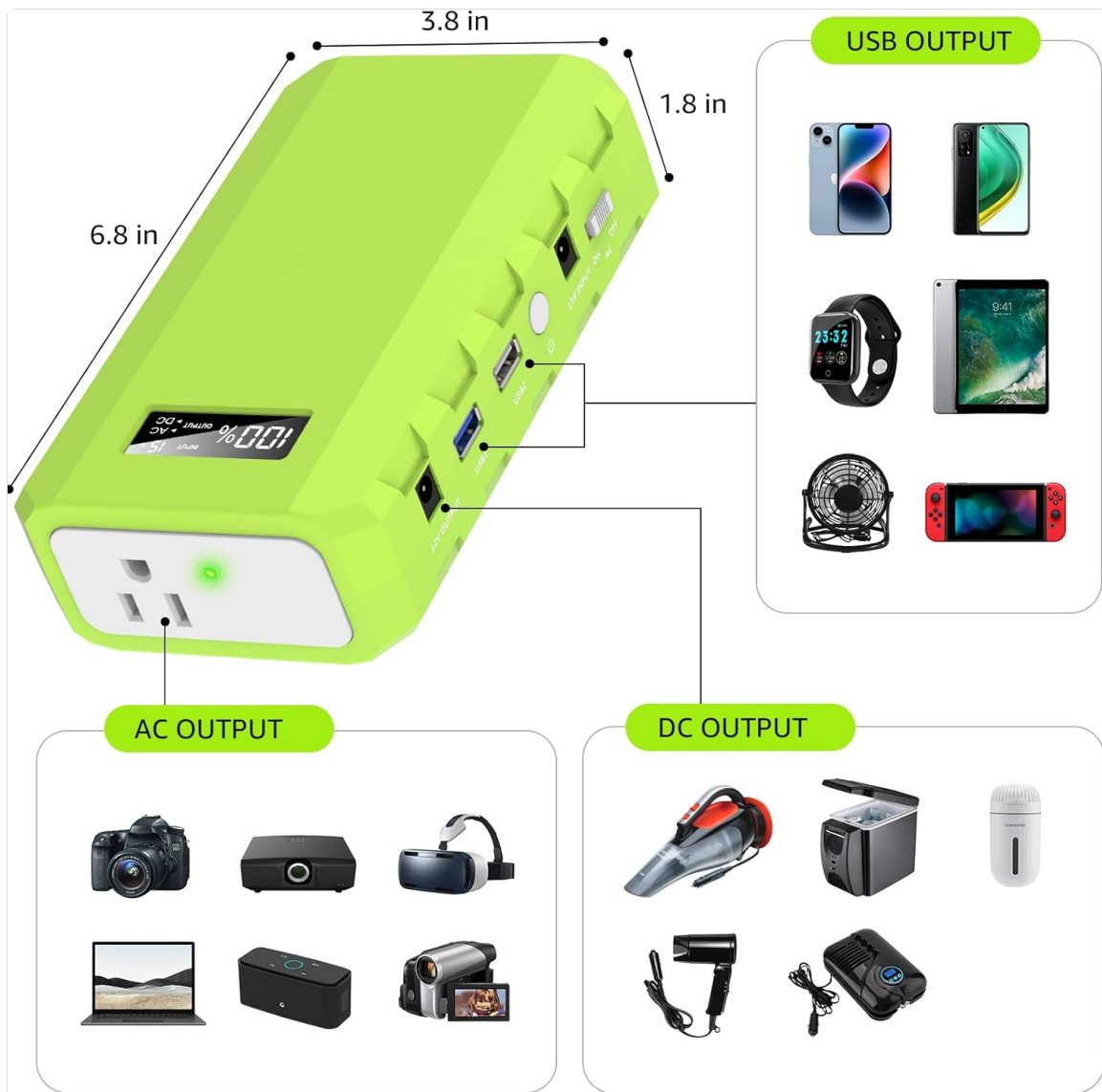
Image: Diagram showing various devices that can be charged via USB, AC, and DC outputs, along with product dimensions.