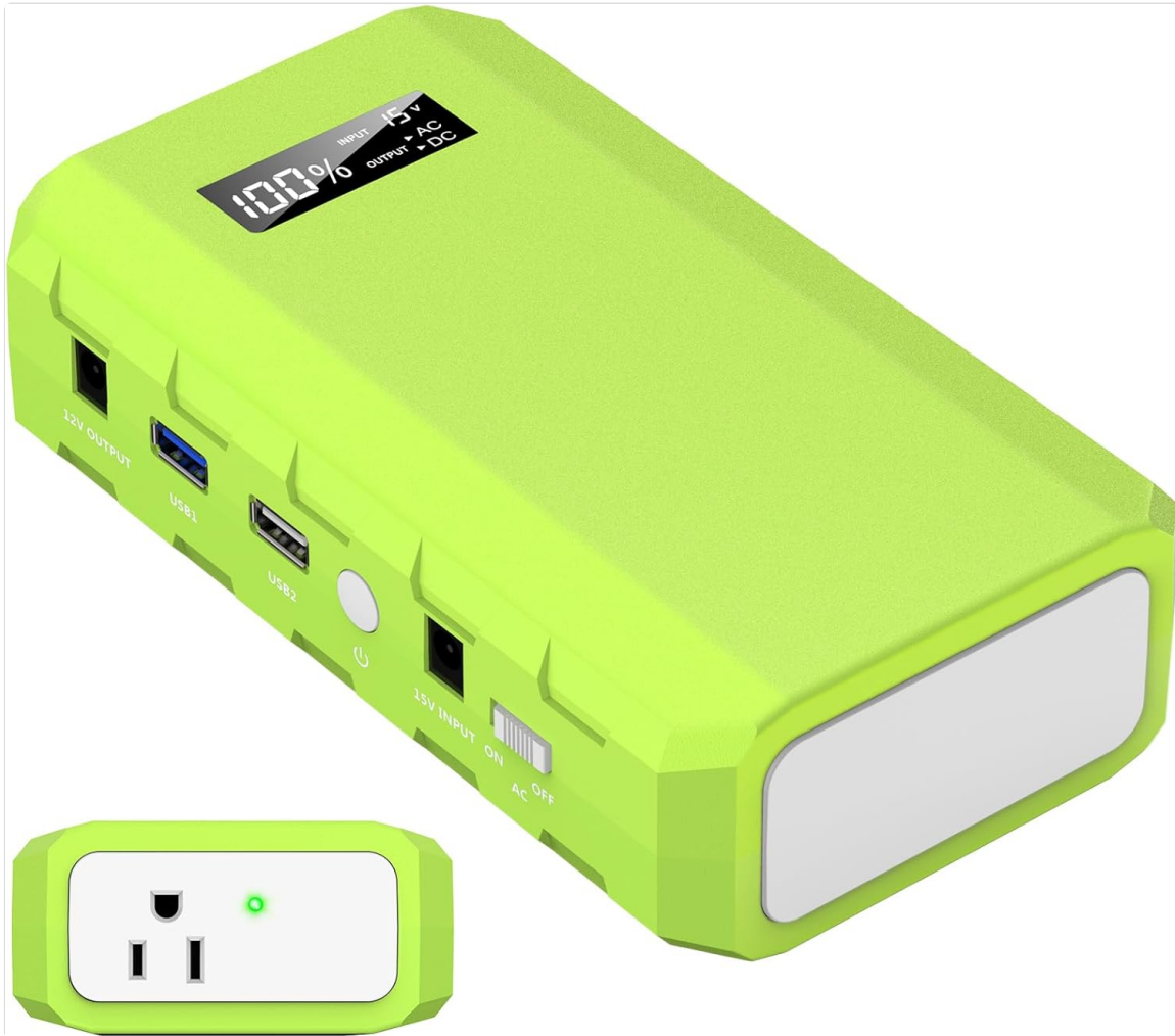
Image: Front view of the powkey Portable Power Station HP500S.

Familiarize yourself with the components and ports of your power station.