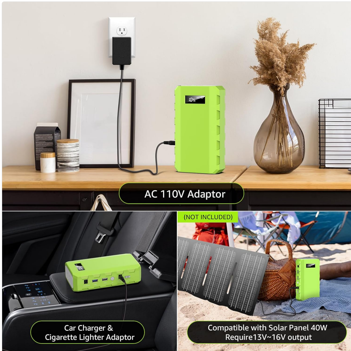
Image: The power station being charged via AC wall adapter, car charger, and a solar panel (solar panel not included).