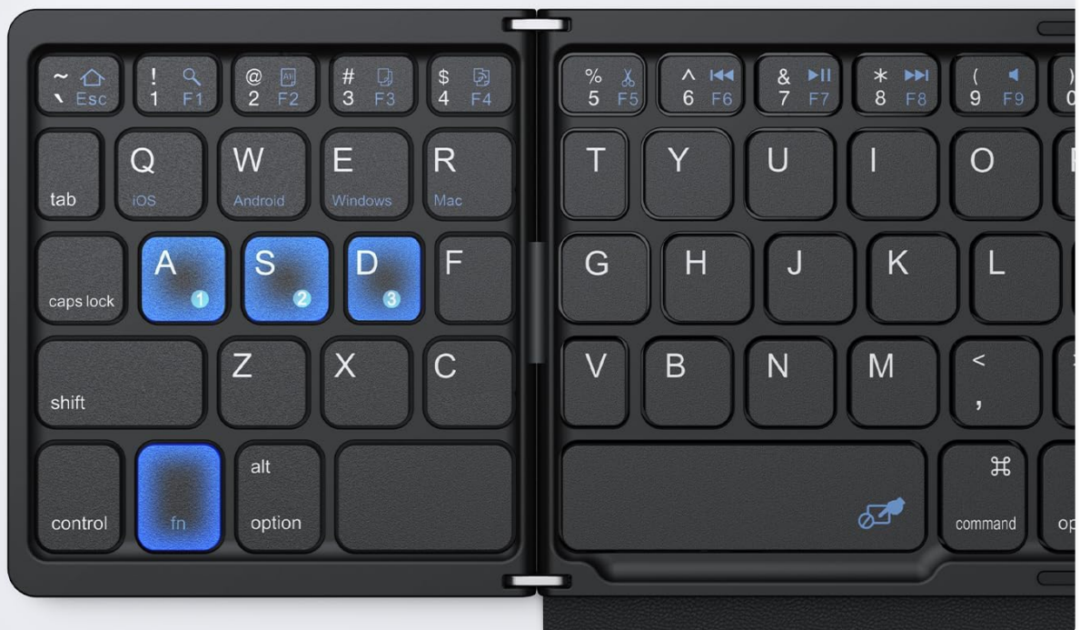
Image: Shows the FN key combinations for selecting iOS, Android, Windows, and Mac operating systems.