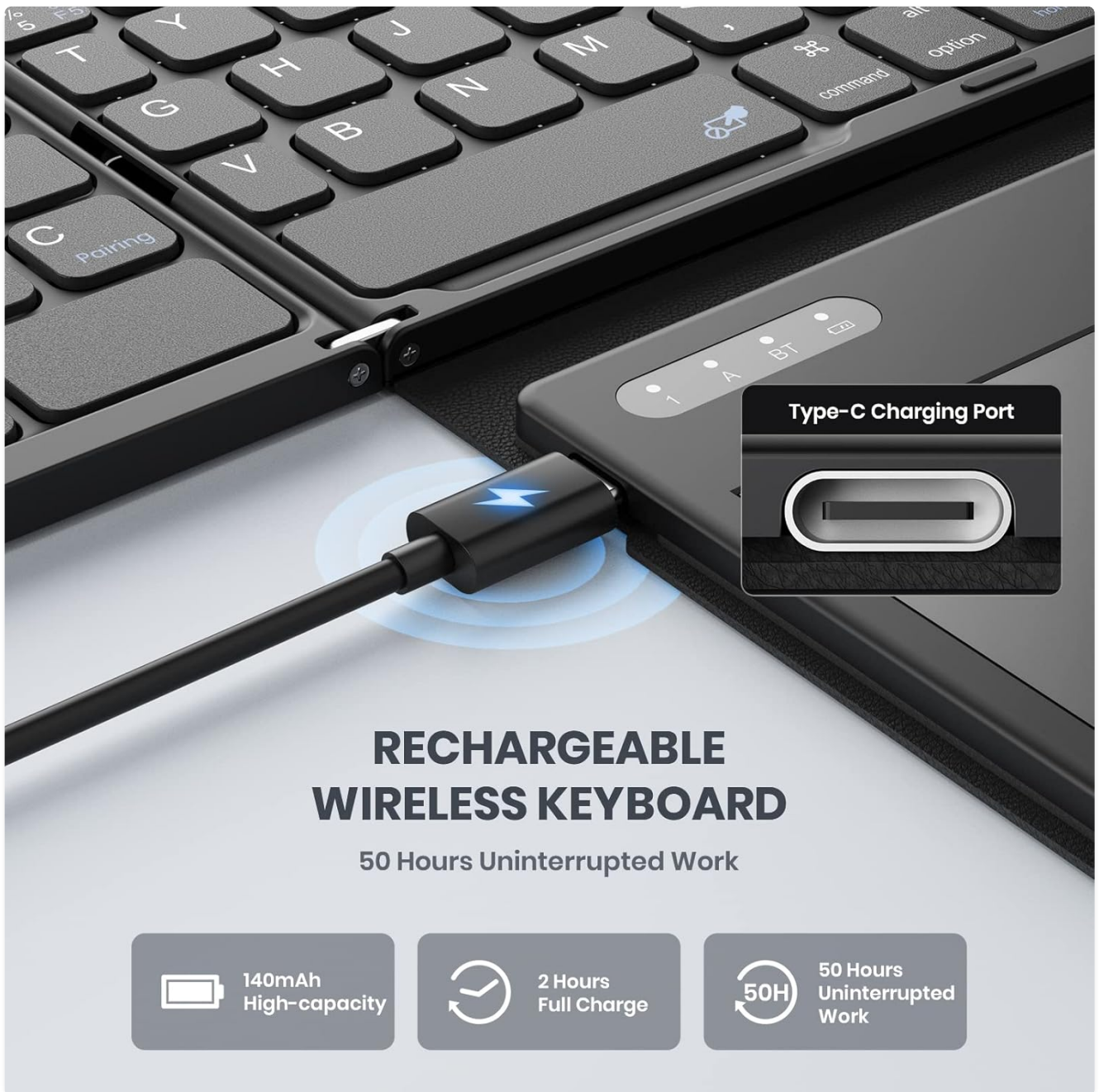
Image: Close-up of the keyboard's Type-C charging port with a USB cable connected, illustrating the charging process.

A full charge takes approximately 2 hours and provides up to 50 hours of continuous use.