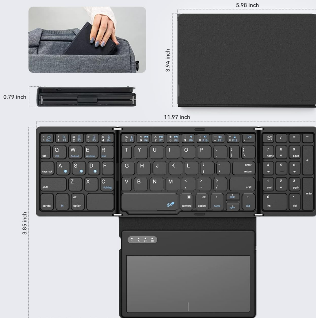
Image: Close-up view of the keyboard keys, highlighting their low-profile design for comfortable typing.