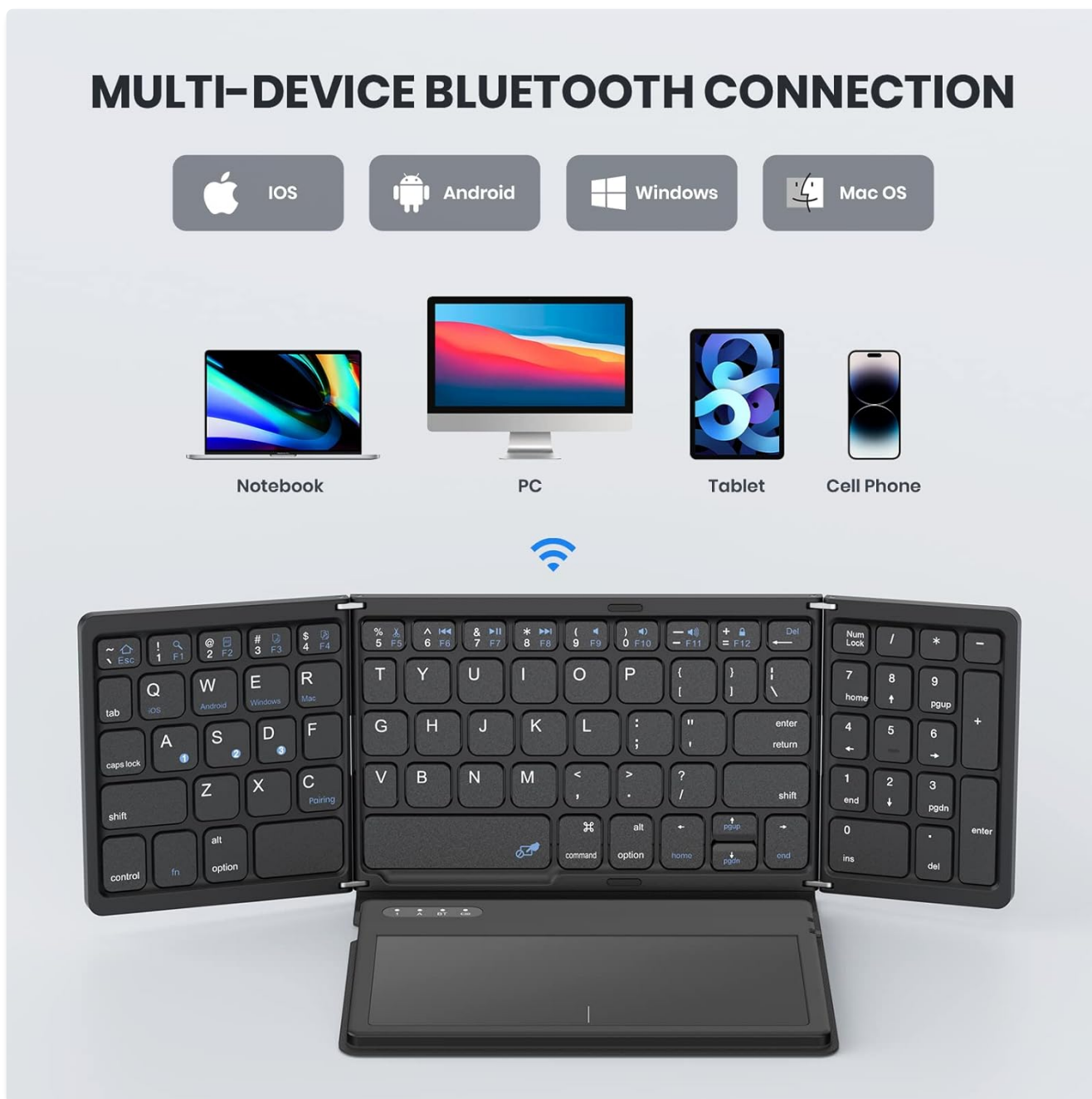
Image: Visual guide showing the FN+A/S/D keys for multi-device pairing and the Bluetooth indicator lights.