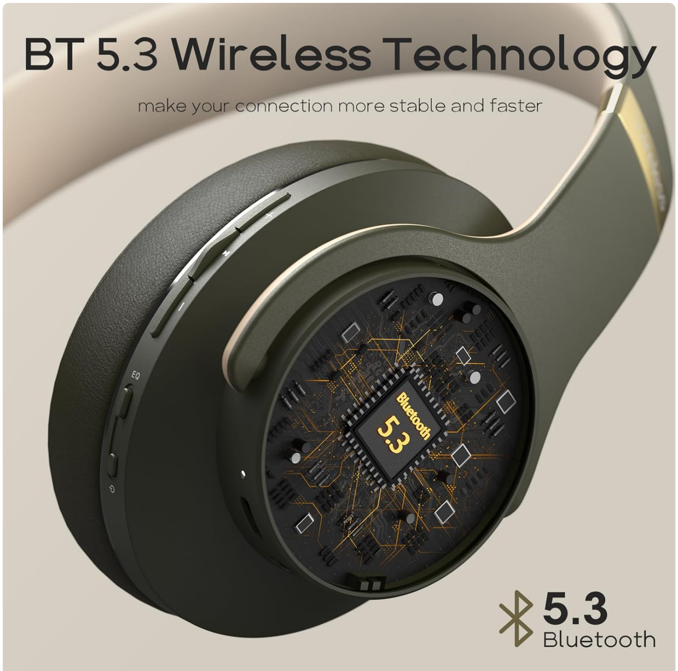
Figure 4: Advanced Bluetooth 5.3 ensures a stable and fast wireless connection.