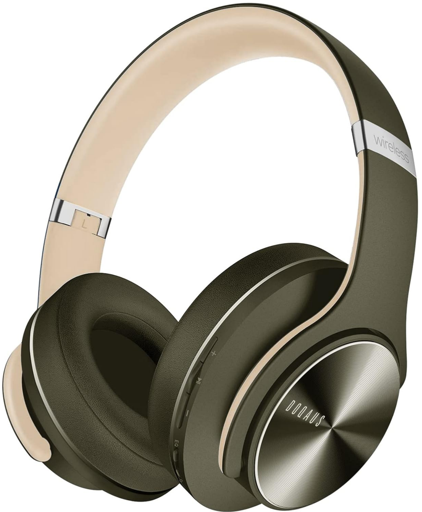
Figure 1: DOQAUS LIFE 3 Bluetooth Headphones, Green variant.