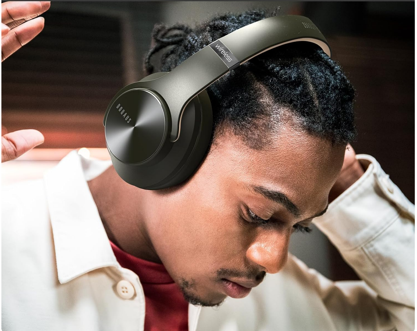
Figure 2: Adjustable headband and soft earcups ensure a comfortable fit for extended wear.

Adjustable Headband/ Silicone Pad Flexible to Fit Head Shapes