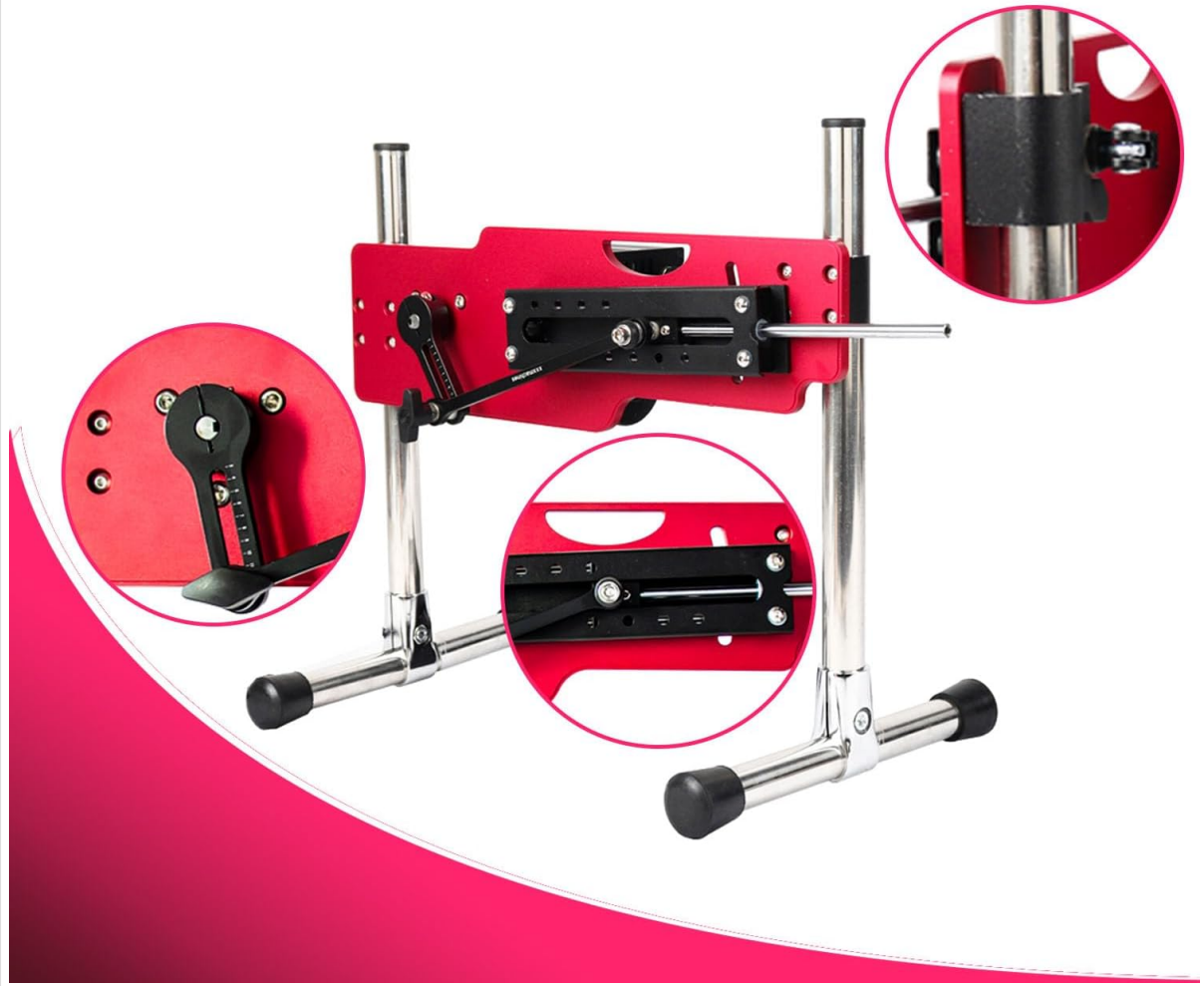
Image: Detailed view of the FREDORCH F20 machine's components and assembly points.