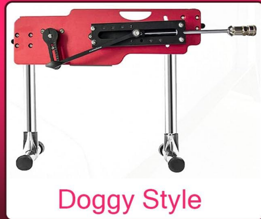
Image: Examples of various adjustable angles for the machine, including Riding Cowgirl, Missionary, Lying Flat, and Doggy Style positions.