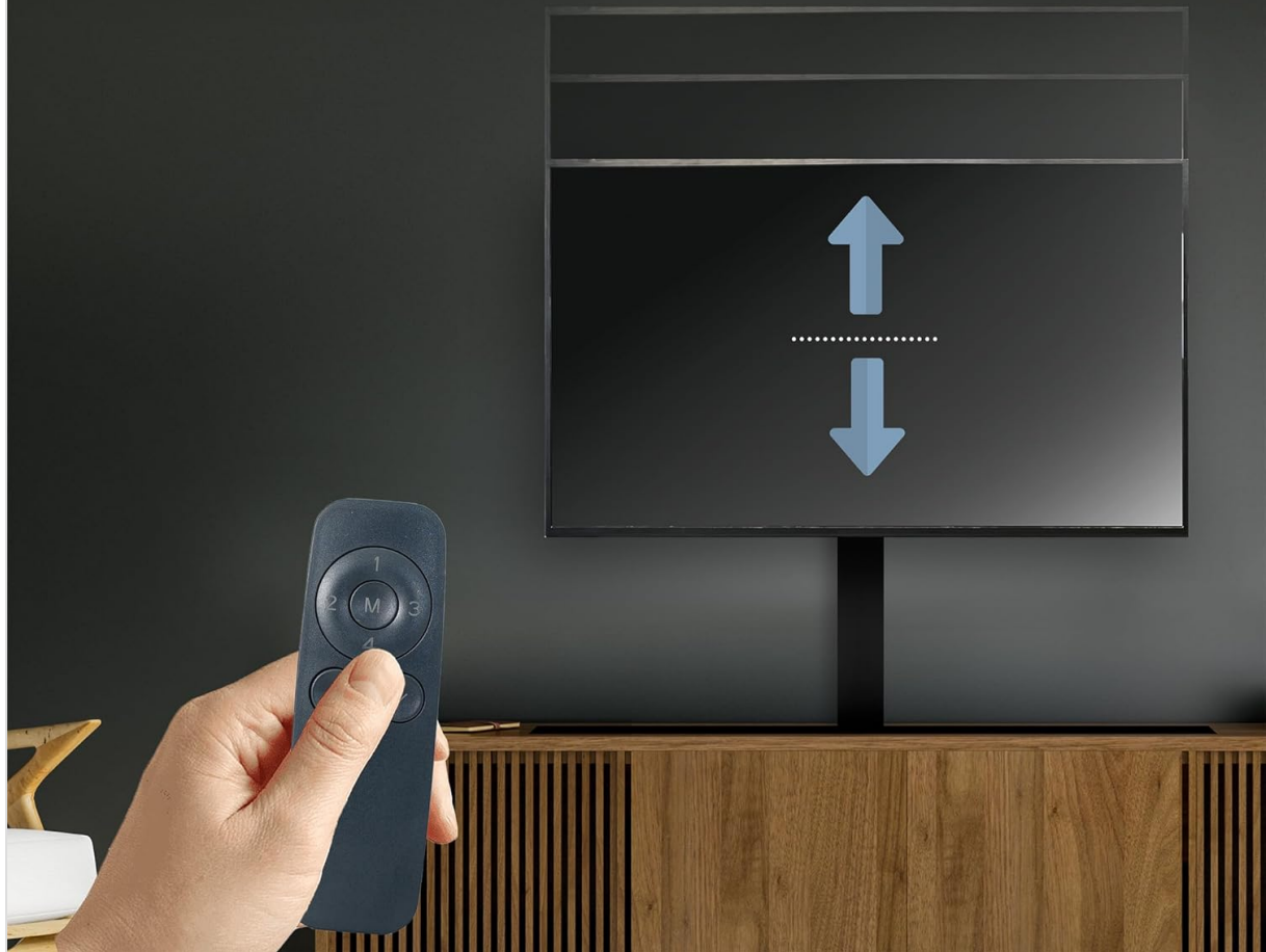
Image: Demonstrating easy height adjustments with the remote control.