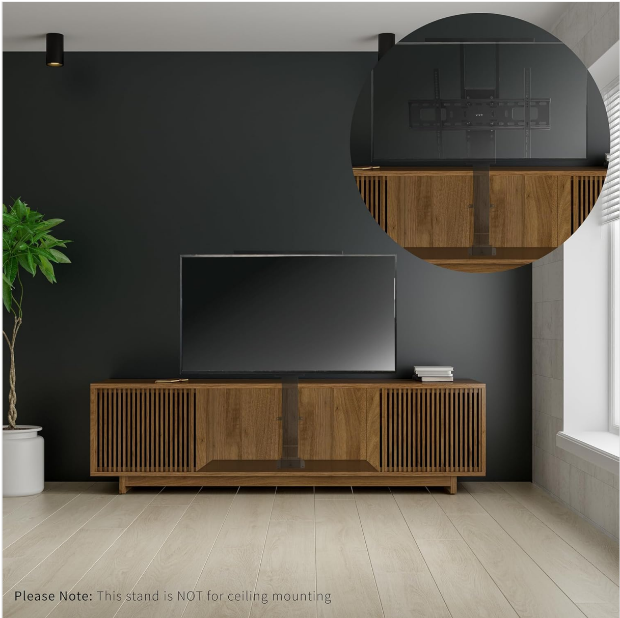
Image: Example of the TV lift stand integrated into a cabinet, with the TV in the lowered position.