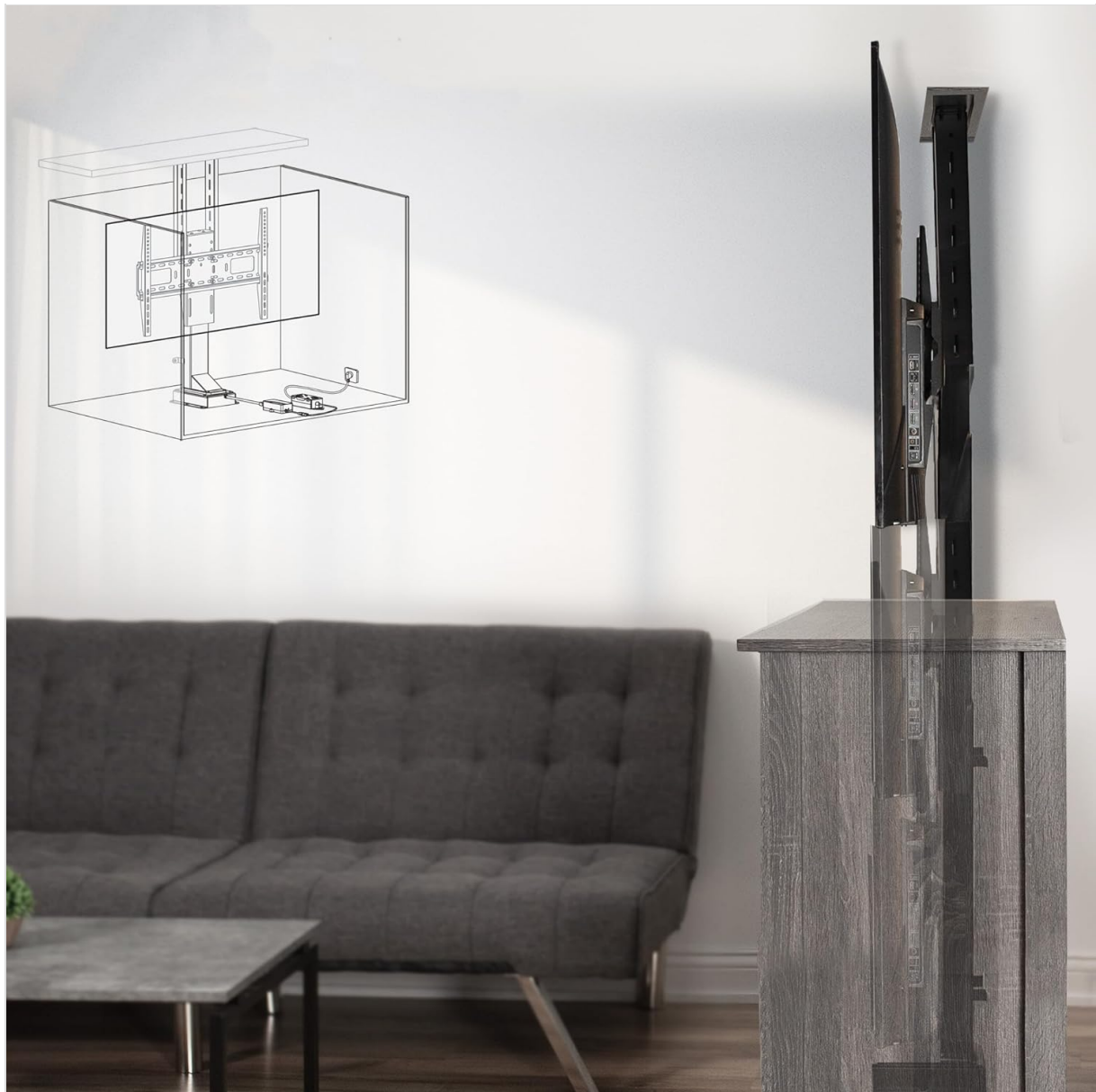
Image: Diagram illustrating the TV lift mechanism installed within a cabinet structure.

This motorized TV lift is designed for integration into a cabinet or furniture unit. Proper cabinet construction and secure mounting are essential for stability and safety.