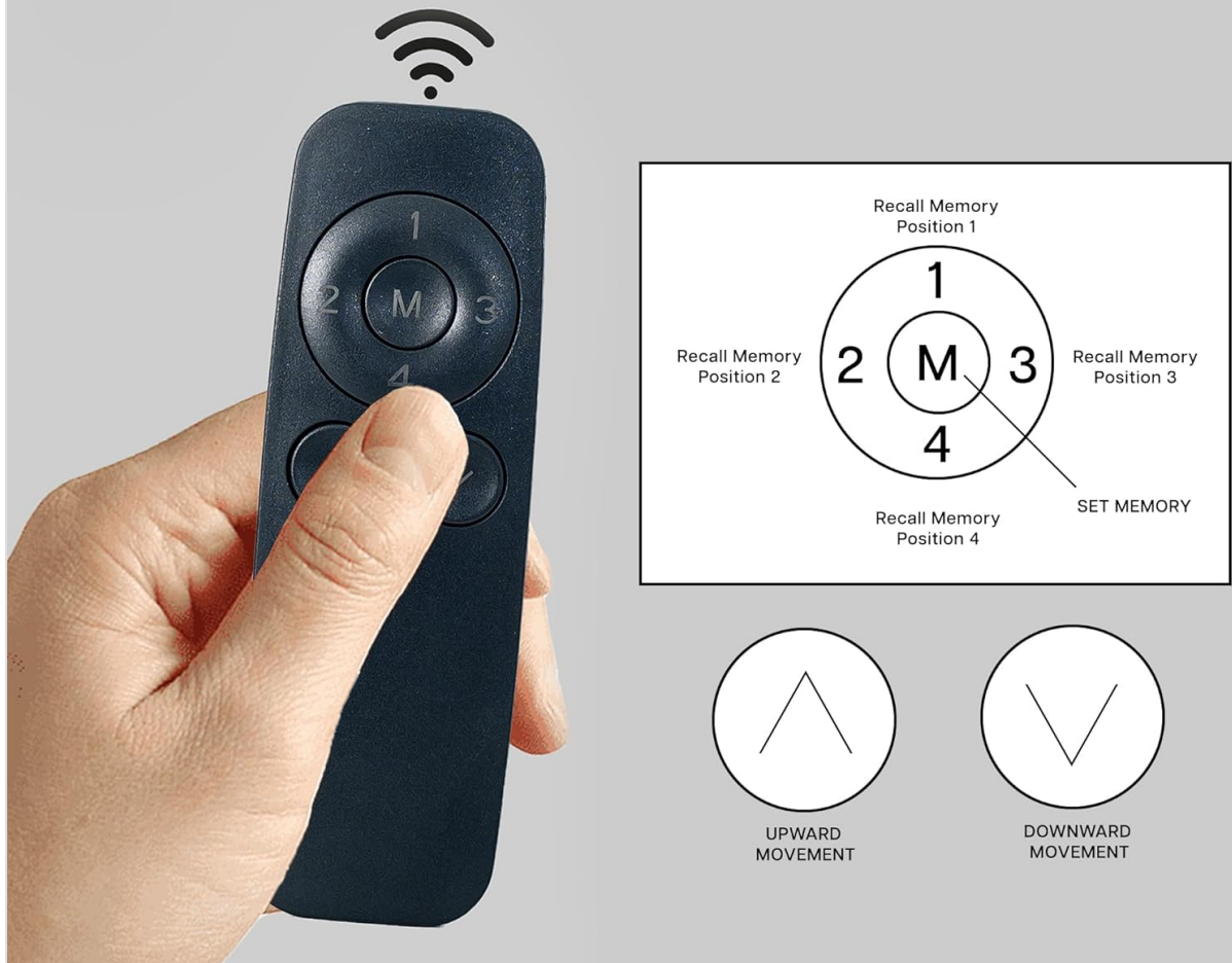
Image: Remote control layout with buttons for movement and memory presets.