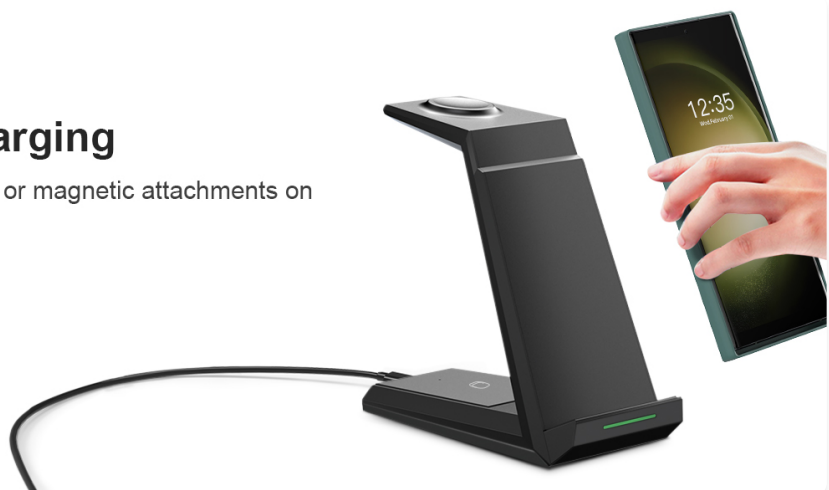
Image: Diagram highlighting the multi-protection features for safe and fast charging.

Note: Please remove all metal or magnetic attachments on the back of your phone.