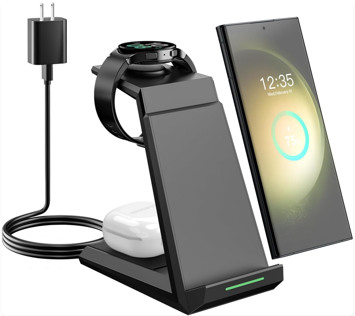
Image: The NANAMI 3-in-1 Wireless Charger in black, showcasing a Samsung phone, Galaxy Watch, and Galaxy Buds charging simultaneously on the stand.