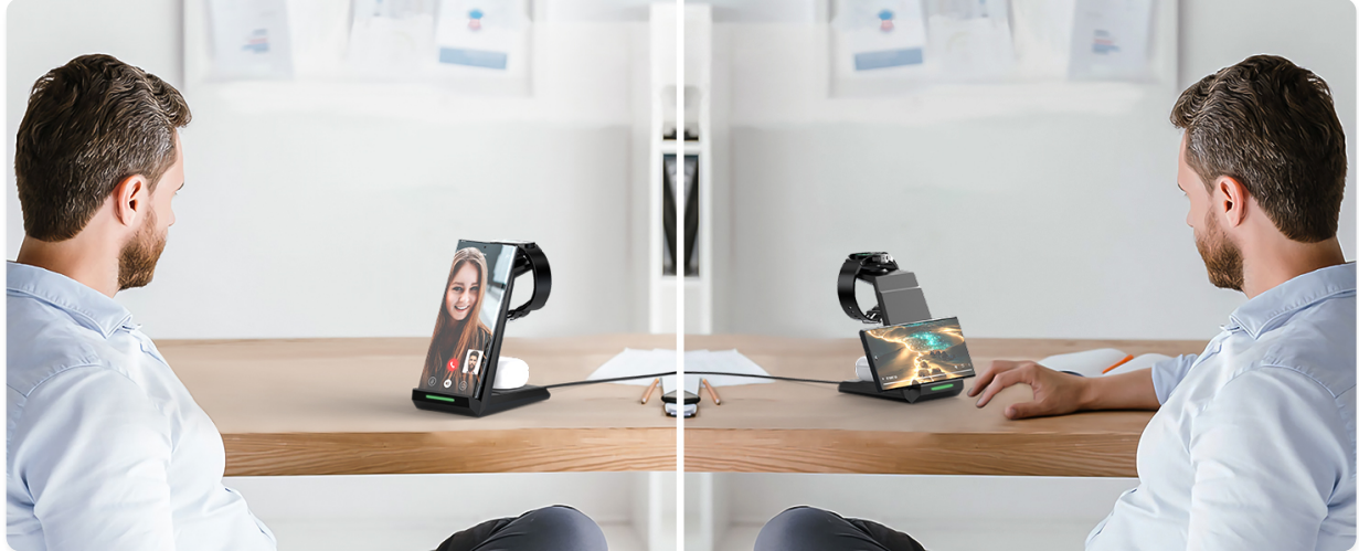
Image: A visual guide to the wide compatibility of the charging station with various devices.