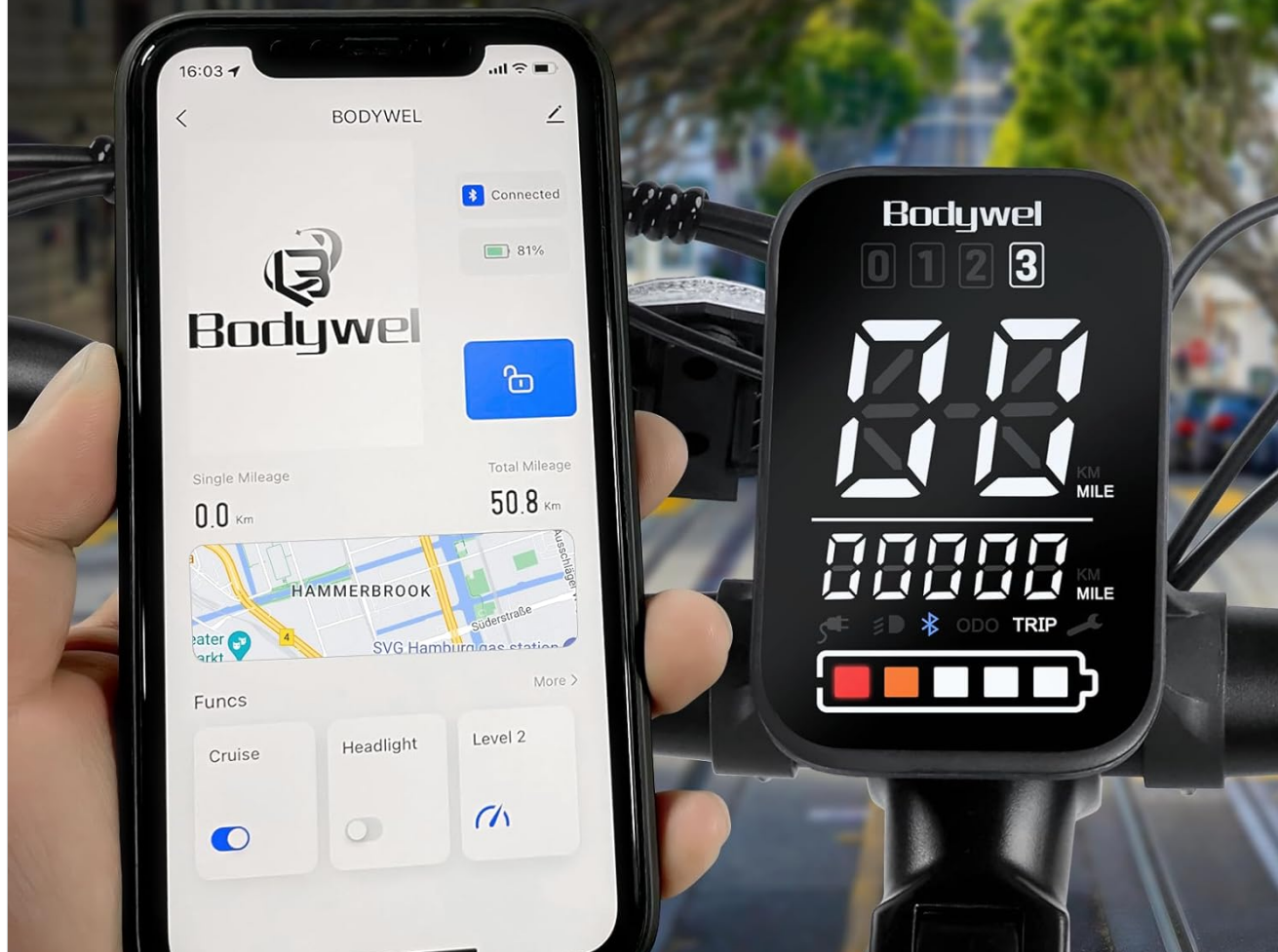
Image: The e-bike's display alongside a smartphone connected via Bluetooth, demonstrating the app's interface for managing ride functions.