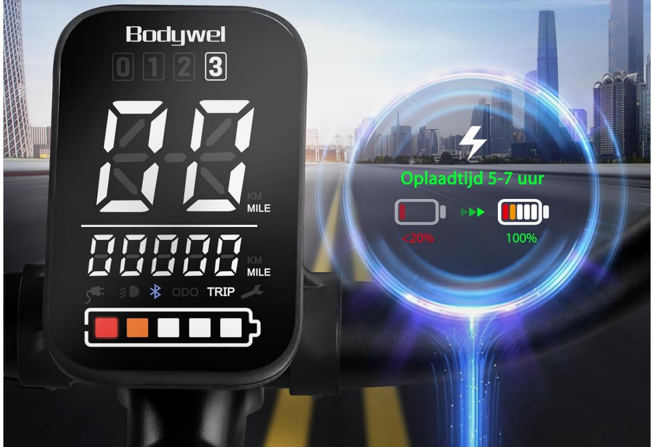
Image: The intelligent and multifunctional LED display, providing real-time information such as battery status, speed, and trip data.