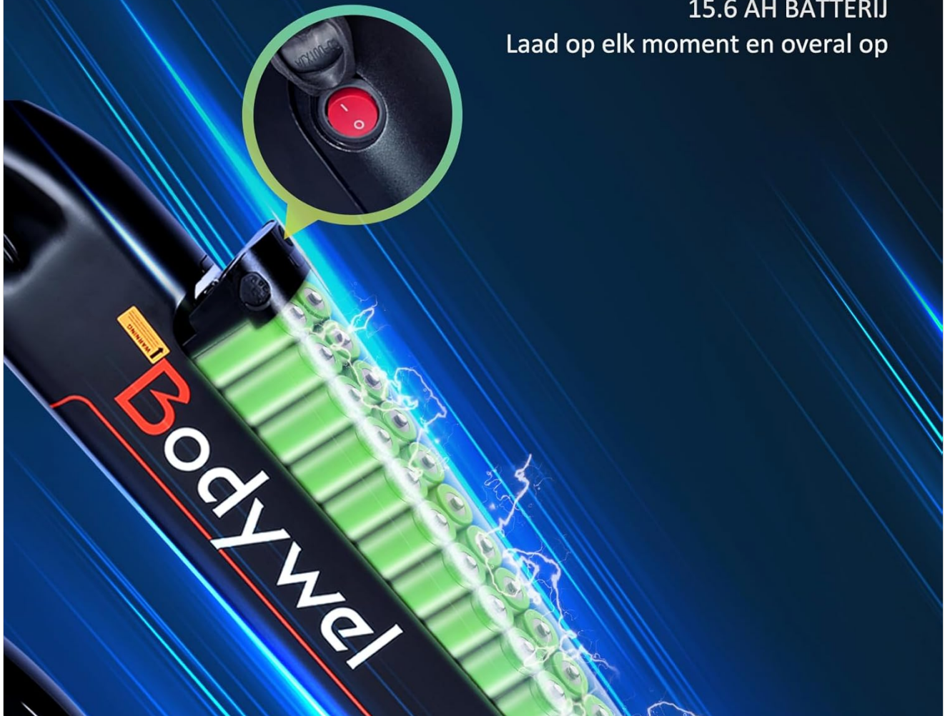
Image: The removable 15.6Ah battery, designed for flexible charging options.