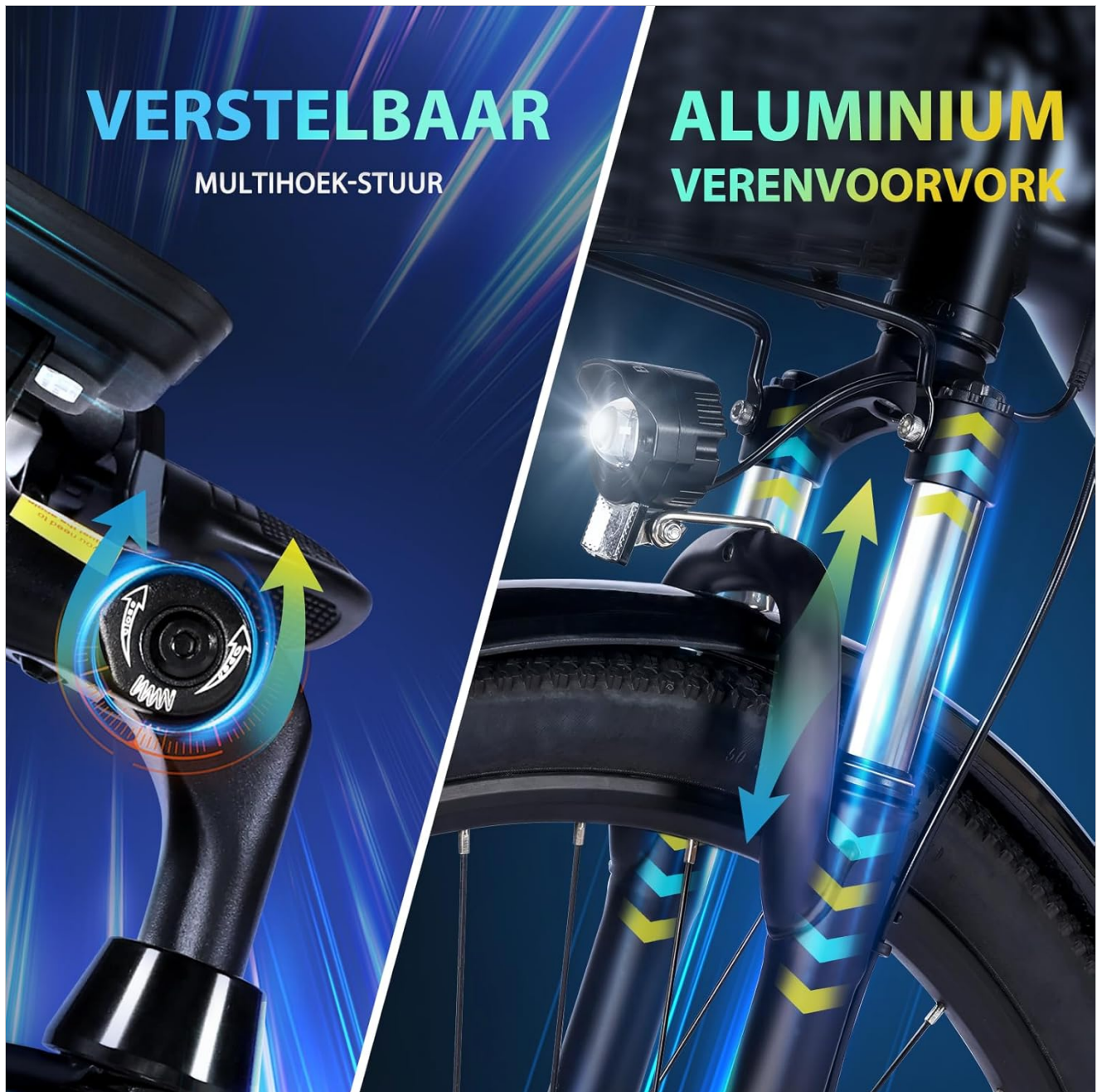
Image: Close-up of the adjustable multi-angle handlebar and aluminum suspension fork, highlighting ergonomic features.

Insert the handlebar stem into the fork tube. Adjust the height to your preference and tighten the stem bolt. Attach the handlebar to the stem, ensuring it is centered and the brake levers and shifters are in a comfortable position before tightening the handlebar clamp bolts.