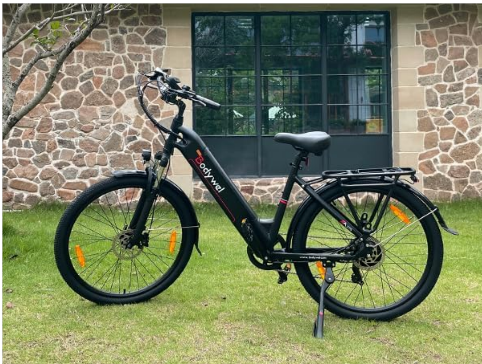
Image: The Bodywel A275 Electric Bicycle with its kickstand deployed, showcasing the stable upright position.

Attach the kickstand to the designated mounting points on the bicycle frame using the provided bolts and Allen key. Ensure it is securely tightened.