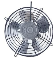
High-quality Cooling Fan