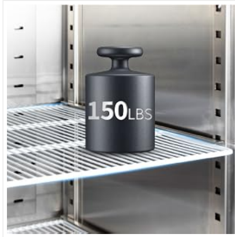
Each shelf is designed to support up to 150 lbs.