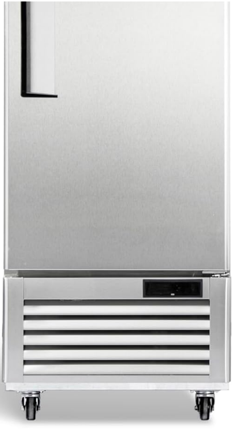
Front view of the ICECASA Commercial Freezer, showcasing its stainless steel exterior and single solid door design.