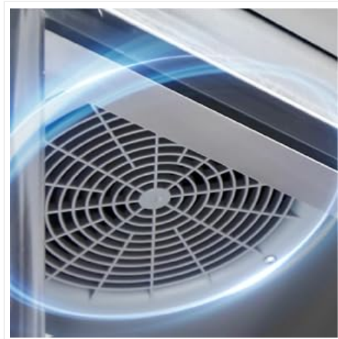
Detail of the smart fan stop switch, which activates when the door is opened to conserve energy.