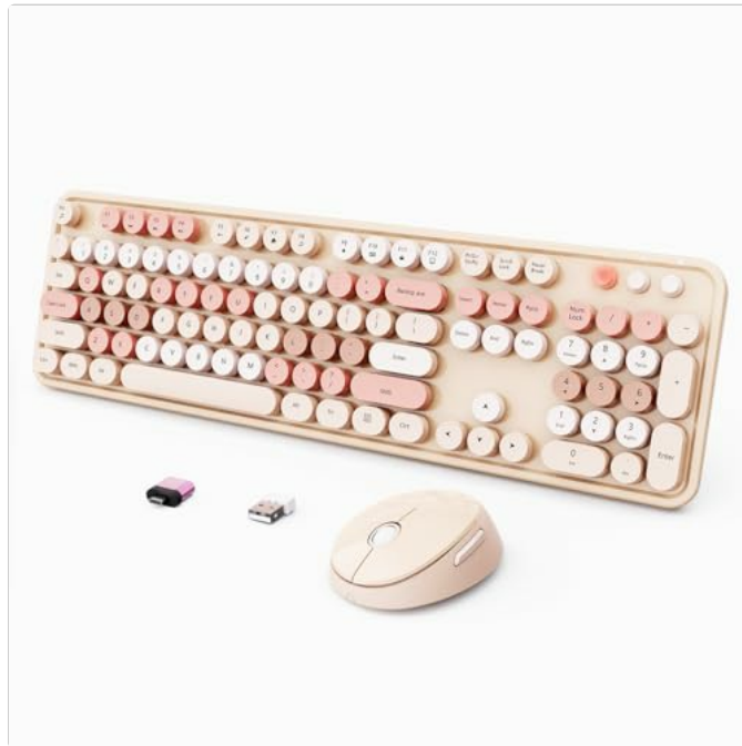
Image: Demonstrates the USB receiver and Type-C adapter for broad compatibility with different computer ports.