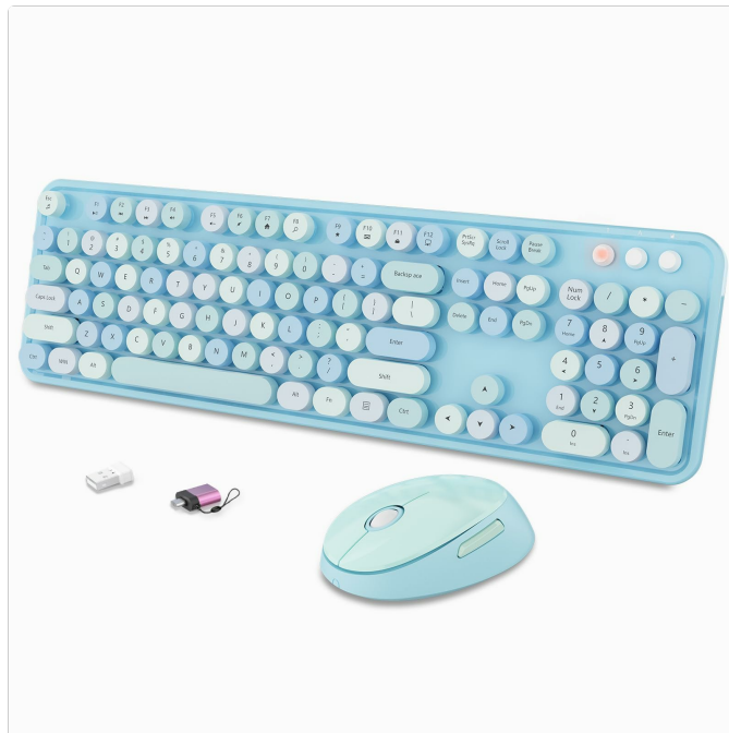
Image: The SkyGive Wireless Keyboard and Mouse Combo, showing the keyboard, mouse, and USB receiver with a Type-C adapter.