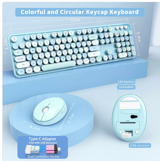
Image: Underside of the wireless mouse, illustrating the battery compartment and the slot for the USB receiver.