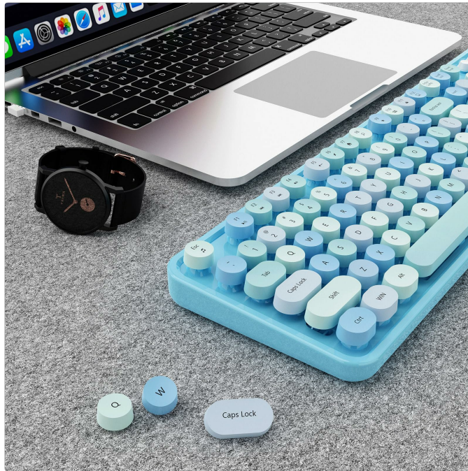
Image: Close-up view of the keyboard demonstrating removable keycaps, facilitating easy cleaning and maintenance.