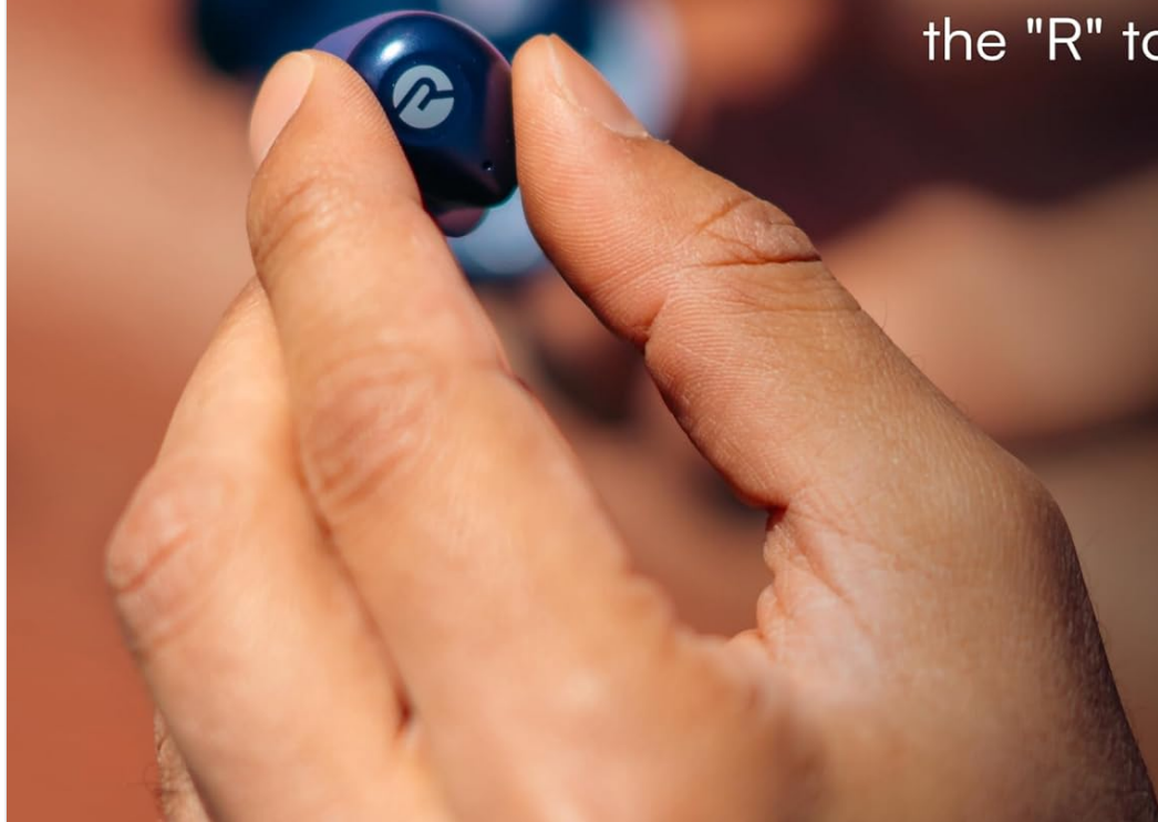
Image: Close-up of an earbud demonstrating the touch control functionality.

Easily manage your music, sound profiles, and voice assistant using the "R" touch pad.