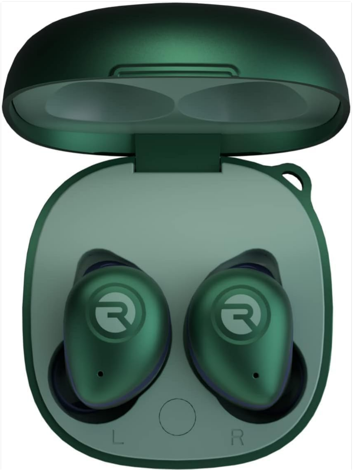
Image: Raycon Fitness Earbuds in their open charging case, ready for setup.