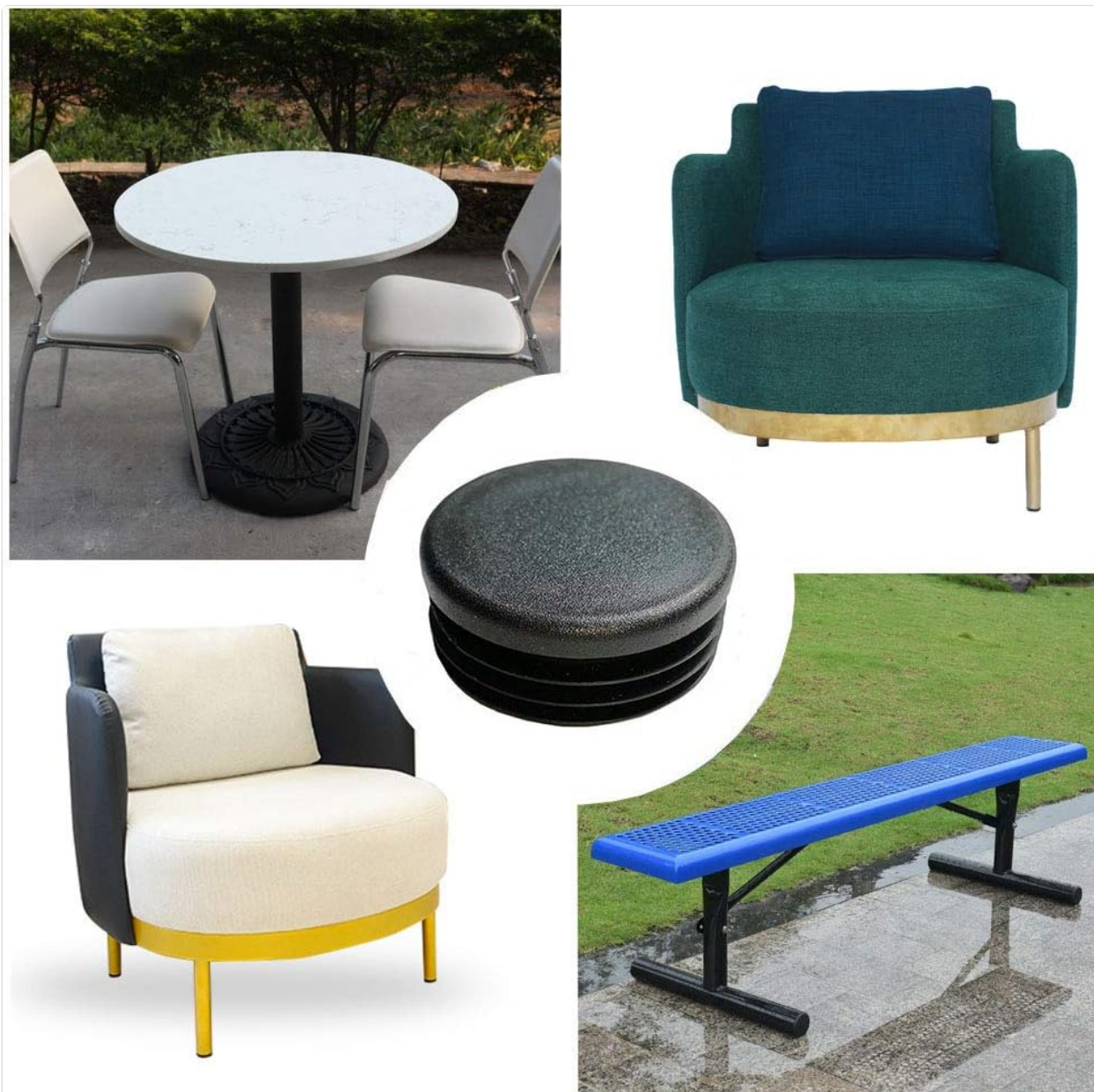
Image: A collage showing various applications of the plugs on furniture, including tables, chairs, and benches.