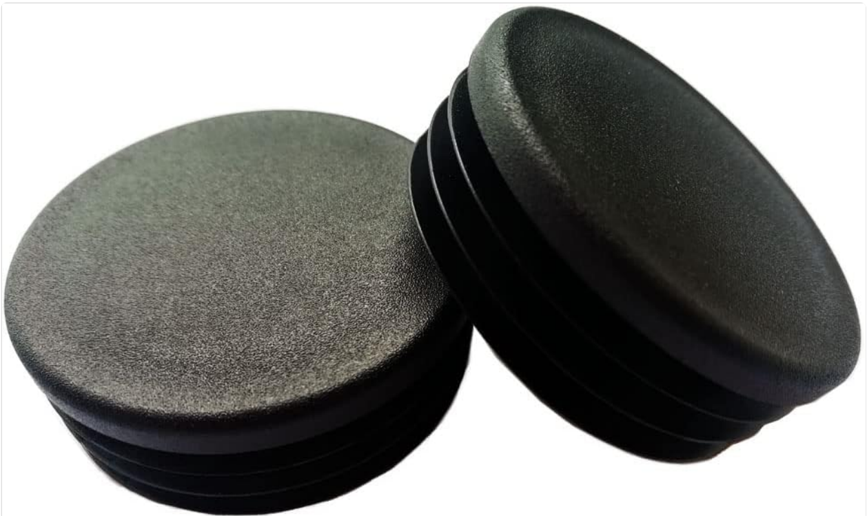
Image: Two CaSuTong 1 3/4 inch round plastic plugs, black, showcasing their ribbed design for a secure fit.

The CaSuTong 1 3/4 Inch (45mm) Round Plastic Plugs are designed as durable and versatile end caps for round metal tubing. These plugs provide protection against scuffs on surfaces, act as glides for furniture, and offer a clean, finished look for various applications. They are engineered to withstand impact and harsh weather conditions, ensuring long-lasting performance.