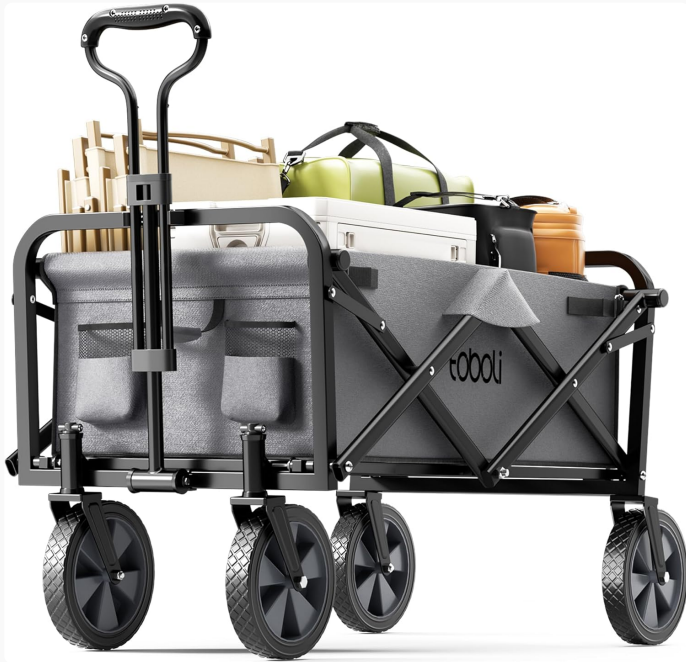
Image: The Toboli Foldable Handcart in its open configuration, loaded with bags and other items, demonstrating its capacity for transport.