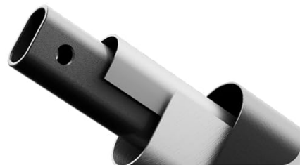
Image: Details highlighting the handcart's reliable and durable construction, including the water-resistant 600D Oxford fabric and the sturdy metal frame.