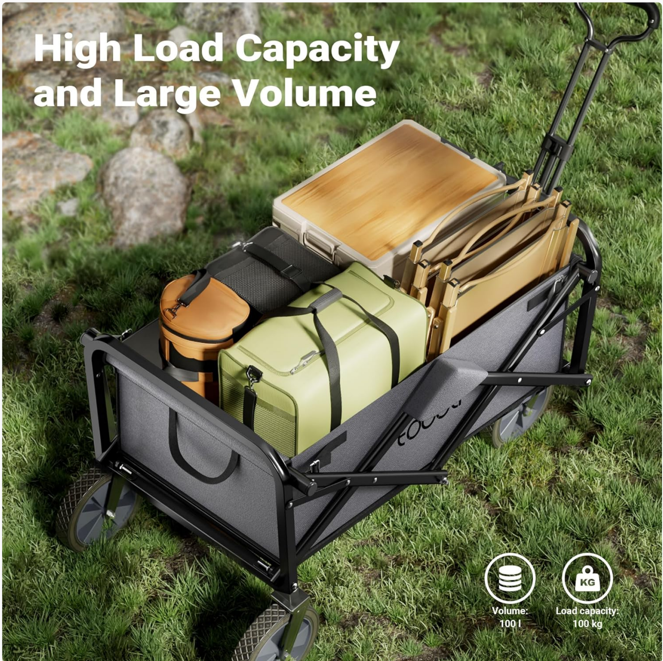
Image: The handcart filled with various items, illustrating its high load capacity and large volume, with icons indicating 100L volume and 100kg maximum load.