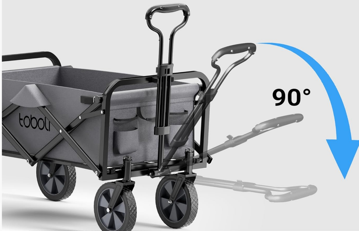
600D Oxford fabric