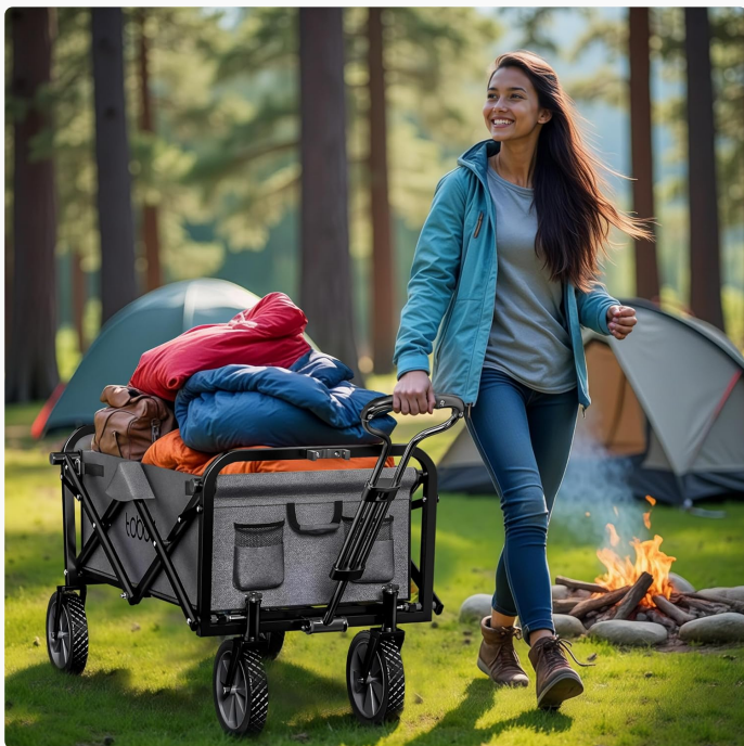
Image: A person pulling the Toboli Handcart, which is loaded with camping gear, through a grassy area near tents, highlighting its use for outdoor activities.