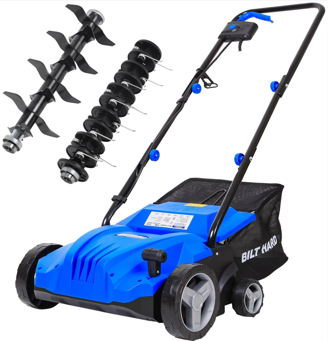
Figure 3.1: Overview of the BILT HARD Electric Dethatcher Scarifier with both dethatching and scarifying rollers.