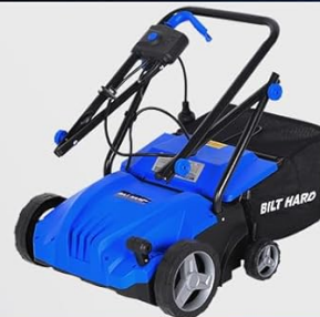
Figure 3.3: Illustration of the 4-position depth adjustment mechanism, indicating different settings for dethatching and scarifying.

The Space-Saving Solution for Compact Storage