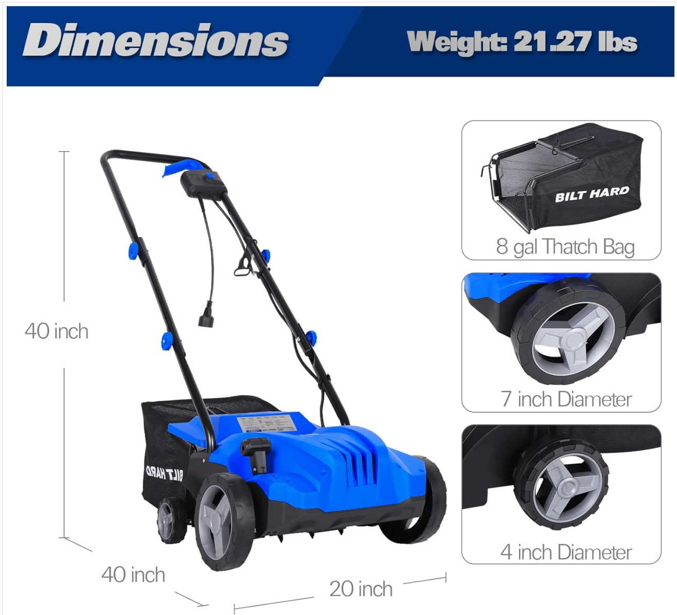
Figure 5.1: The scarifying roller cuts into the grassroots for aeration, while the dethatcher roller efficiently picks up surface thatch.