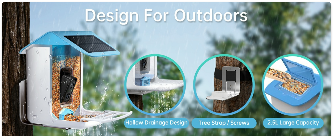
Figure 3: Installation methods and design features.