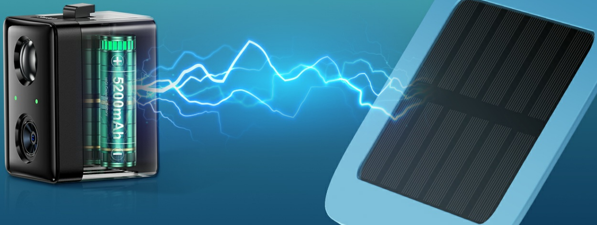
Figure 4: Solar panel and battery power system.