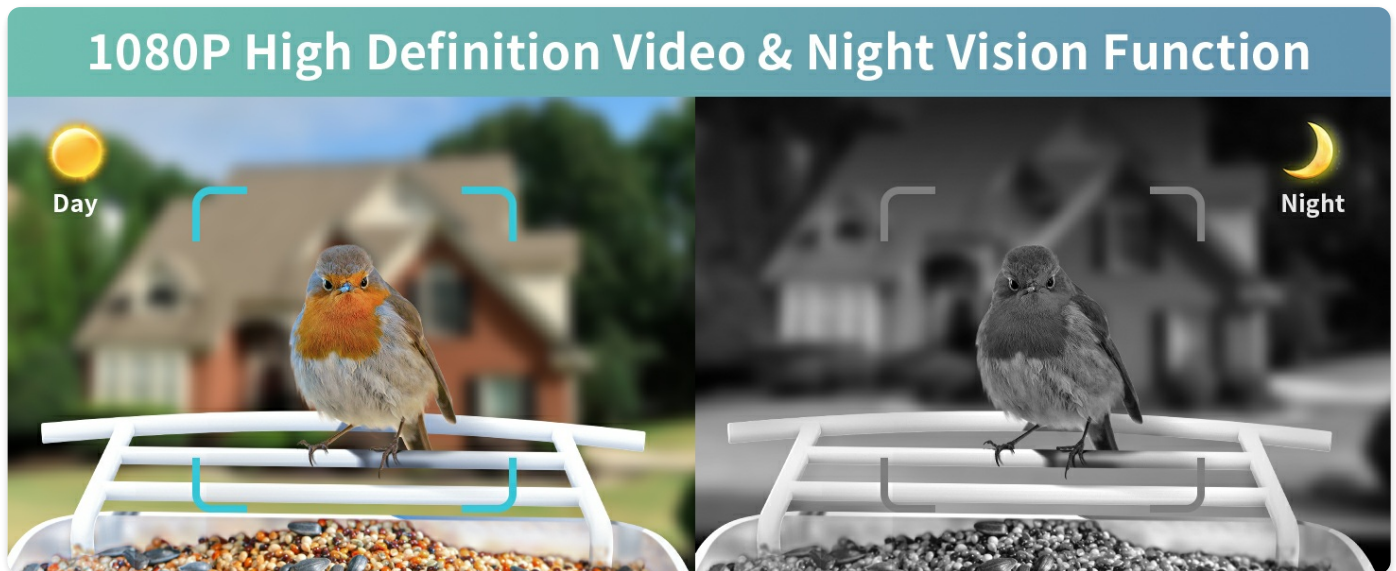
Figure 9: Day and night vision capabilities.

The camera features built-in infrared illumination, ensuring clear HD bird videos even in low-light conditions or at night.