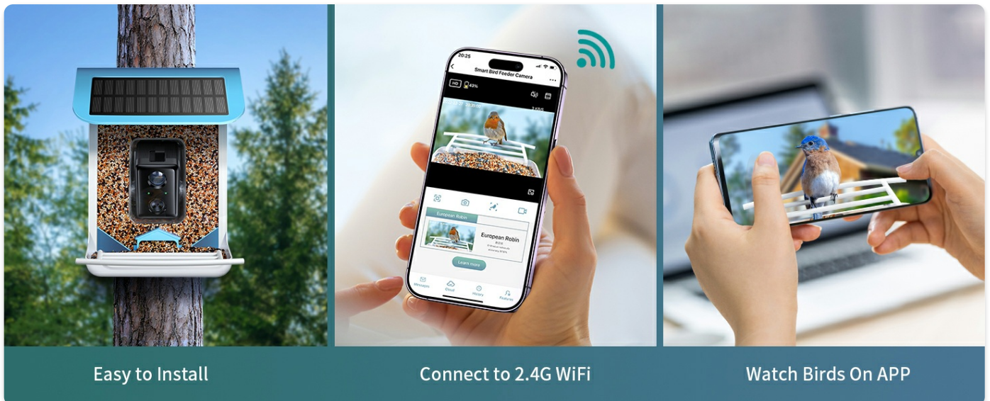
Figure 5: Steps for installation, Wi-Fi connection, and app usage.