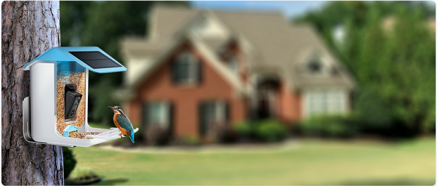
Figure 2: Ideal placement for the bird feeder in a sunny location.

Select a location that receives ample direct sunlight throughout the day to maximize solar charging efficiency. The feeder should also be positioned where it has a clear view of the birds and is within range of your 2.4GHz Wi-Fi network for stable connectivity.