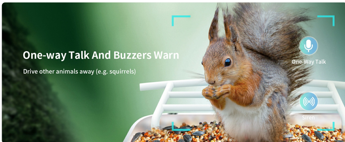
Figure 10: Features to deter squirrels and other pests.