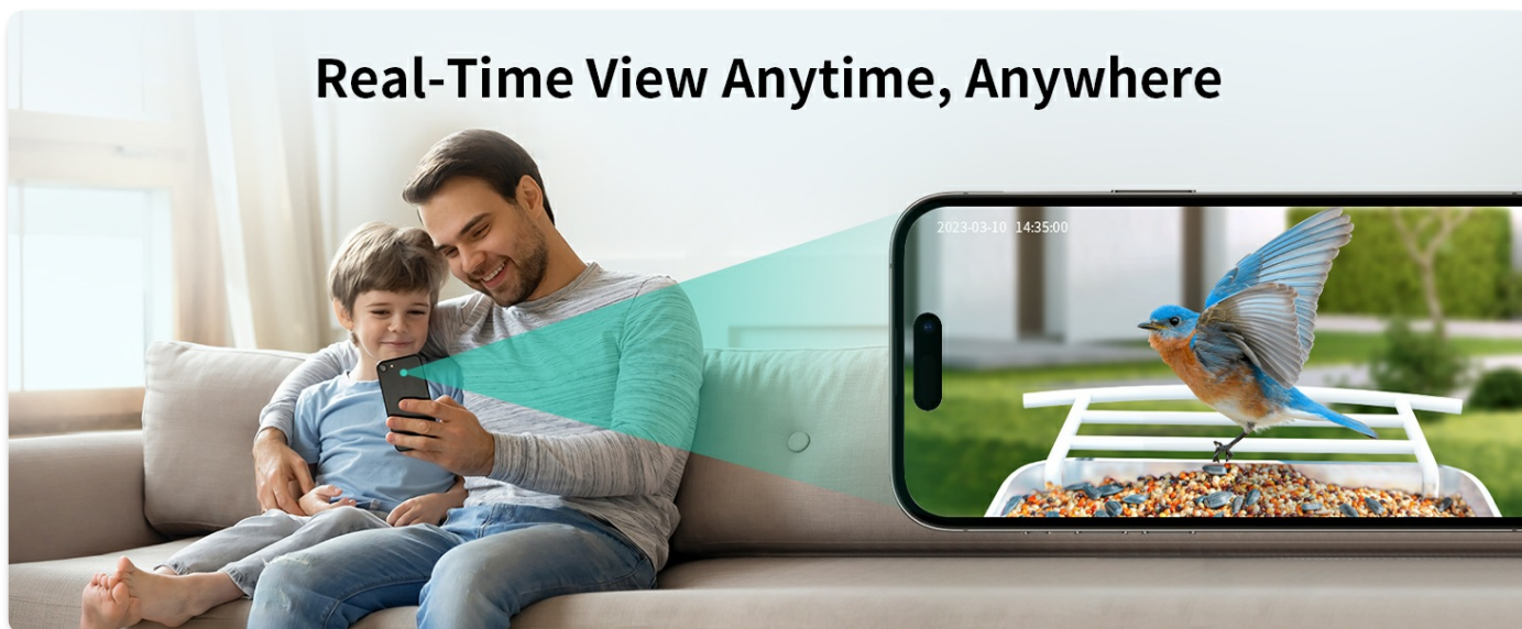
Figure 6: Real-time bird watching via the mobile application.

Once connected, the Vziwry app provides real-time notifications when birds are detected. You can view live video streams of your bird feeder from anywhere, at any time.