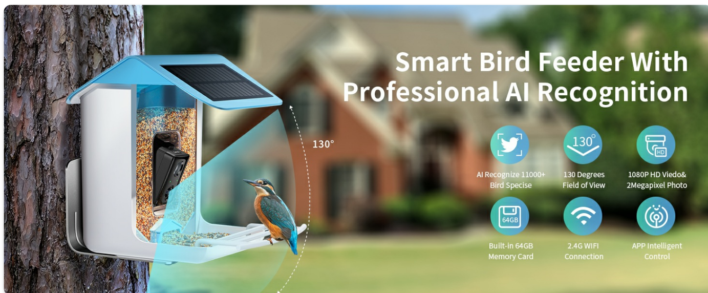
Figure 7: AI bird recognition in action.

The built-in AI intelligent chip can recognize over 11,000 bird species through professional algorithms. When a bird is detected, the app will attempt to identify it and provide a Wikipedia link for more detailed information. You can save identified birds to your bookmarks for future reference.