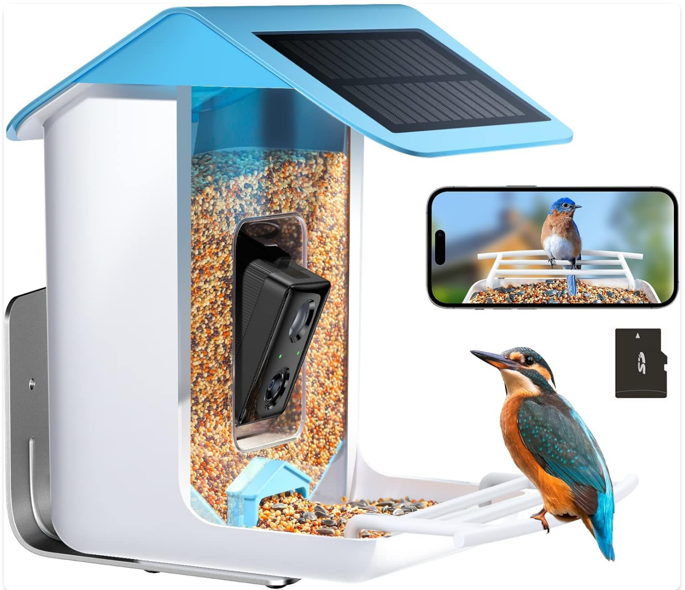
Figure 1: Vziwry Smart Bird Feeder with Camera components.