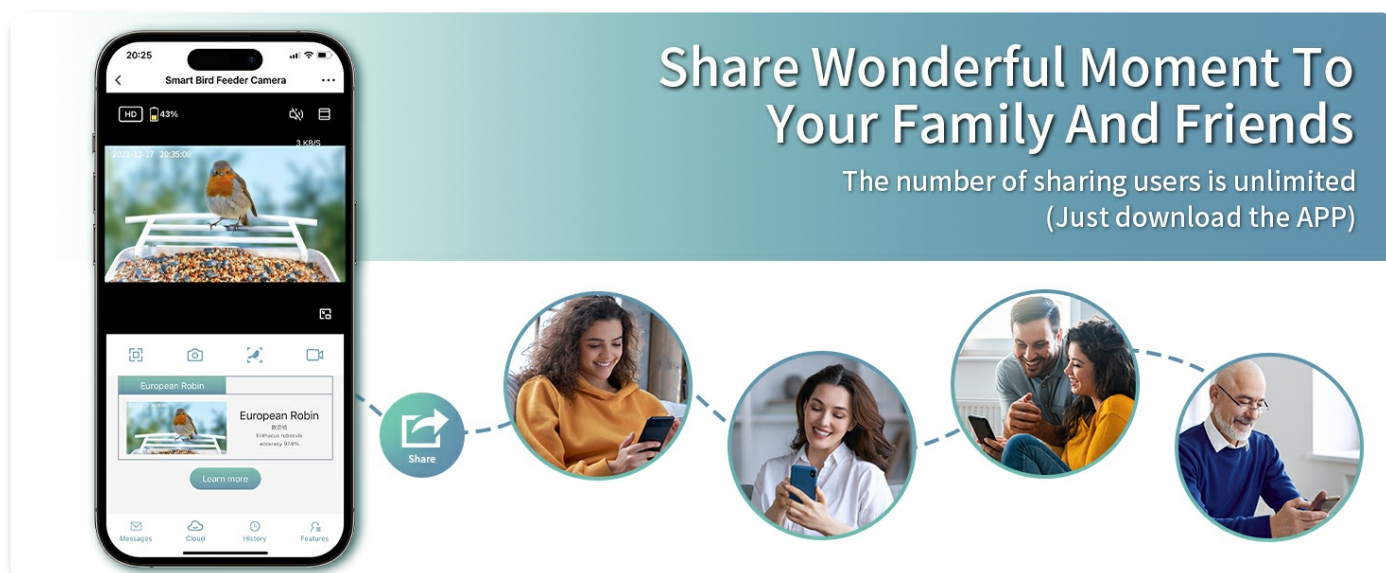
Figure 11: Sharing captured bird moments with others.

The Vziwry app allows you to easily share captured videos and photos with family and friends, enabling them to enjoy the bird-watching experience as well.